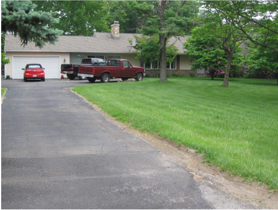
HR #174, 1259 Wilmington Pike.