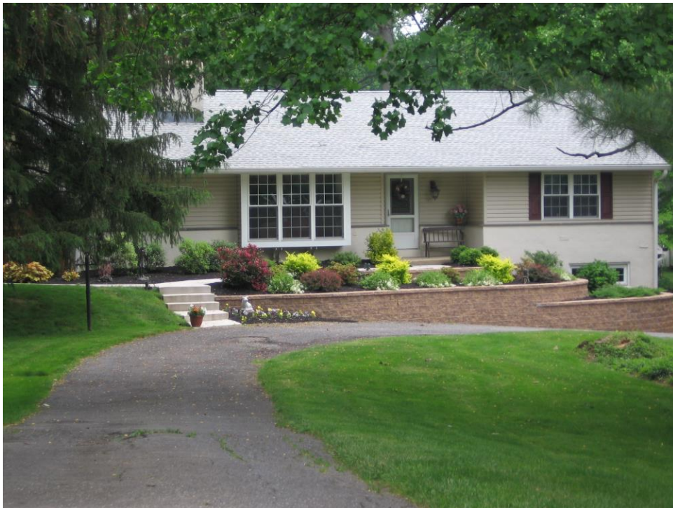
HR #175, 1261 Wilmington Pike.