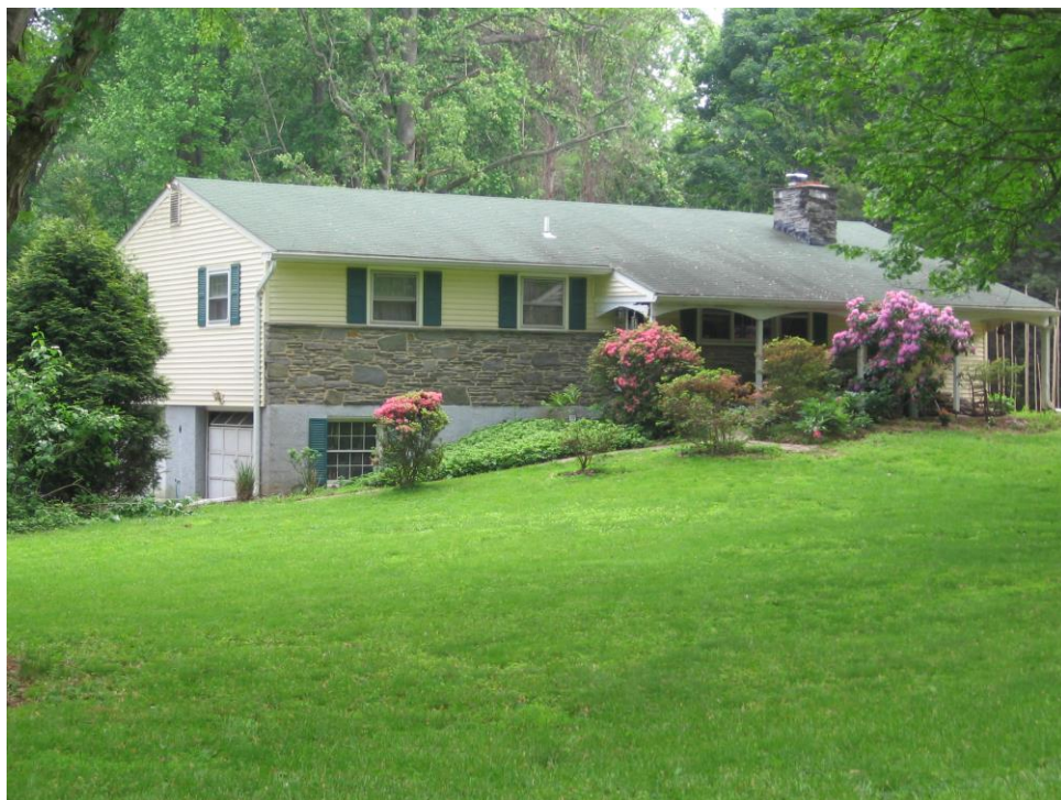
HR #170, 1245 Surrey Rd..