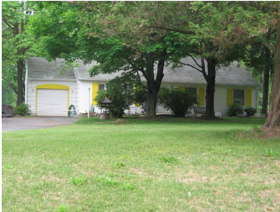
HR #123, 3 Green Tree Dr.