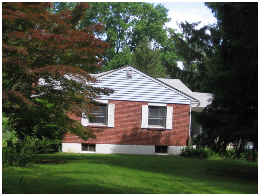
HR #114, 221 Green Tree Dr.