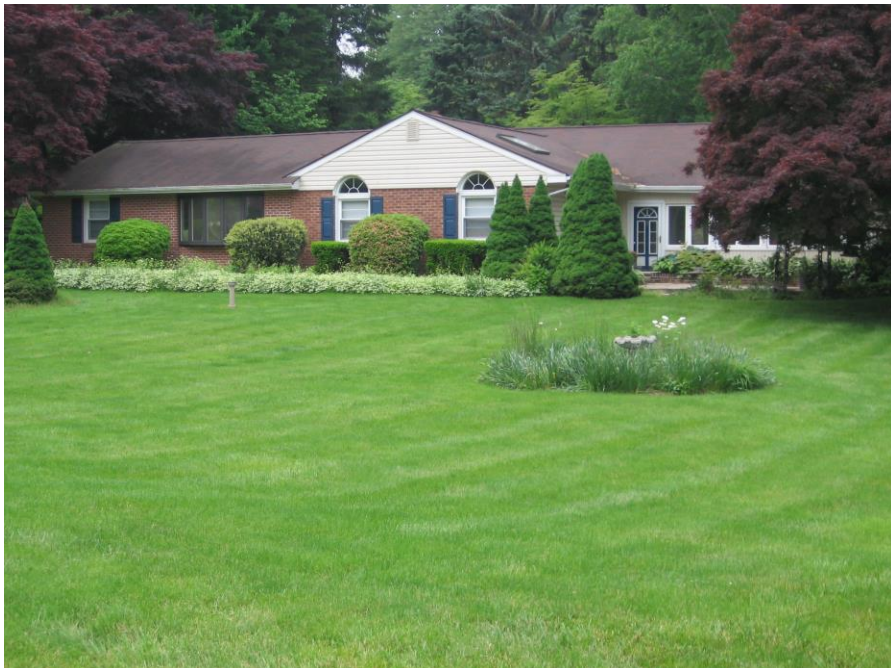
HR #064, 1254 Audubon Rd.