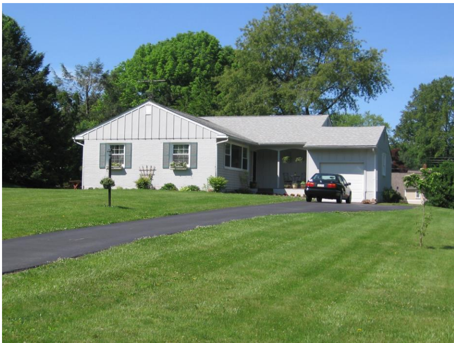
HR #105, 1260 Audubon Rd.