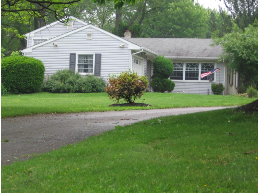
HR #062, 1251 Wilmington Pike