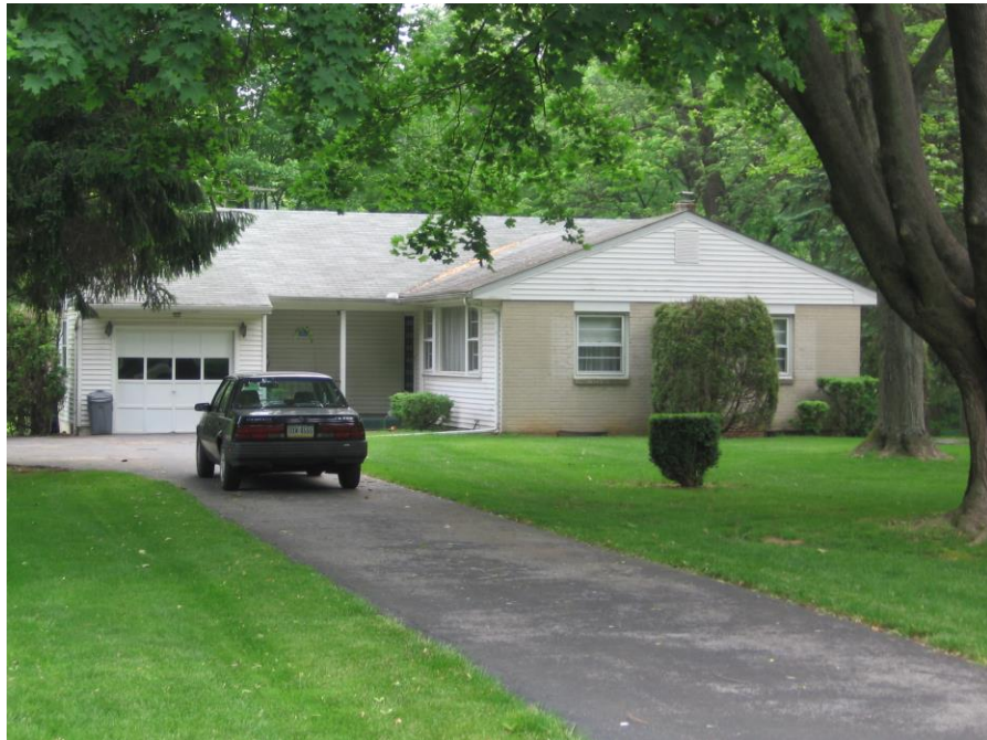
HR #113, 1263 Buck La.