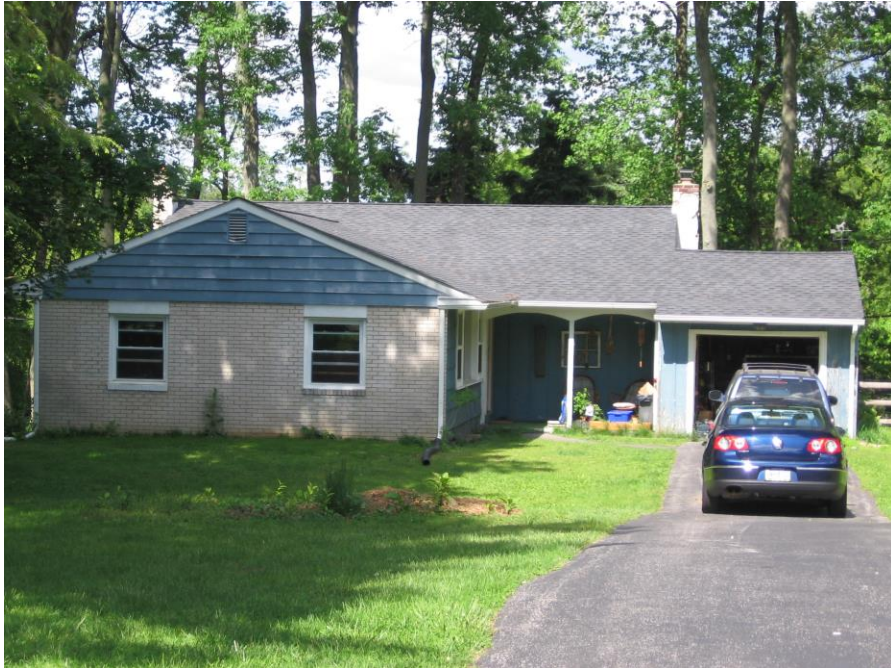
HR #079, 230 Green Tree Dr.