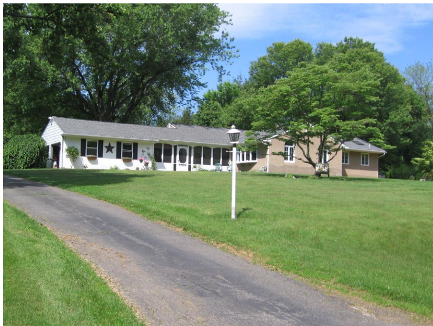
HR #074, 227 Green Tree Dr.