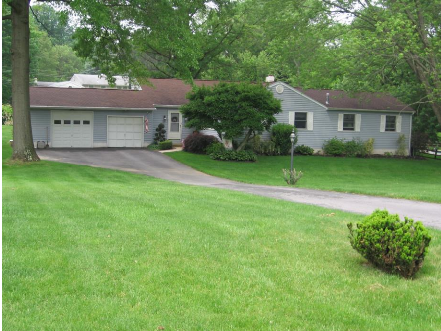
HR #106, 1258 Audubon Rd.