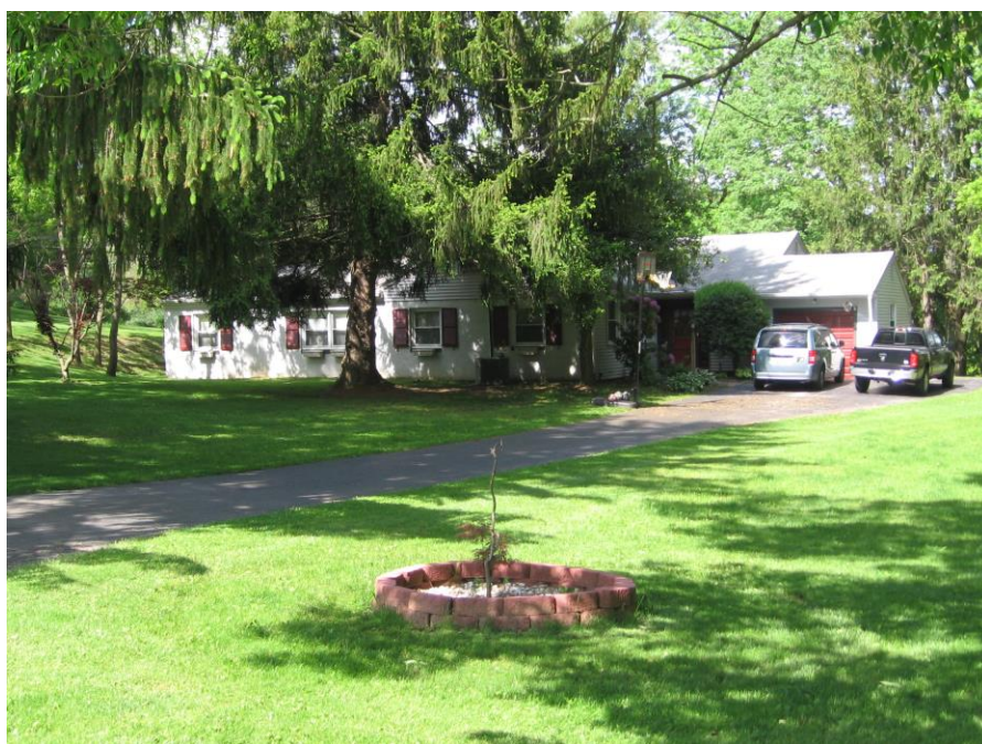
HR #078, 232 Green Tree Dr.