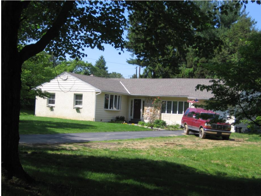
HR #065, 1252 Buck La.