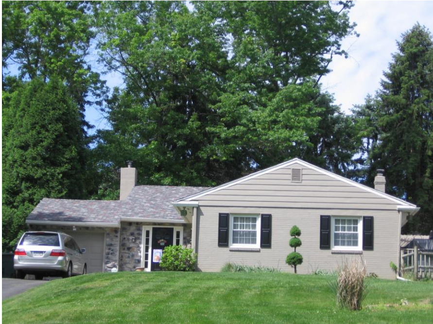
HR #156, 225 Green Tree Dr.