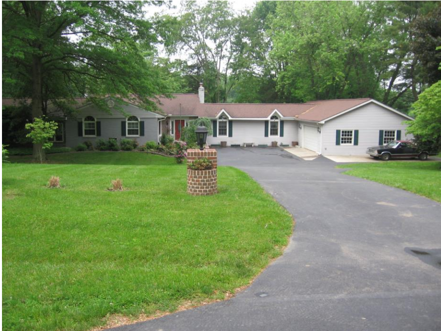
HR #068, 1258 Buck La.