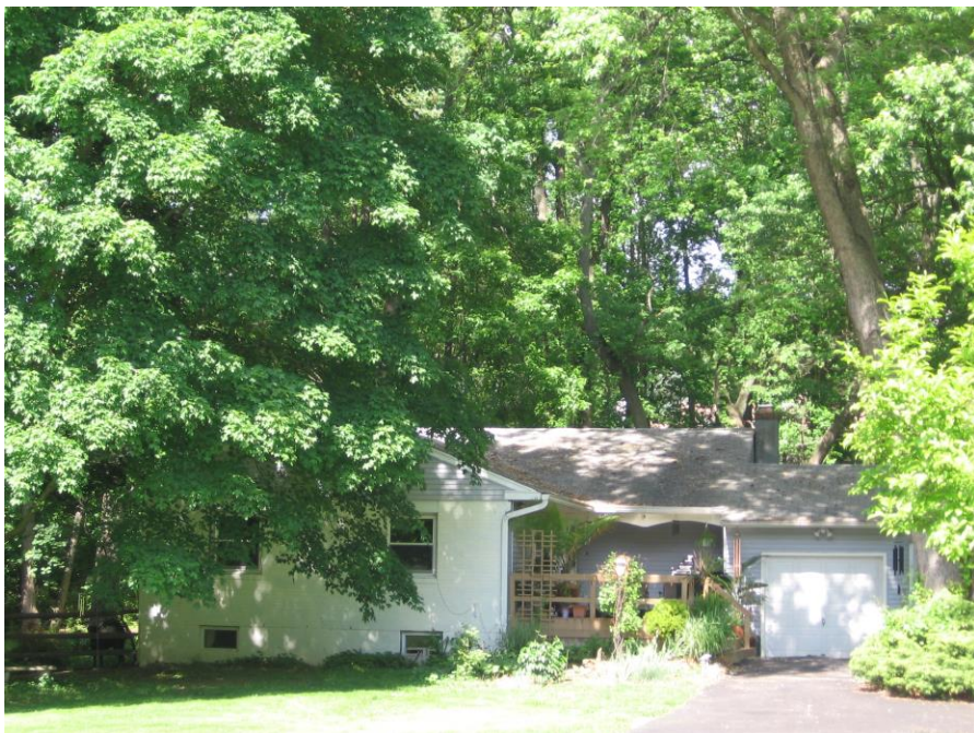
HR #080, 224 Green Tree Dr.