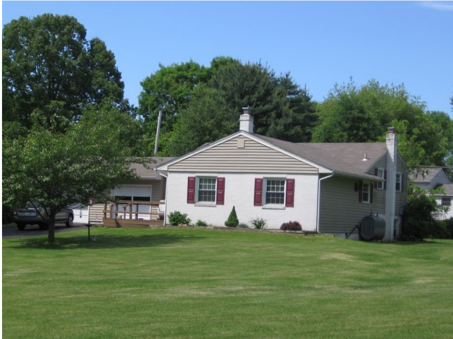
HR #072, 231 Green Tree Dr.