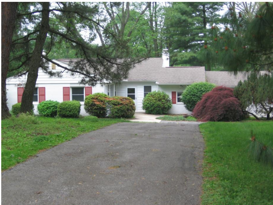
HR #067, 1256 Buck La.