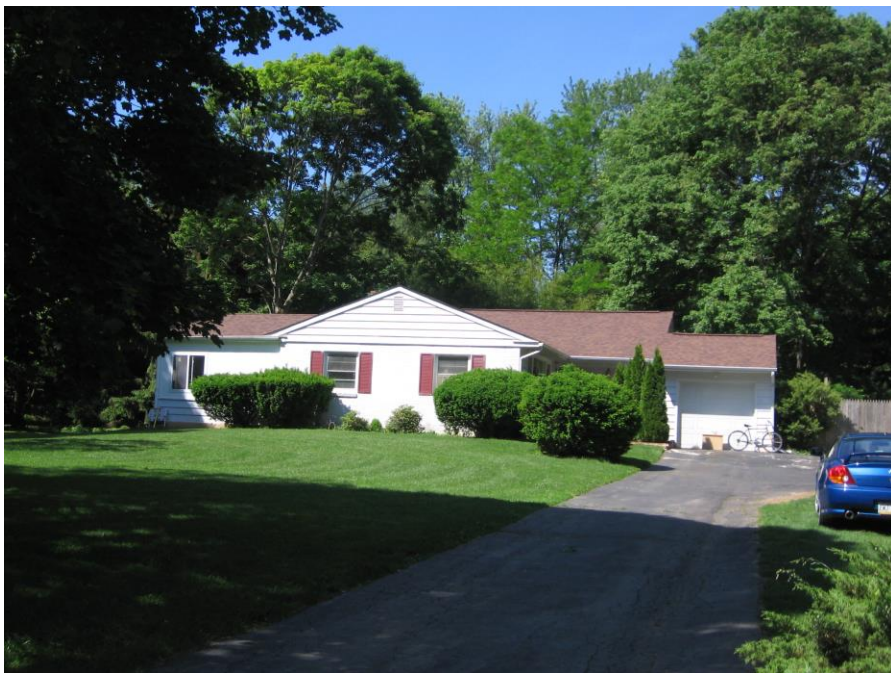
HR #109, 1264 Buck La.