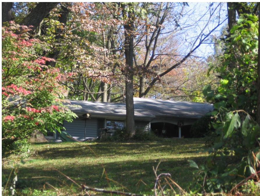
HR #060, 251 Green Tree Dr.