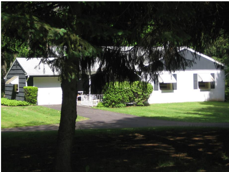
HR #158, 228 Green Tree Dr.