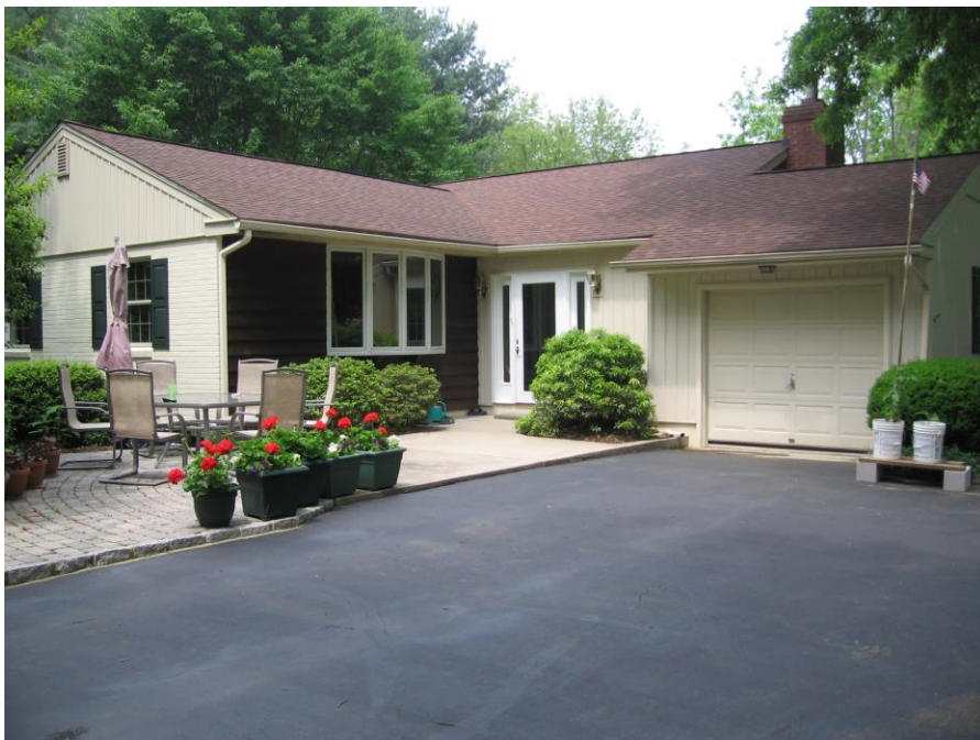
HR #166, 217 Red Lion Rd.