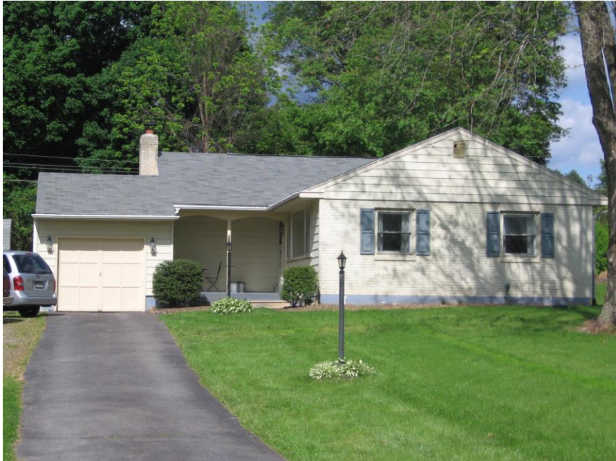
HR #153, 1259 Audubon Rd.