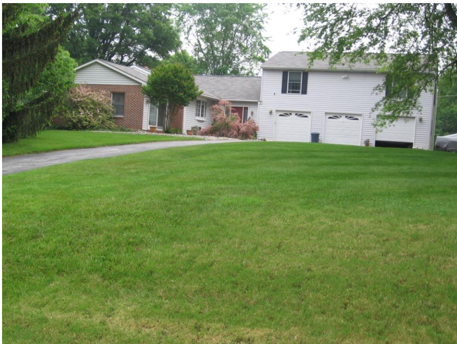
HR #070, 1253 Buck La.