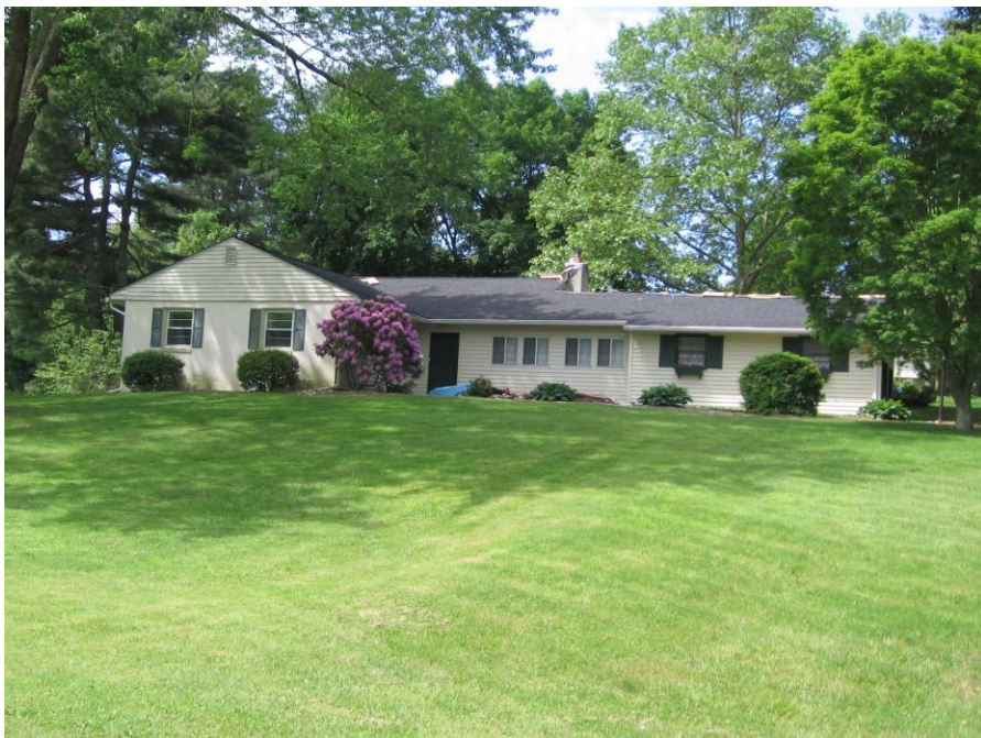
HR #164, 108 Red Lion Rd.