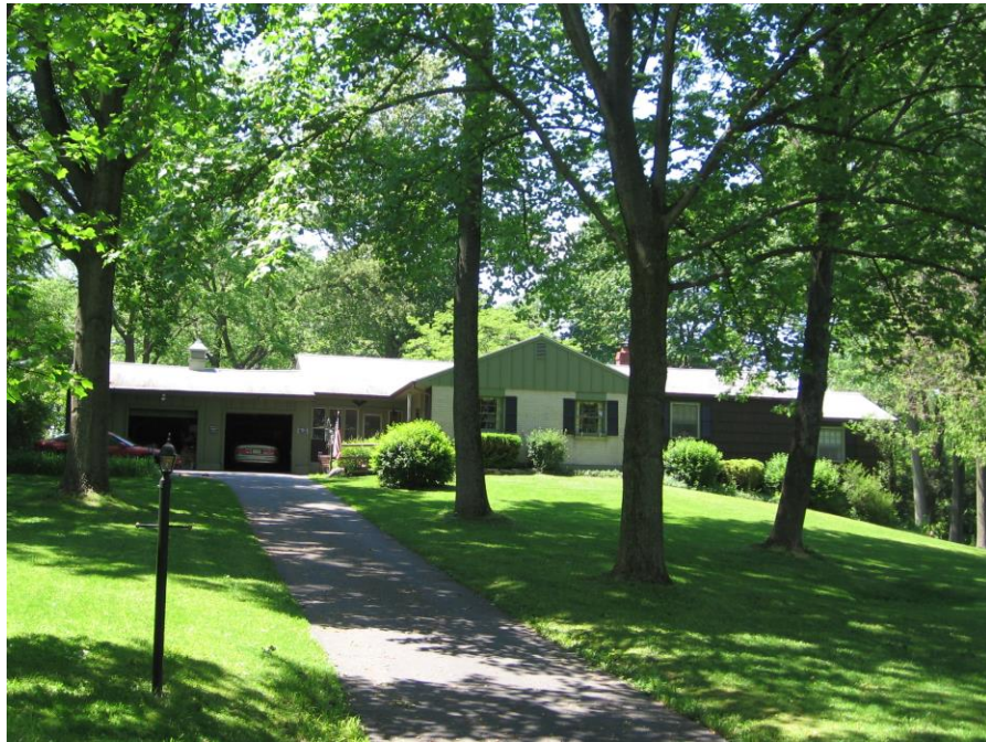
HR #058, 237 Green Tree Dr.