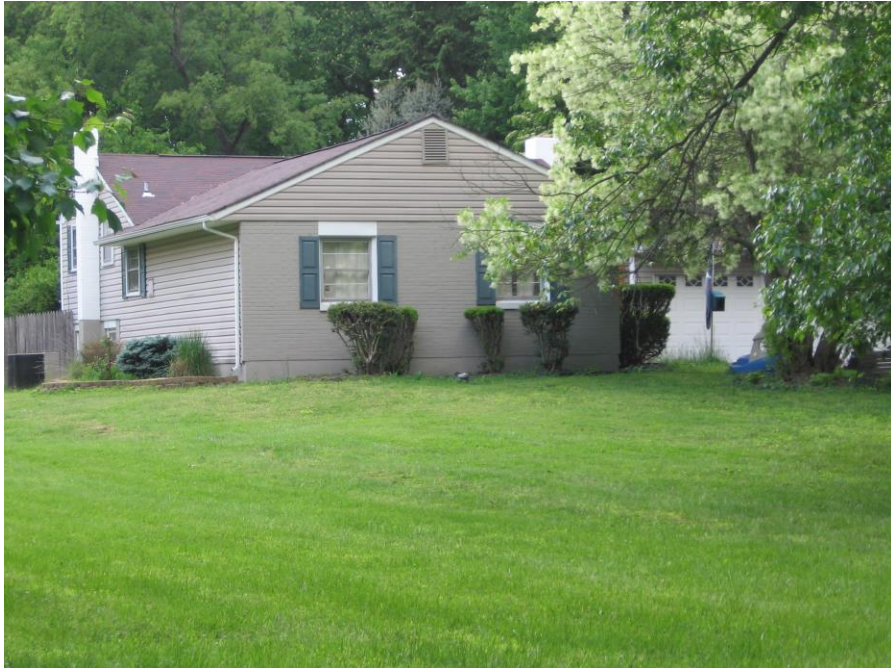
HR #162, 252 Green Tree Dr.