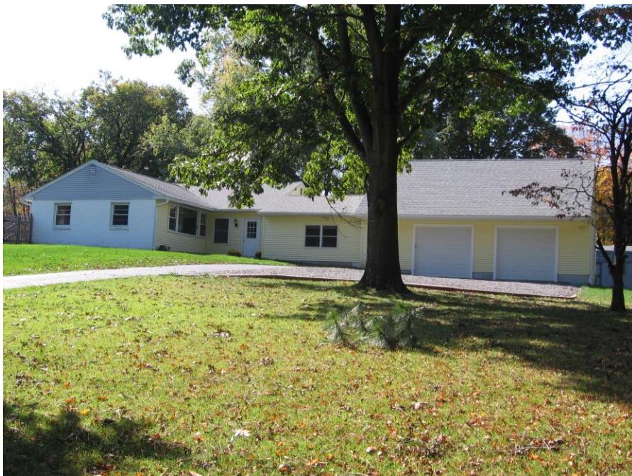
HR #073, 229 Green Tree Dr.