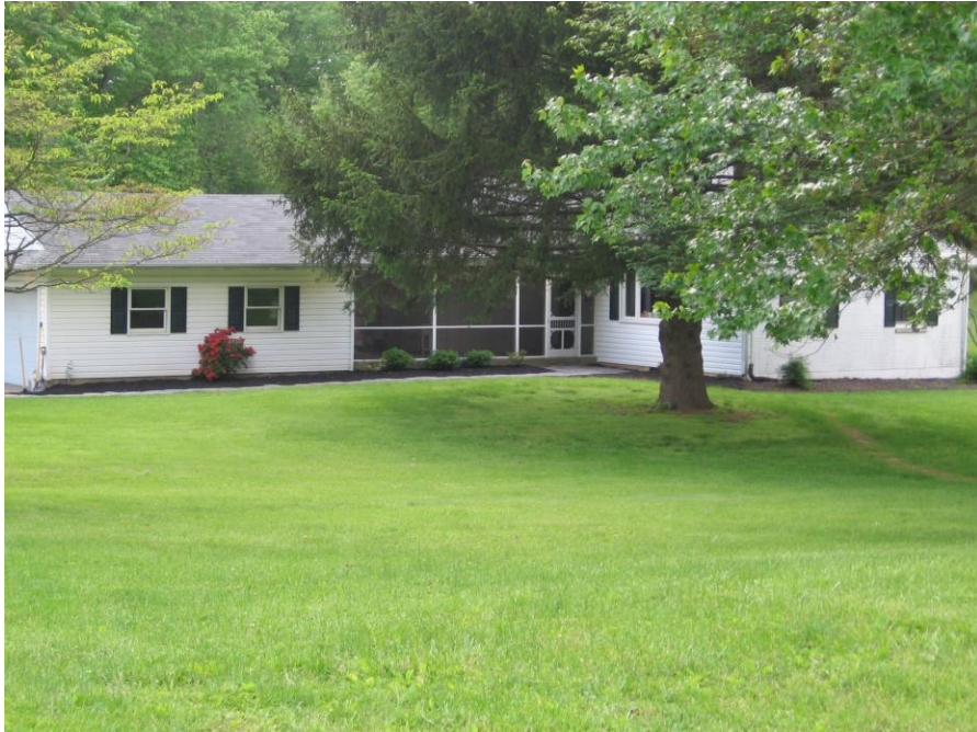
HR #165, 215 Red Lion Rd.