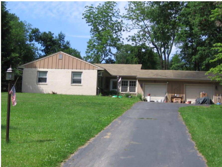
HR #155, 223 Green Tree Dr.