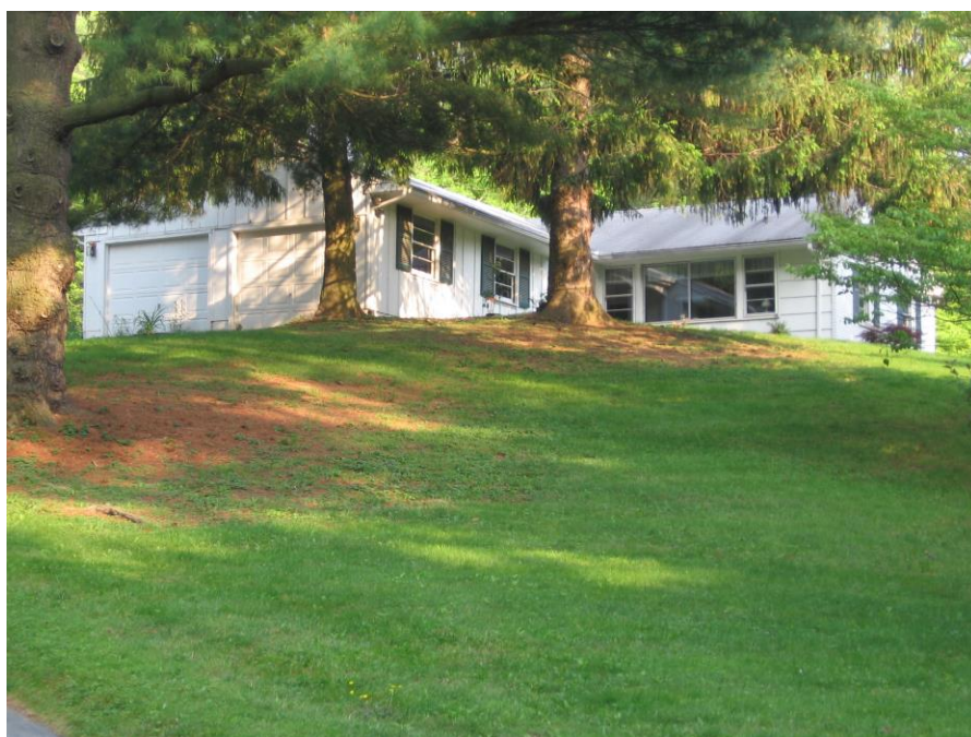
HR #056, 247 Green Tree Dr.