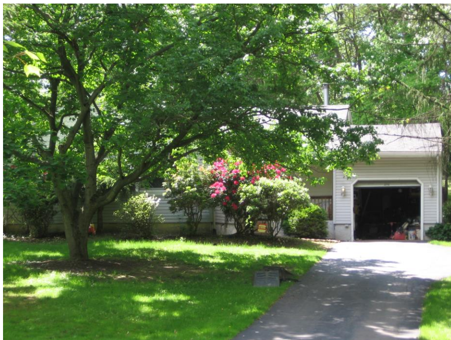
HR #051, 1244 Surrey Rd.