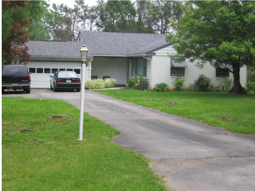
HR #173, 1255 Wilmington Pike