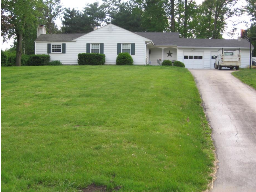
HR #081, 1260 Surrey Rd.