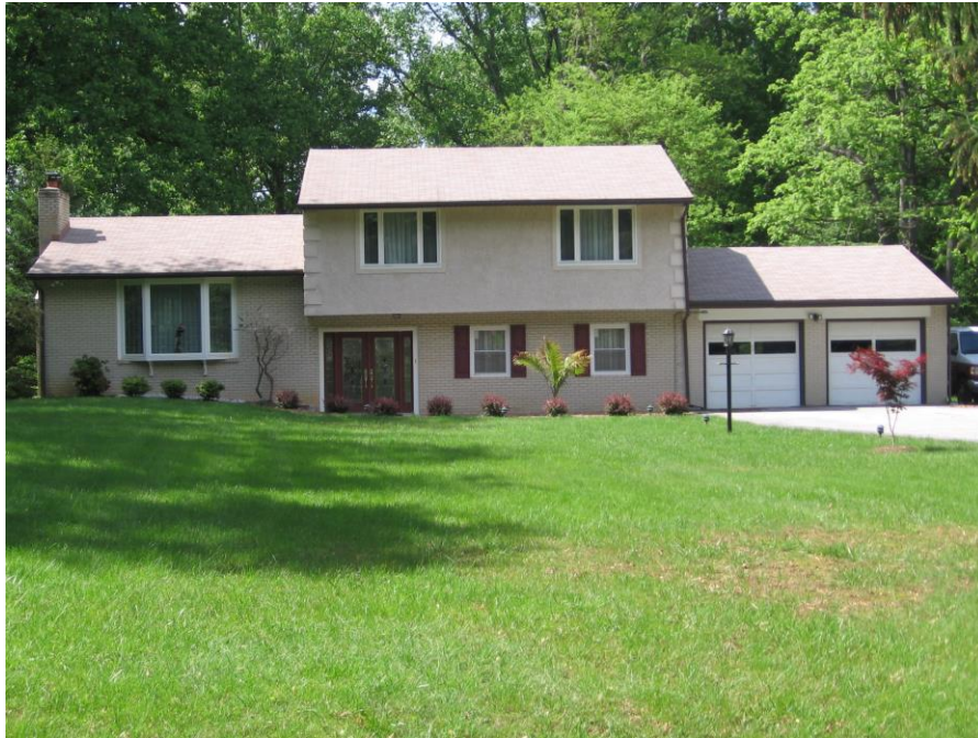
HR #054, 109 Red Lion La.