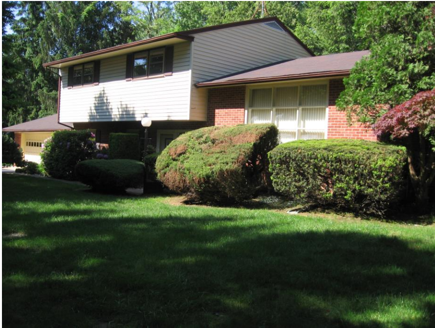
HR #107, 1257 Audubon Rd.