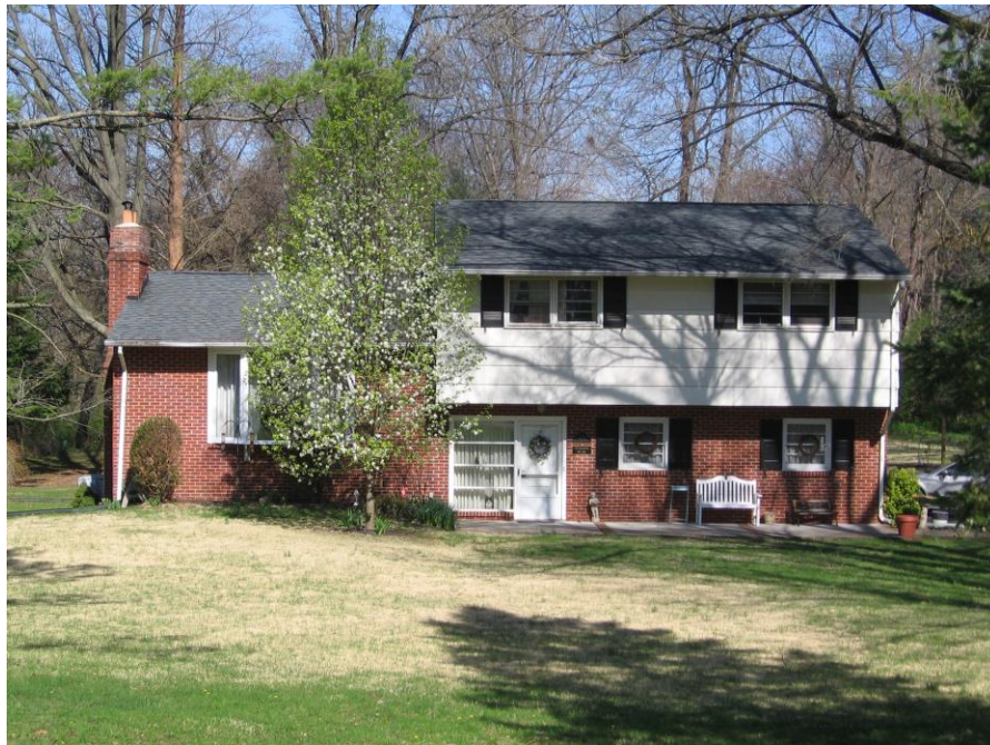
HR #059, 235 Green Tree Dr.