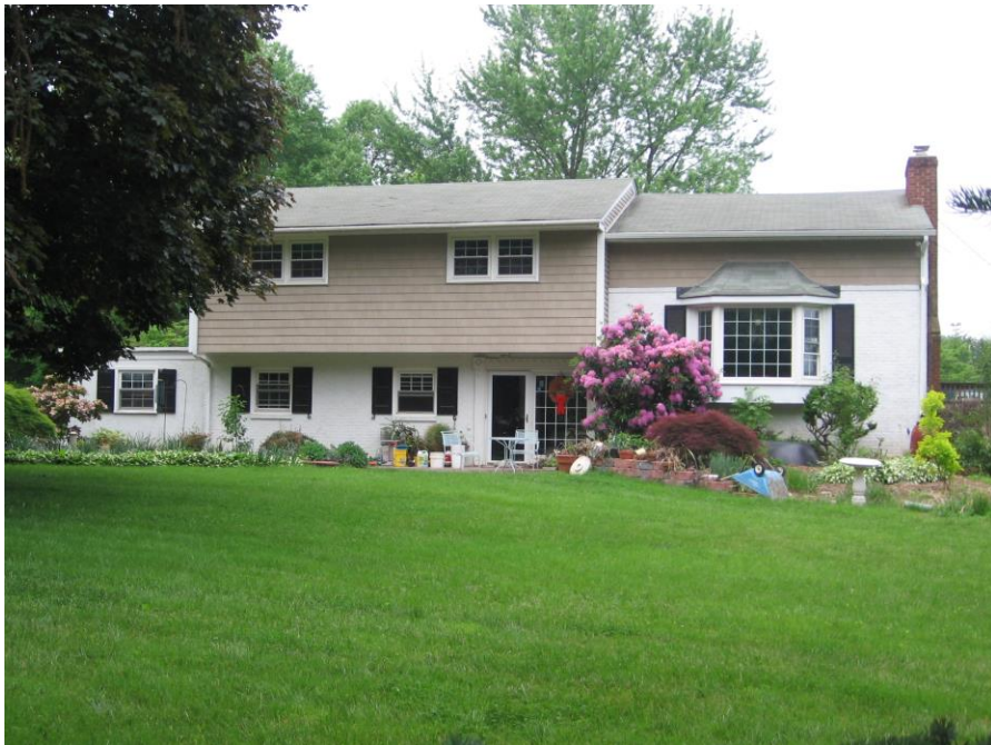
HR #066, 1254 Buck Ln.