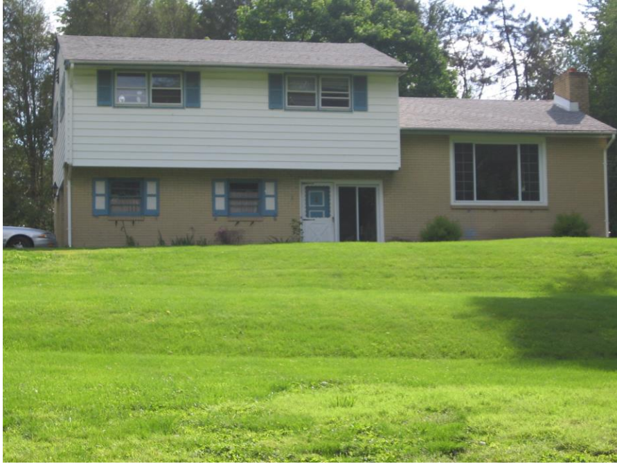
HR #096,1256 Surrey Rd.