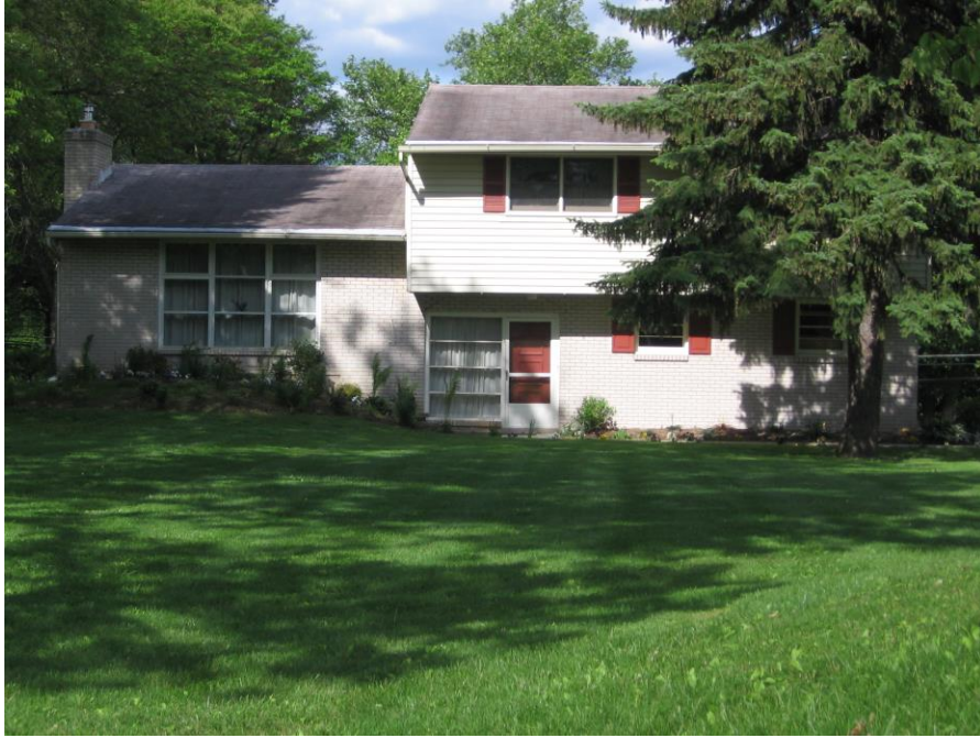
HR #063, 1251 Surrey Rd.