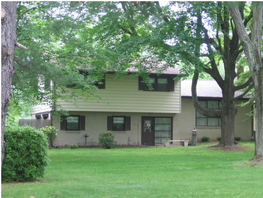
HR #154, 1257 Buck La.