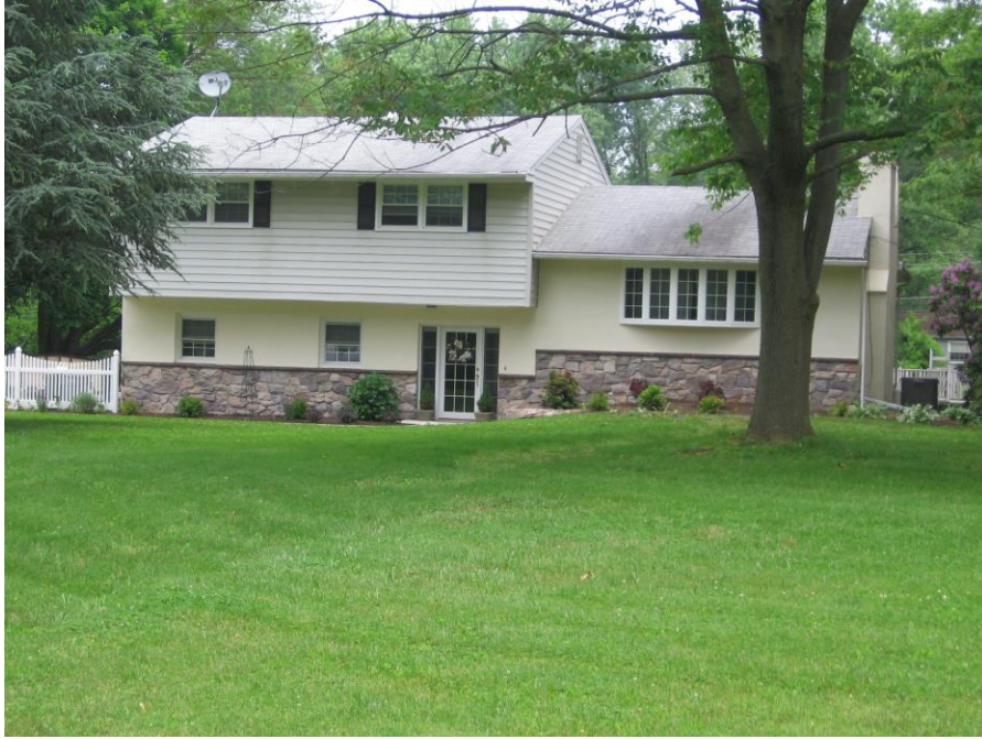
HR #099, 1257 Surrey Rd.