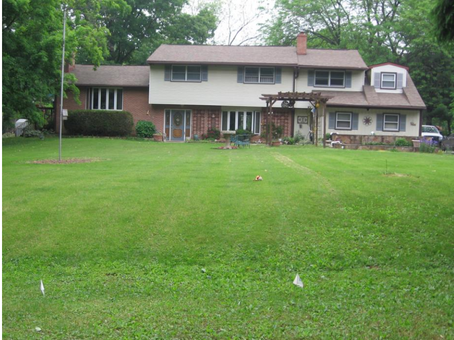
HR #069, 1255 Buck Ln.