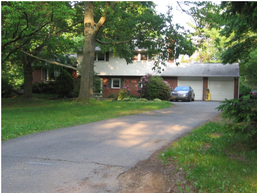
HR #076, 236 Green Tree Dr.