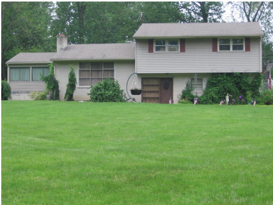
HR #097, 1254 Surrey Rd.