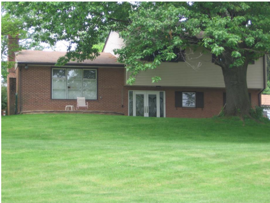
HR #095, 1258 Surrey Rd.