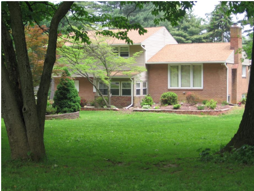
HR #102, 1253 Surrey Rd.