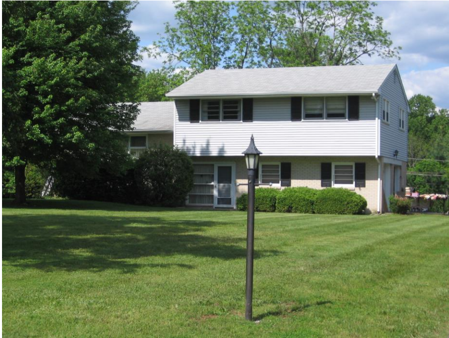
HR #077, 234 Green Tree Dr.