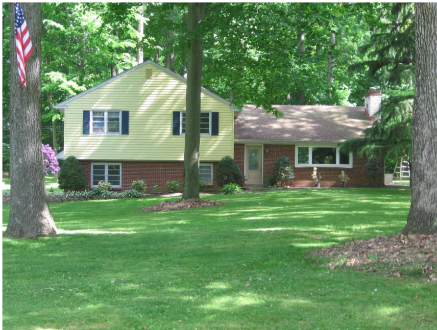
HR #117, 216 Green Tree Dr.