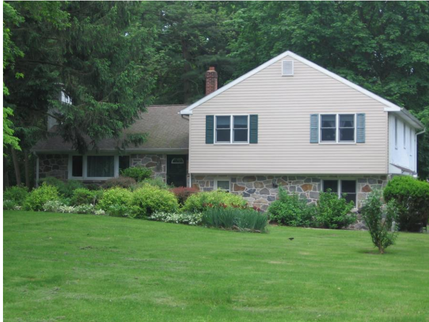
HR #110, 1262 Buck Ln.