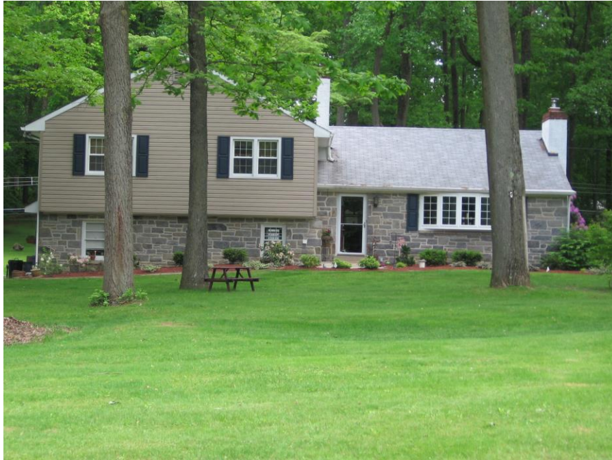
HR #118, 214 Green Tree Dr.