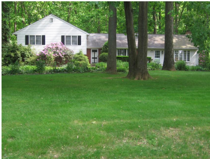
HR #119, 212 Green Tree Dr.