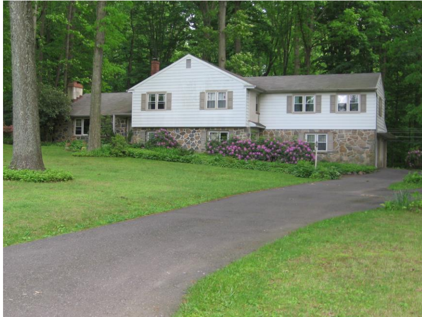
HR #121, 108 Green Tree Dr.