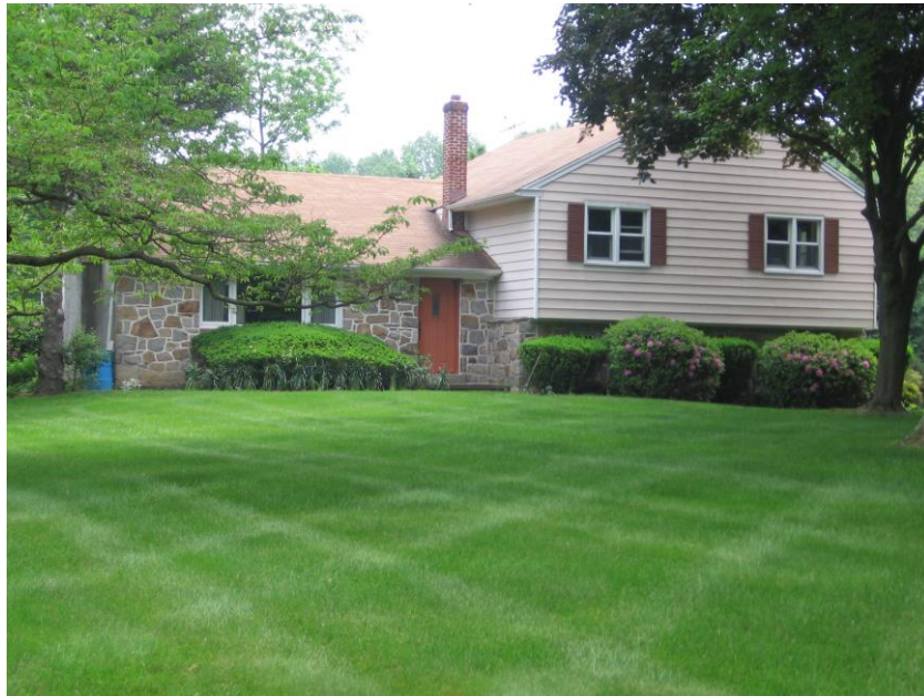
HR #112, 1261 Buck Ln.