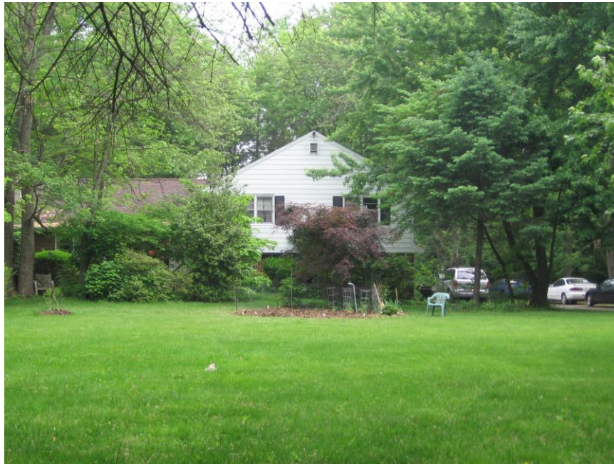
HR #108, 213 Green Tree Dr.