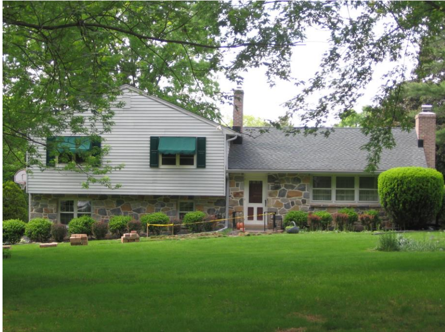
HR #103, 109 Green Tree Dr.