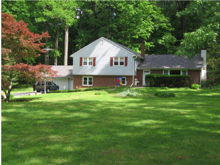
HR #116, 218 Green Tree Dr.