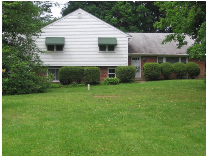
HR #111, 1260 Buck Ln.