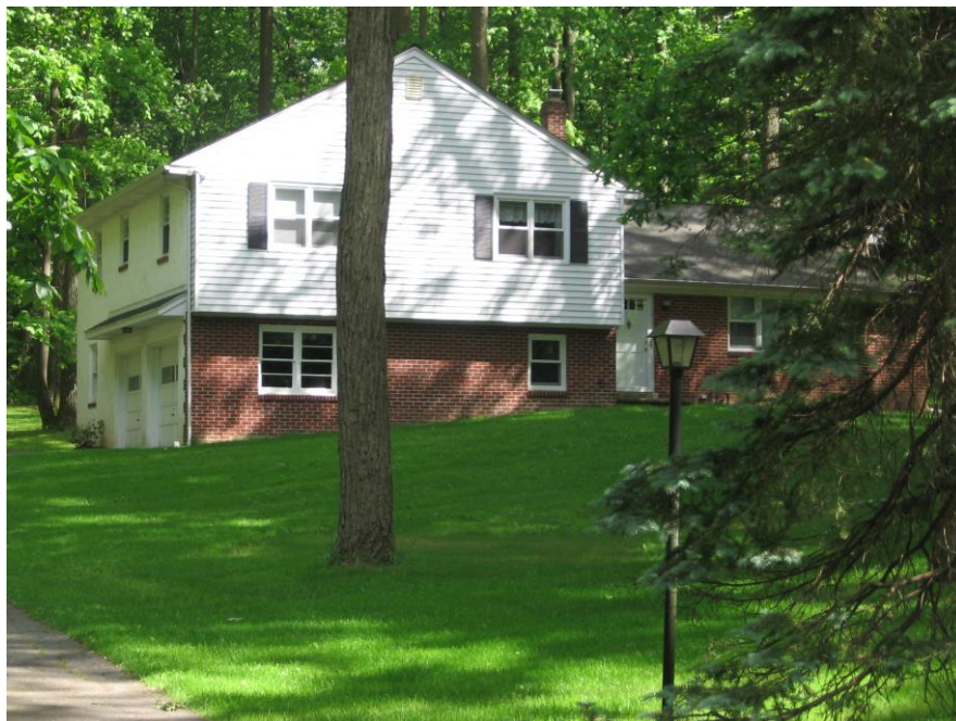
HR #115, 220 Green Tree Dr.