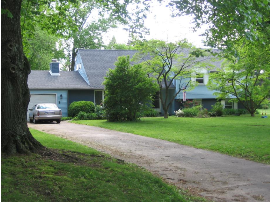
HR #124, 1262 Surrey Rd.