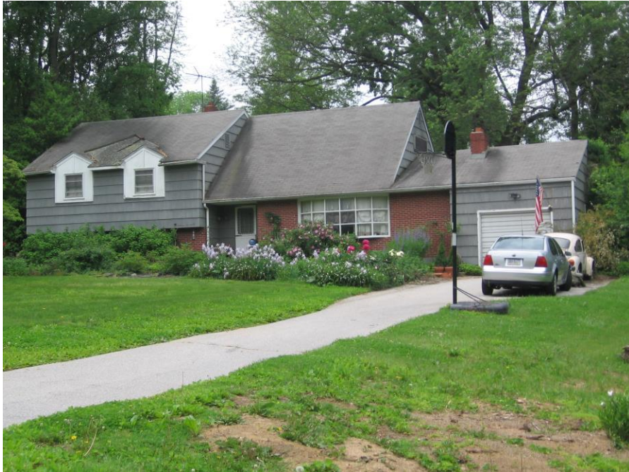
HR #168, 1248 Surrey Rd.