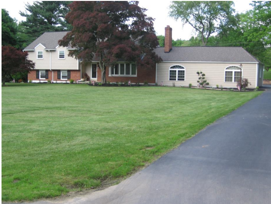
HR #100, 1259 Surrey Rd.