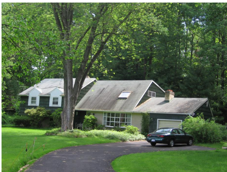
HR #120, 222 Green Tree Dr.