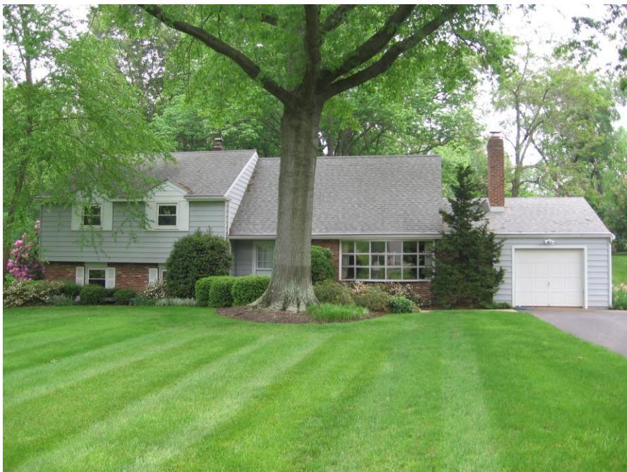
HR #169, 1249 Surrey Rd.