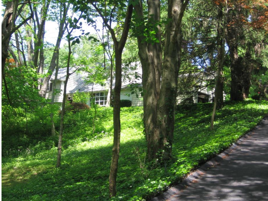
HR #061, 249 Green Tree Dr.