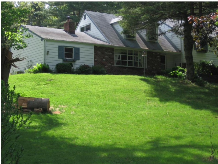
HR #161, 250 Green Tree Dr.