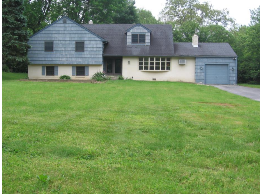
HR #171, 1246 Surrey Rd.