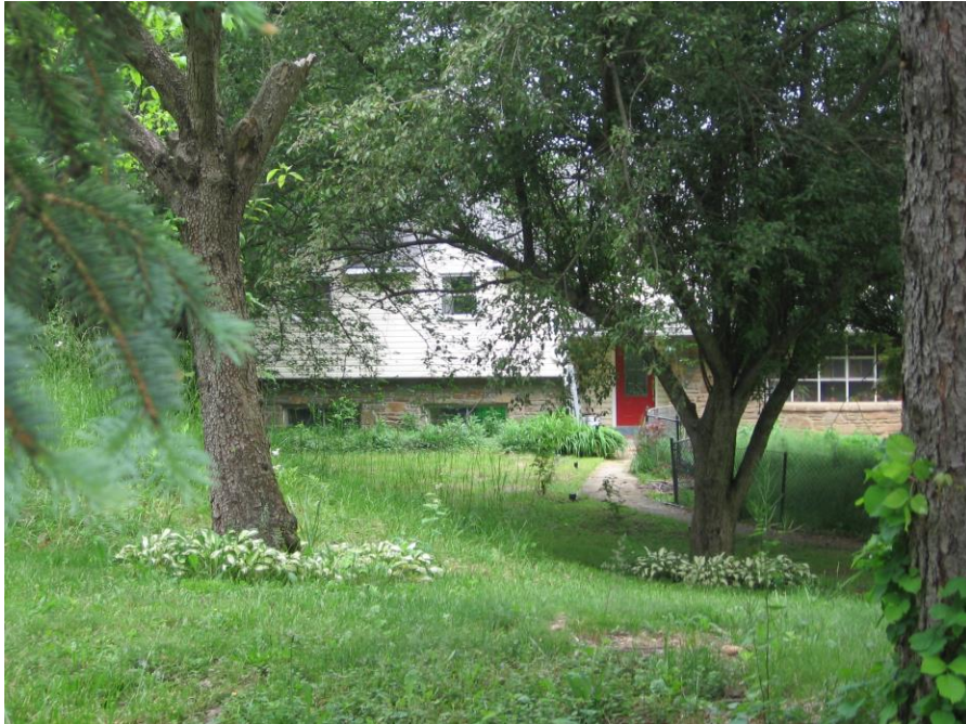
HR #163, 1 Red Lion Rd.