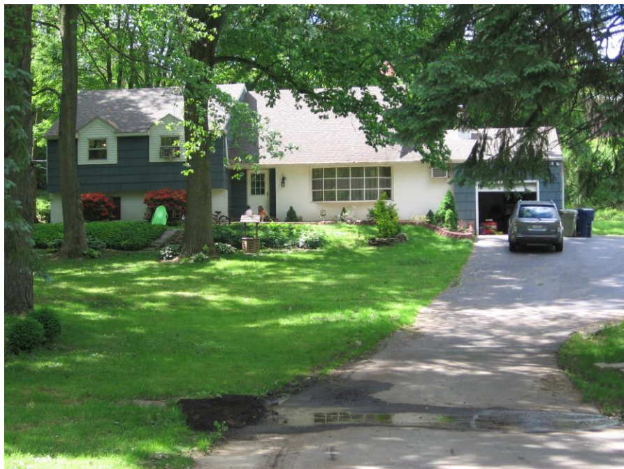
HR #172, 1242 Surrey Rd.