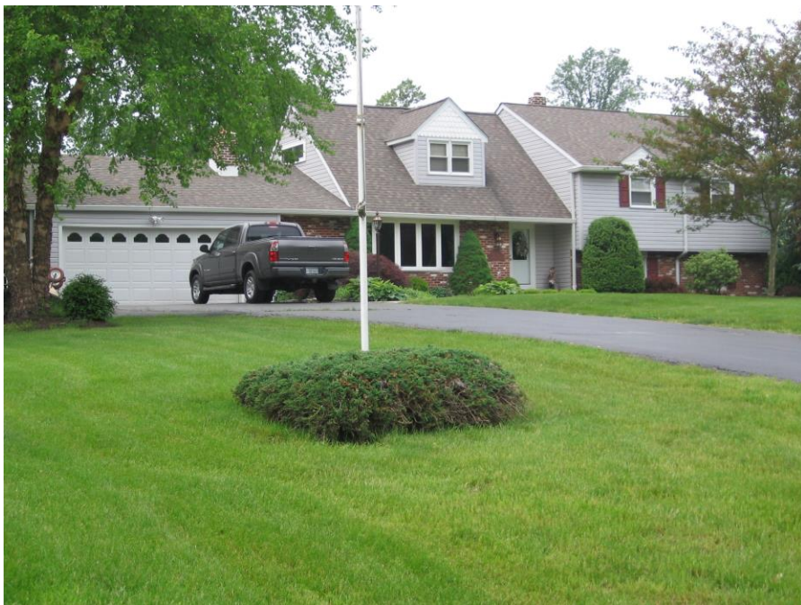
HR #167, 1252 Surrey Rd.