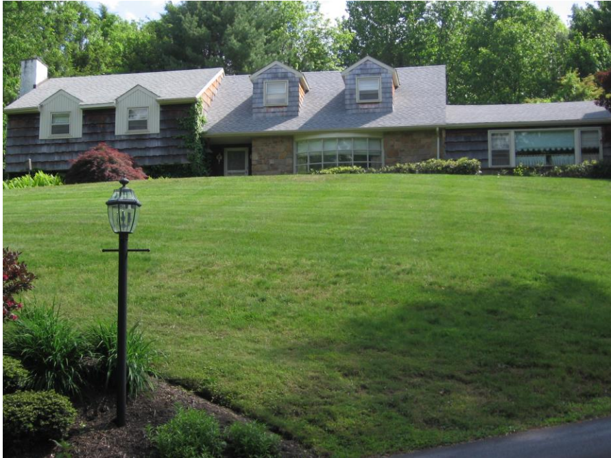
HR #160, 243 Green Tree Dr.