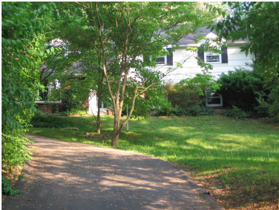
HR #057, 245 Green Tree Dr.