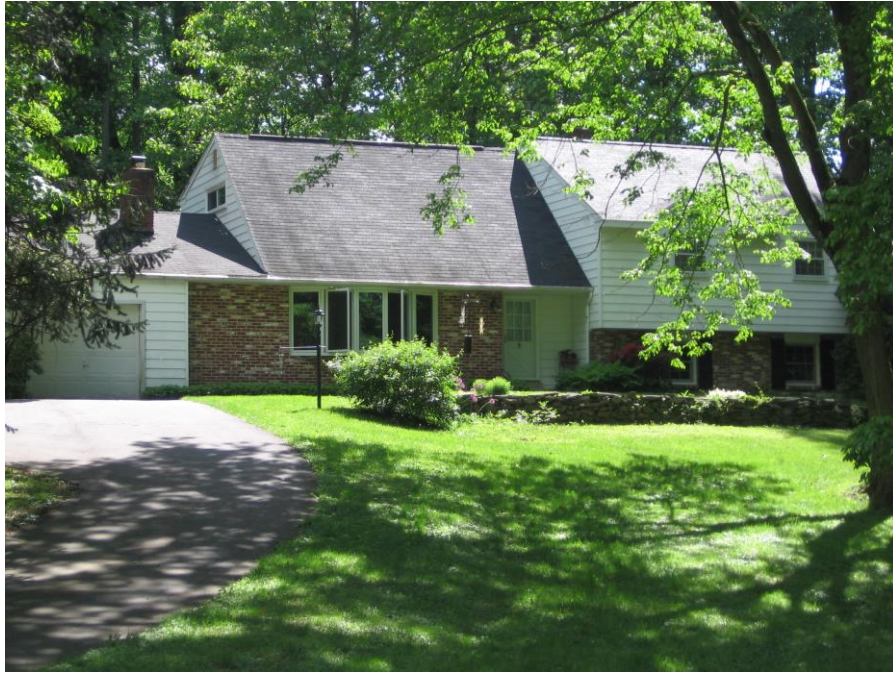
HR #055, 248 Green Tree Dr.