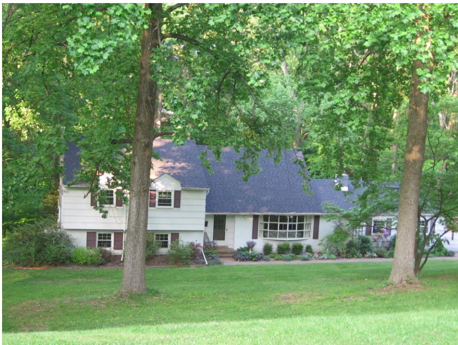
HR #159, 240 Green Tree Dr.