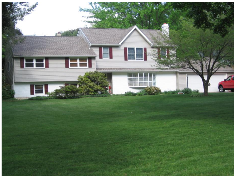
HR #101, 1261 Surrey Rd.