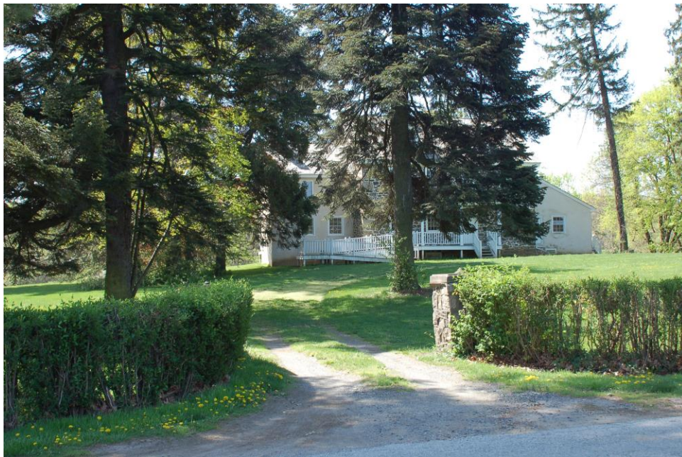
Driveway off Truth Road, showing One of the Stone Gate Posts, Looking South