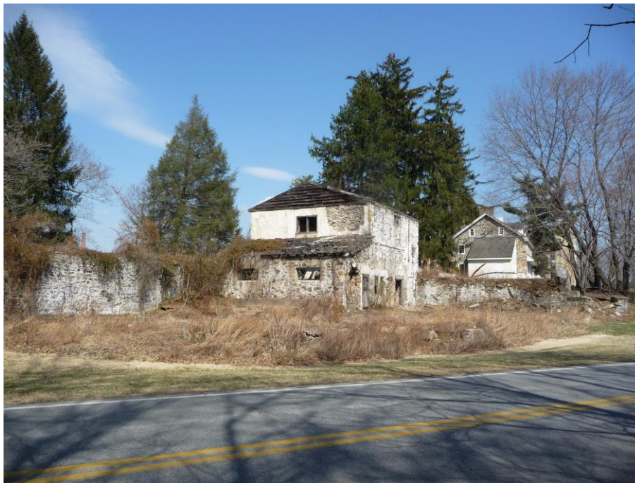
West and South (front) Elevations, Barn, with Glen Burnie in Right Background