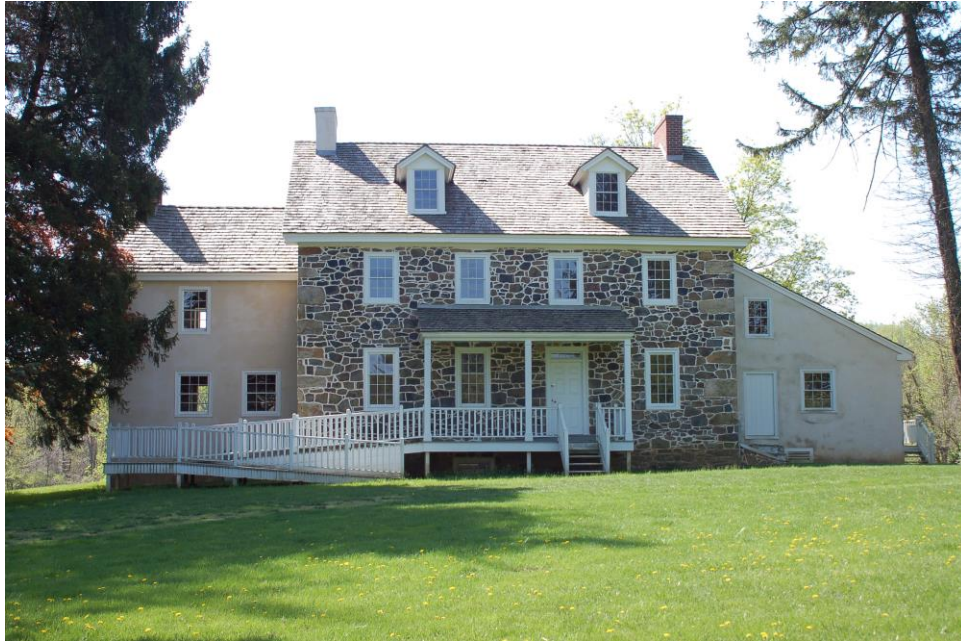
North (back) Elevation, Glen Burnie