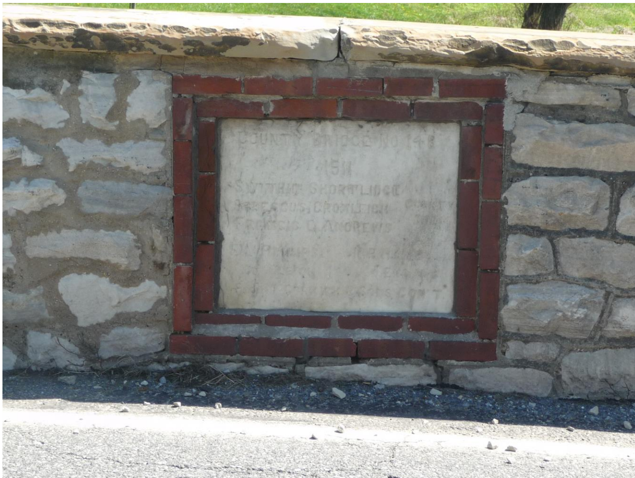
Plaque on wingwall of County Bridge #148