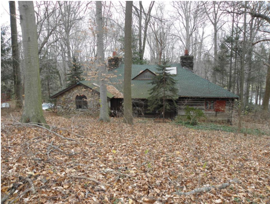
South Elevation, House