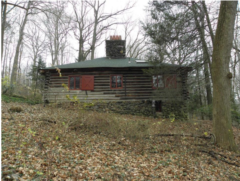
East Elevation, House