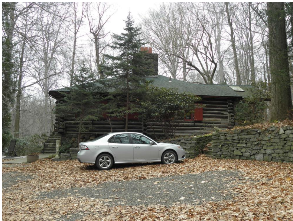
West Elevation, House