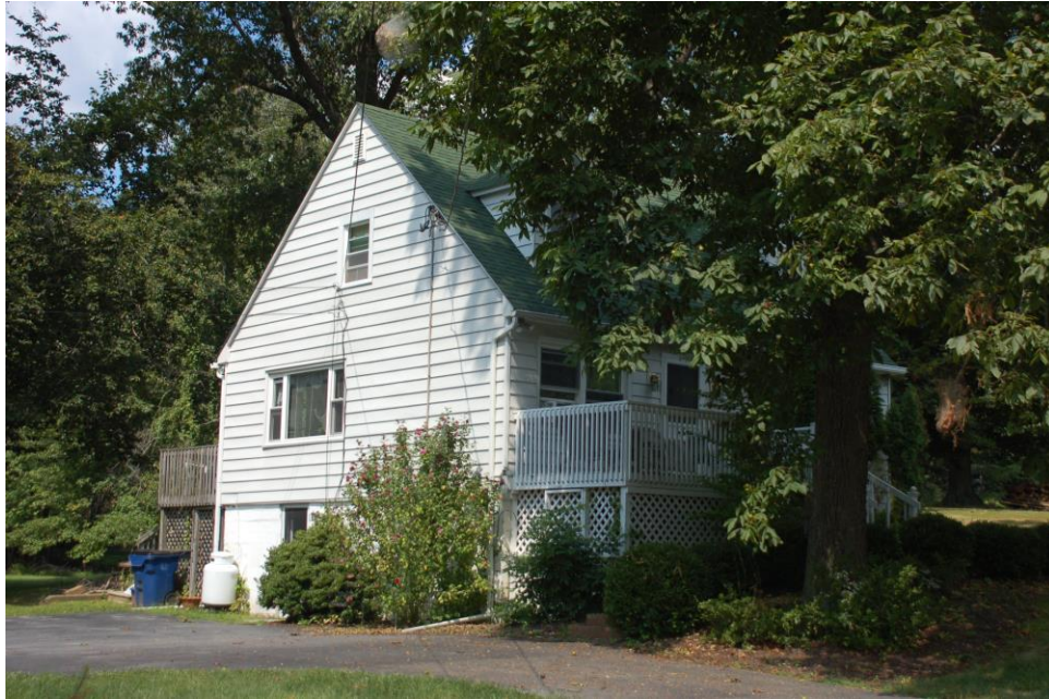
West and South (front) Elevations, House