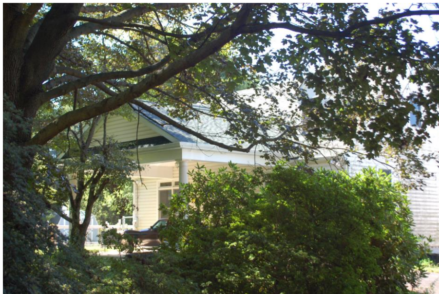
East (front) and North Elevations, 1950s Bungalow