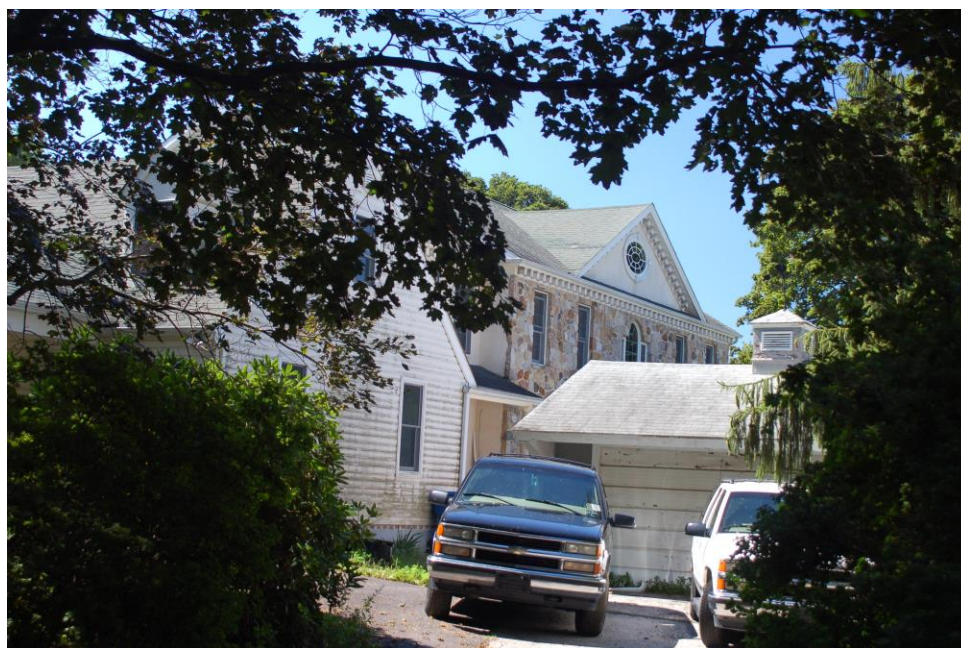
1950s Bungalow, left, 1950s Garage right, 2008 Addition, Center Background