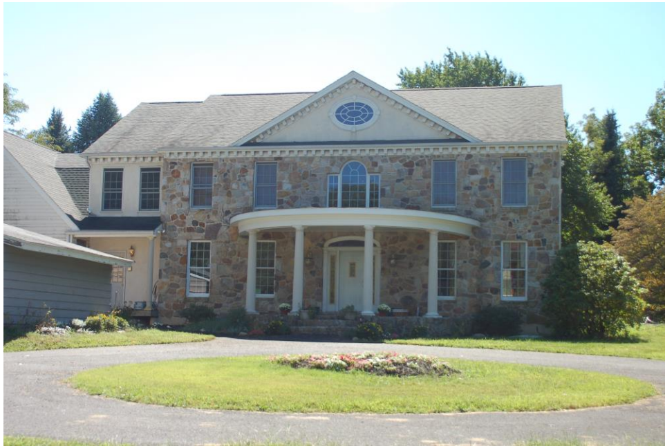
North (front) Elevation, 2008 Addition