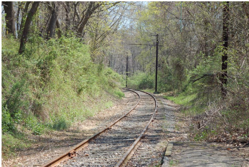
West Chester & Philadelphia Railroad Tracks, looking South from Westtown Train Station