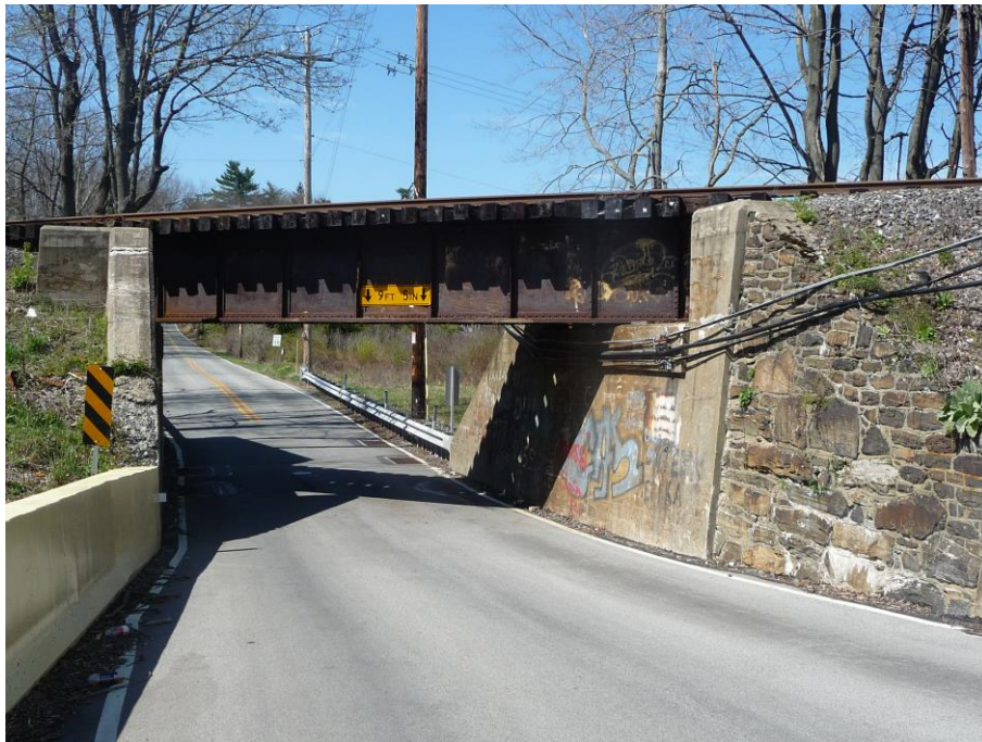
South Face, Westtown-Thornton Railroad Bridge