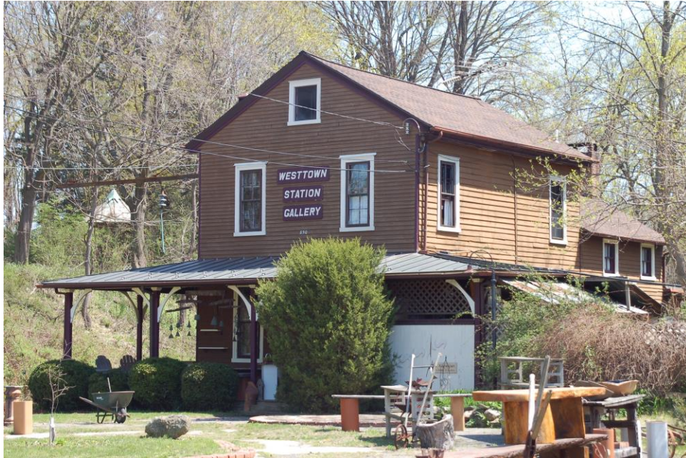
North and West (back) Elevations, Westtown Train Station