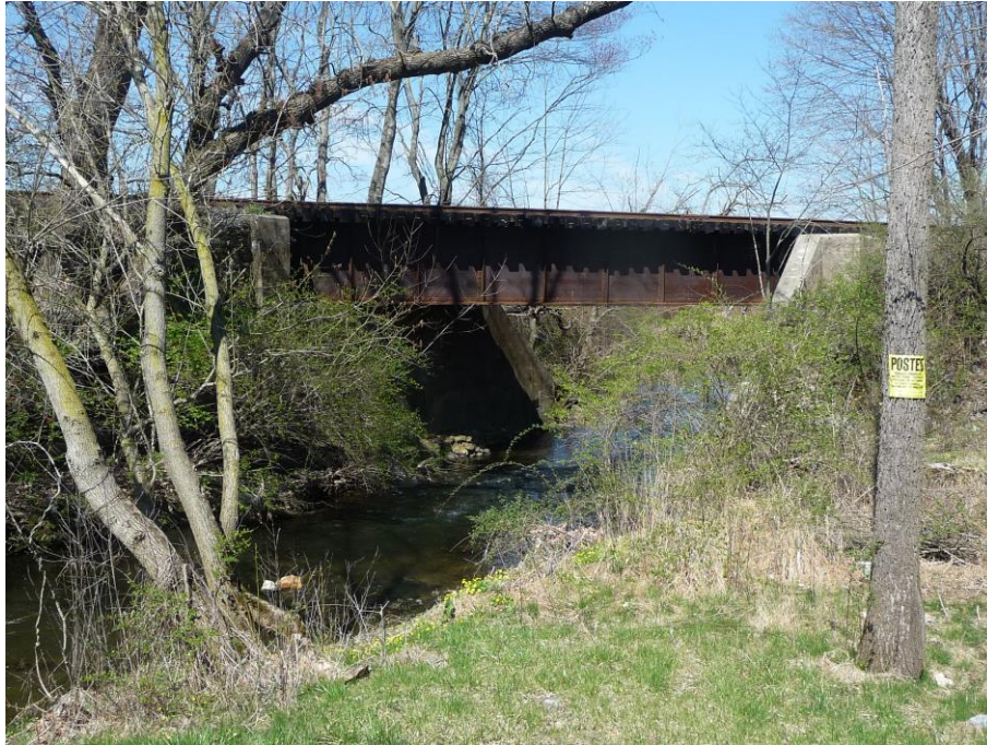
South Face, Goose Creek Railroad Bridge