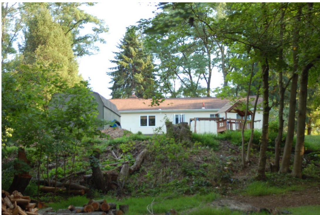
North Elevation, House