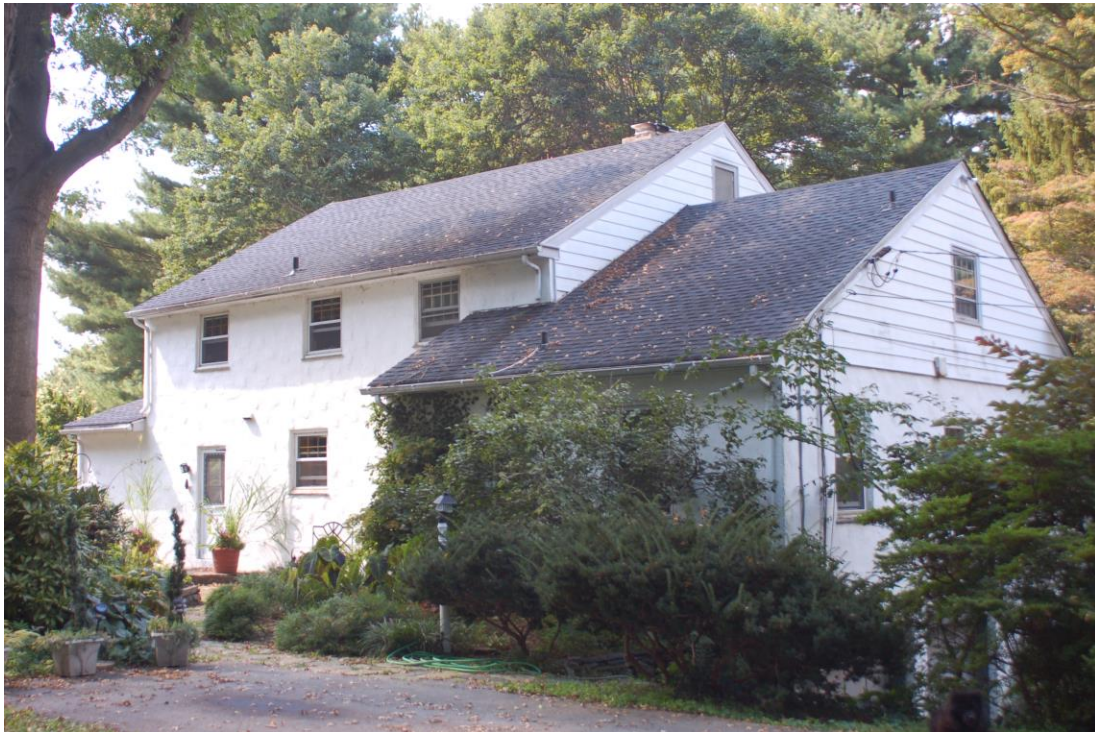
South (back) and East Elevations, House