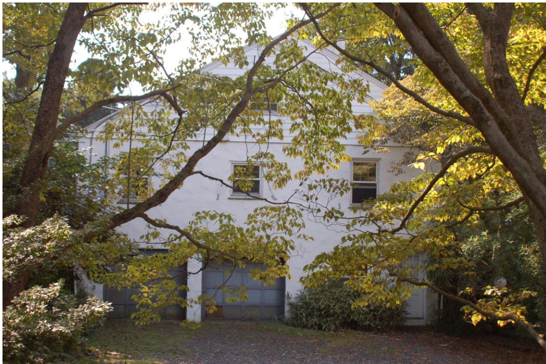
East Elevation, House, showing Basement-level Garage, East Wing