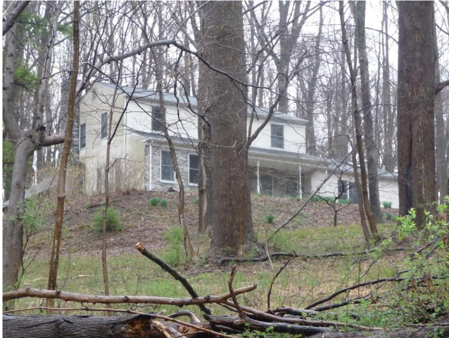
Front Elevation, Neo-Colonial Revival House