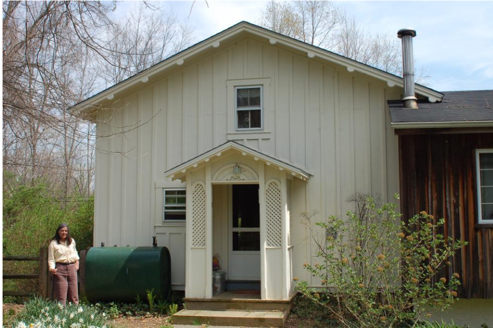
West (front) Elevation, Core of House with Wing on Right