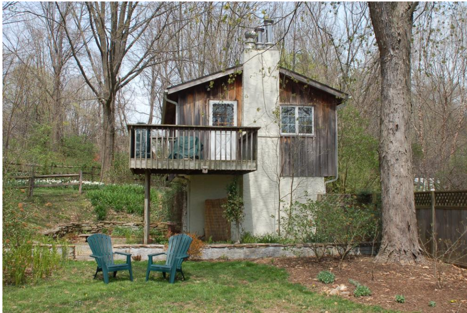
South Elevation, Core of House