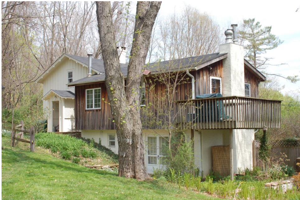
West (front) and South Elevations, Wing of House, with Core in Left Background