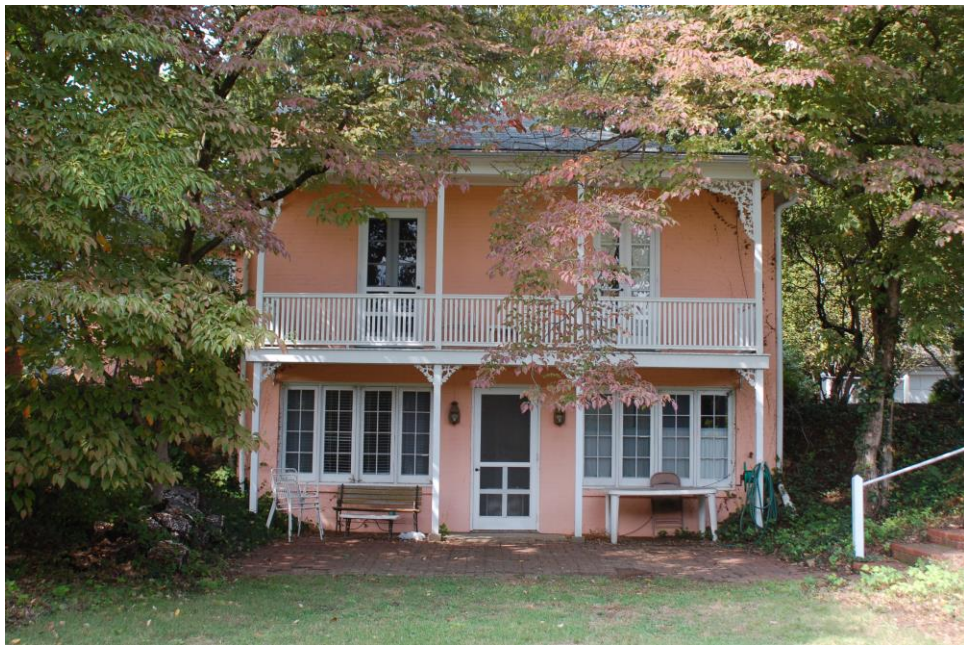
South (back) Elevation, House, Showing Two-Story Porch