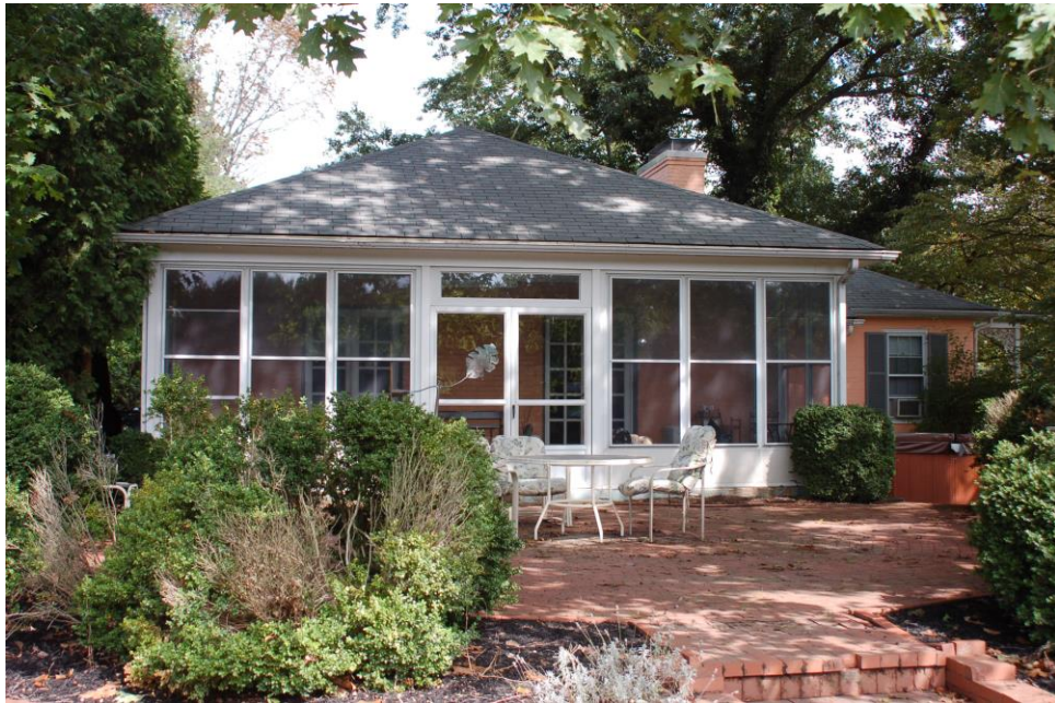
West Elevation, House, Showing Screened Porch