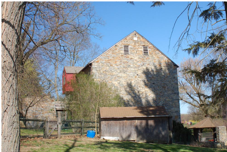
West Elevation, House, Showing Shed in Center Foreground