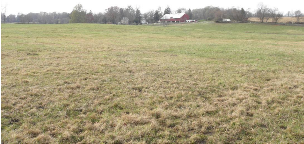
Brandywine Battlefield National Historic Landmark, Looking Northwest