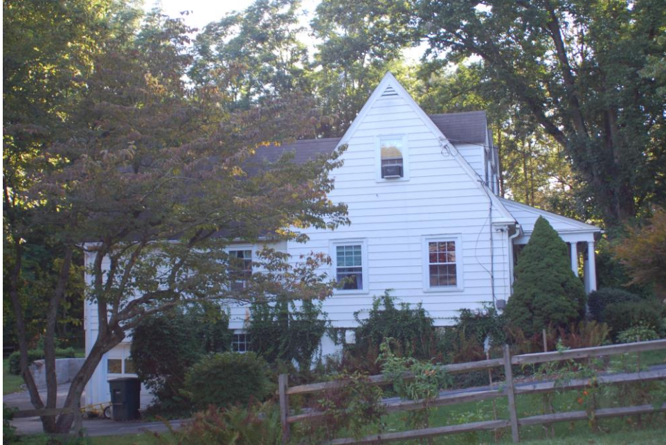
East Elevation, House