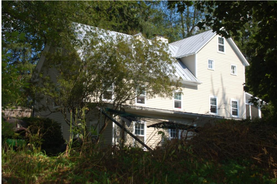
North (back) and West Elevations, House