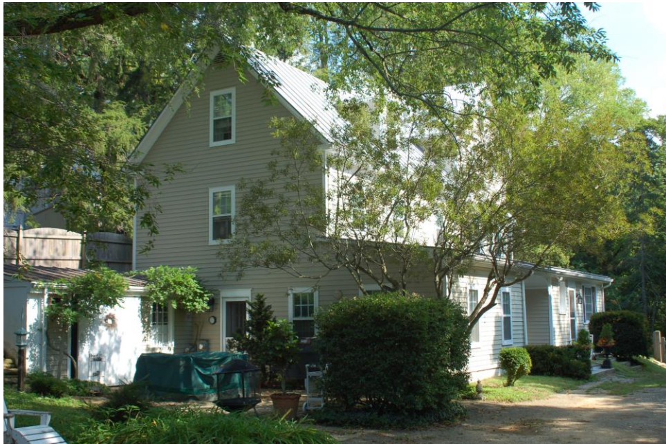
North (back) and West Elevations, House with Shed Addition to Left