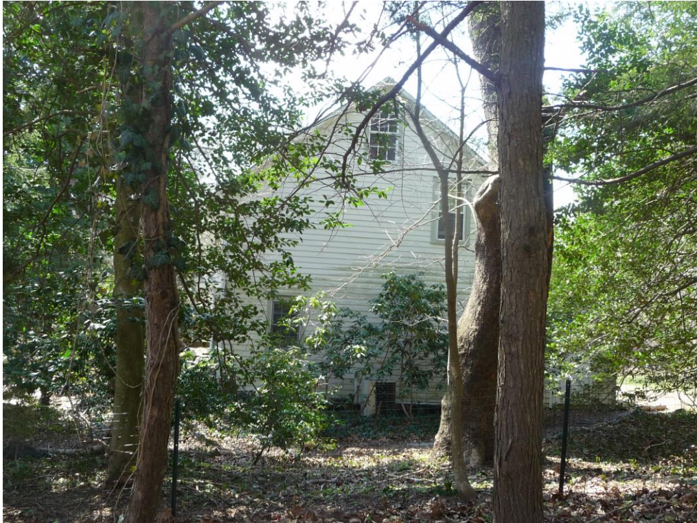
East Elevation, House