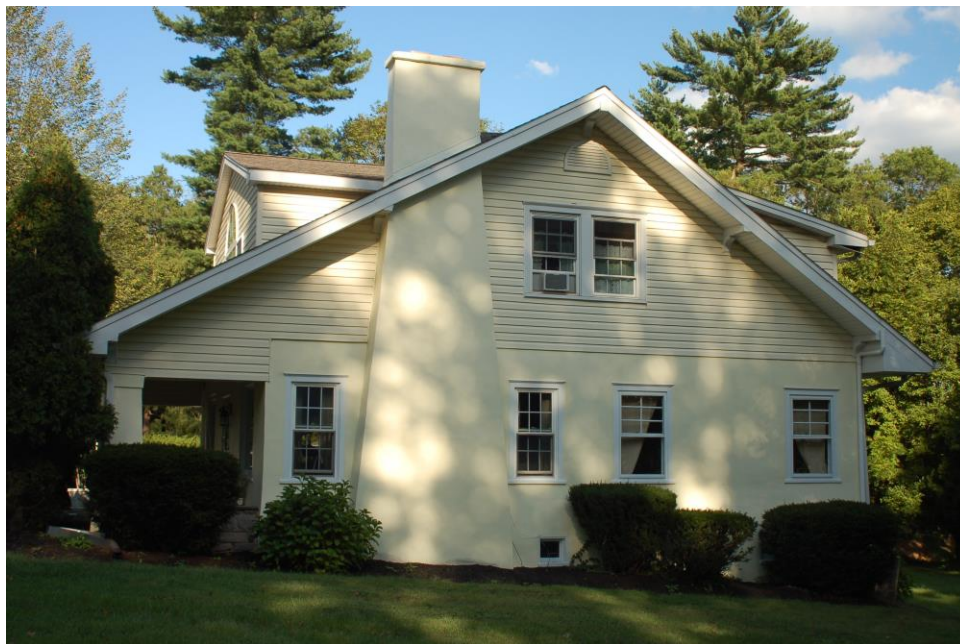
West Elevation, House