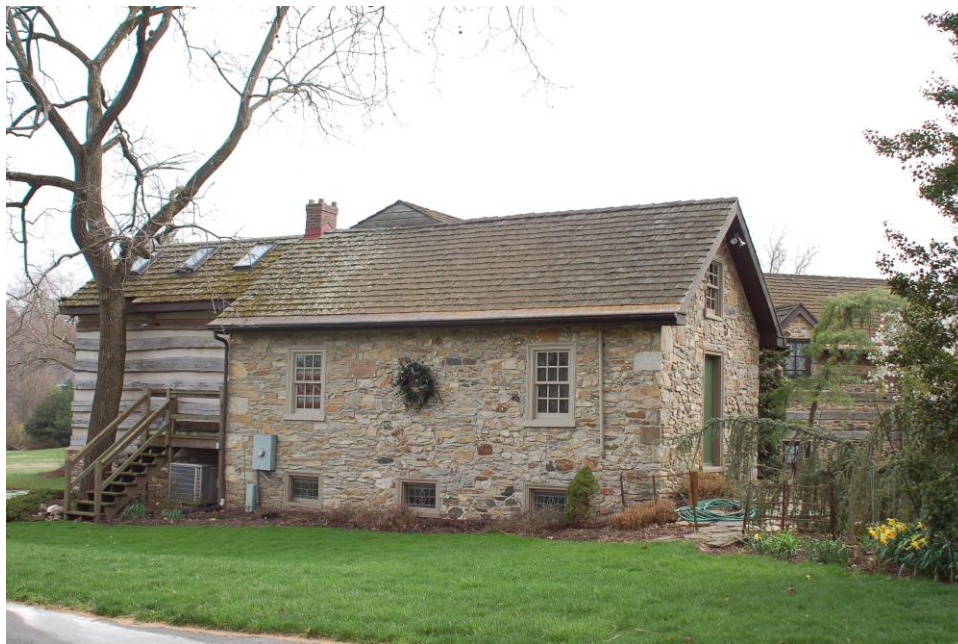
Southeast and Northeast (front) Elevations Showing Original Agricultural Stone and Log Outbuilding