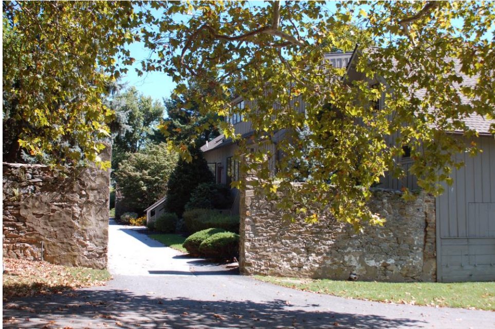
Northwest (front) and Southwest Elevations, House