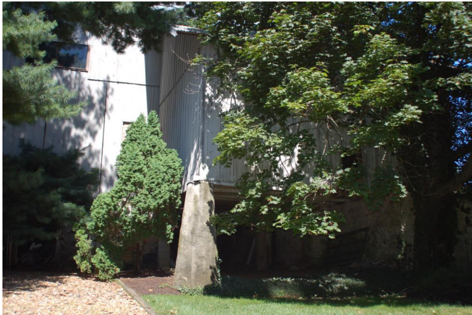
Close-up, South (front) Elevation, Barn, Showing Conical Support