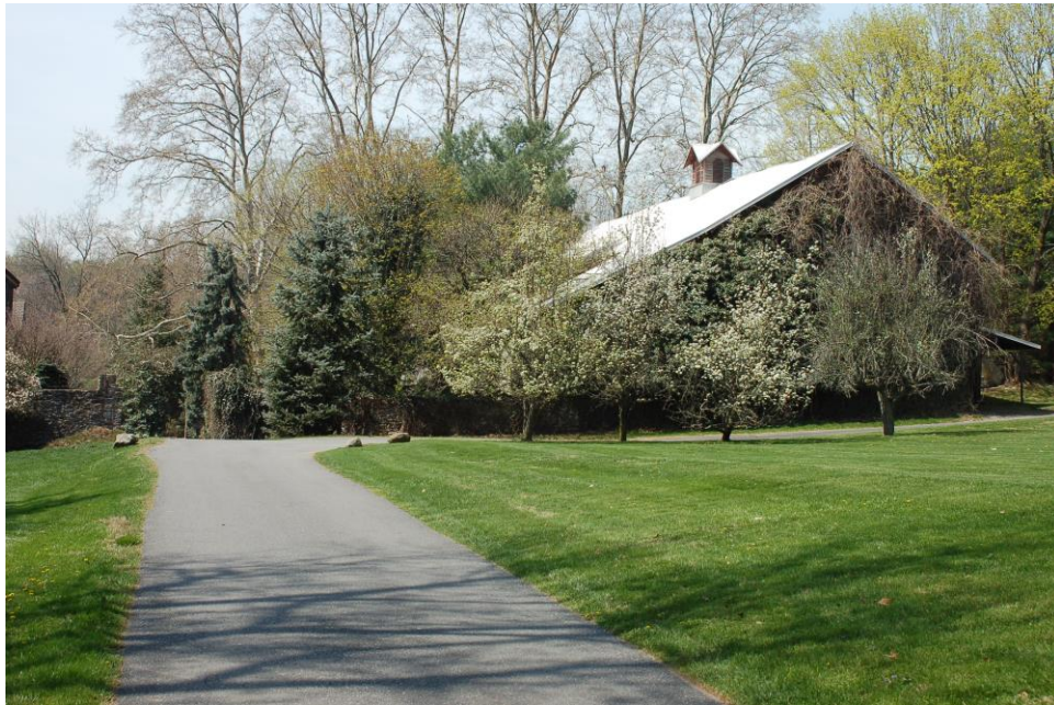
East Elevation, Barn