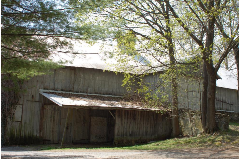
North (back) Elevation, Barn, Showing Lean-to over Middle Level Cartway & Barn Bridge & Ramp