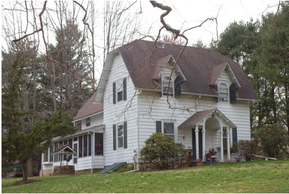
South and East (front) Elevations, House