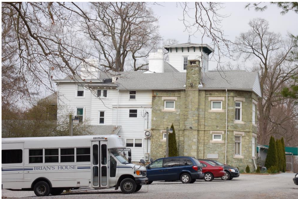
West (back) Elevation, House