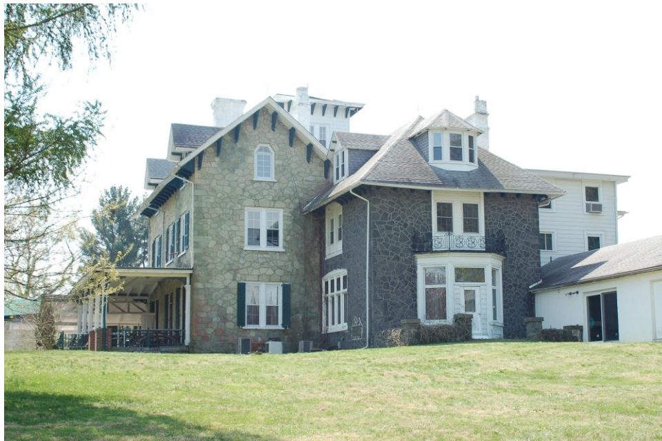
North Elevation, House