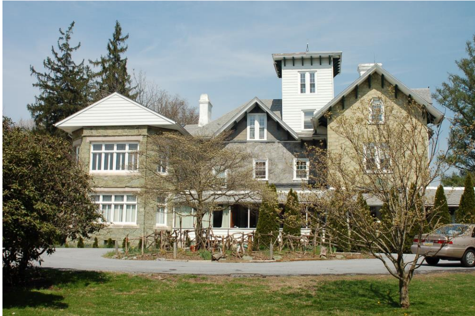
South Elevation, House