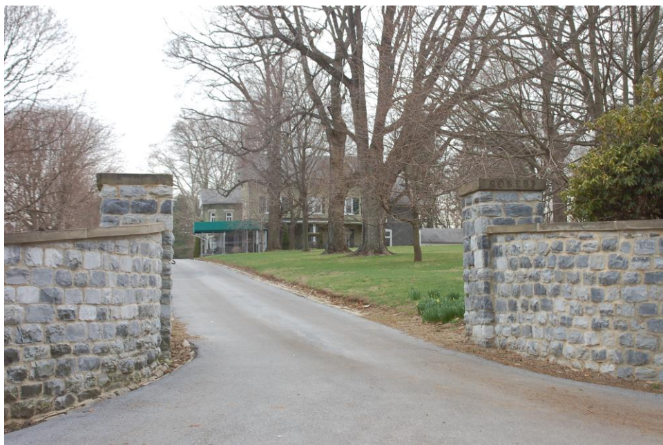
Long View, Rokeby through Entranceway, Looking West