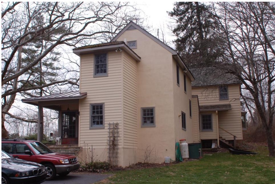
East and North (back) Elevations, House