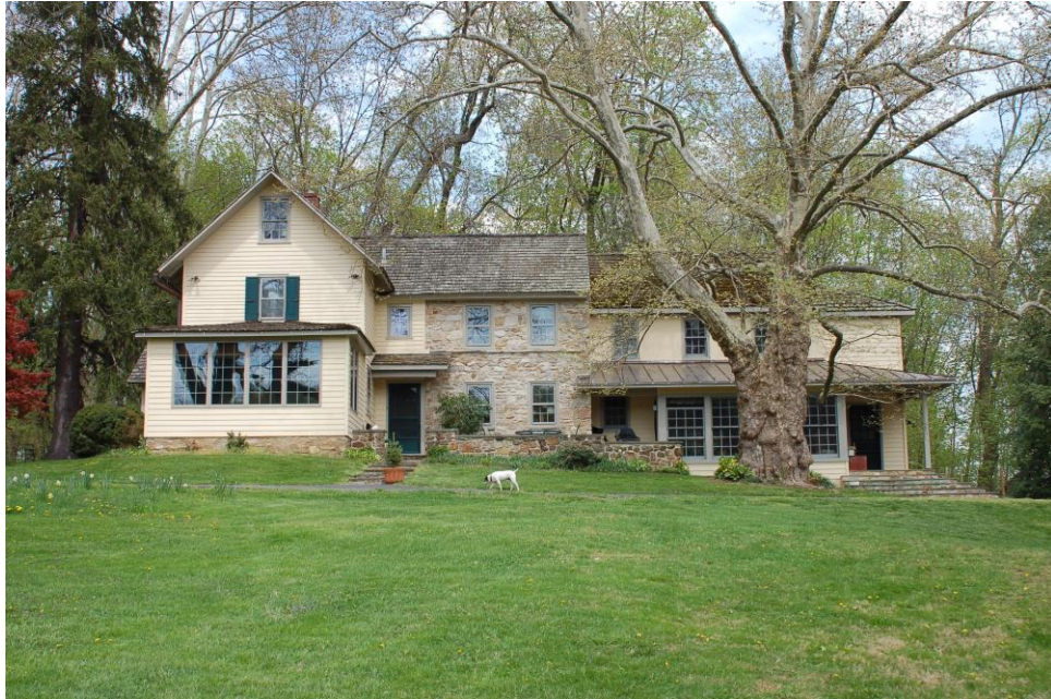
South (front) Elevation, House