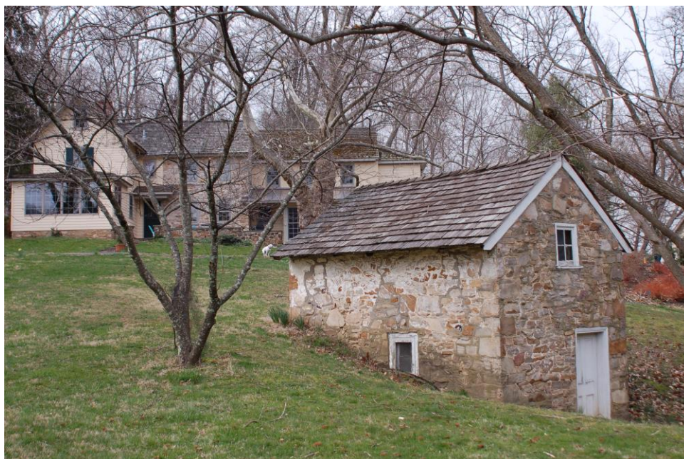
South and East Elevations, Spring House, with House in Background