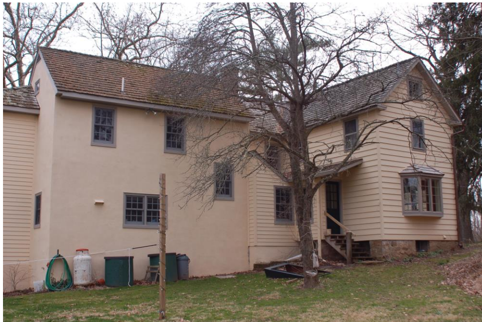
North (back) Elevation, House