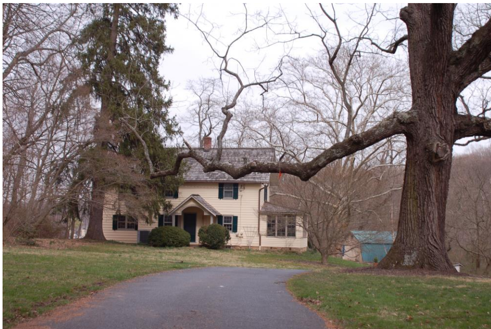
Long View, South (front) Elevation, House with Barn in Right Background