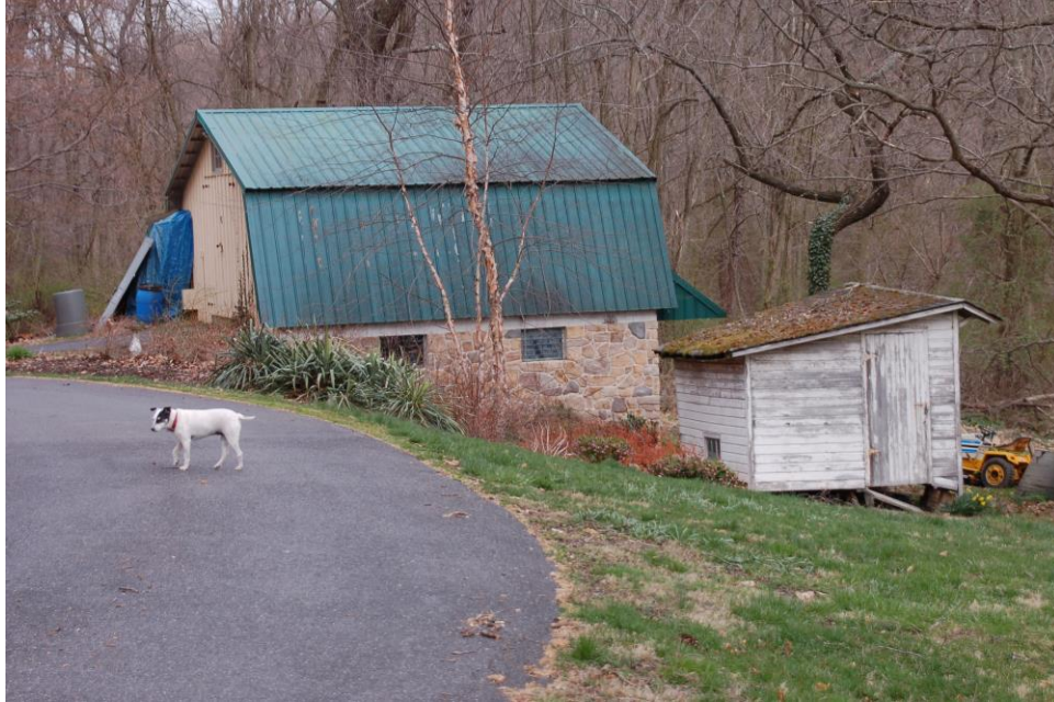
West and South Elevations, Barn (Left) and Chicken Coop (Right)