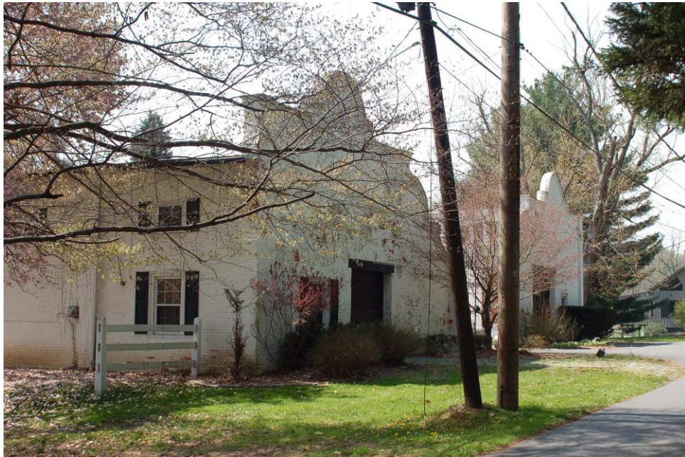
East and North (front) Elevations, House