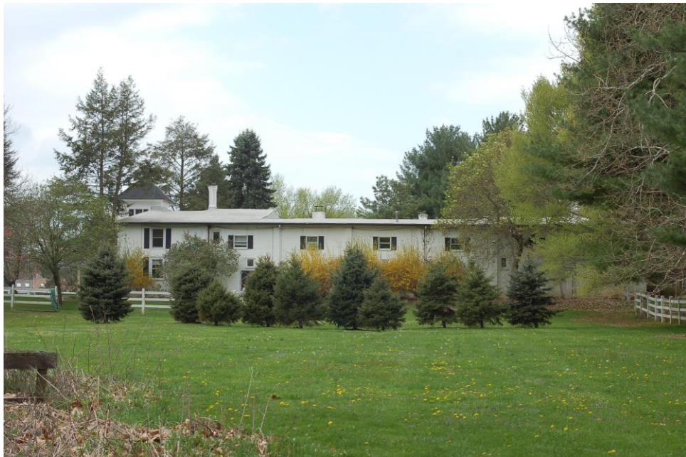
South (back) Elevation, House, Showing Tower, Left Background