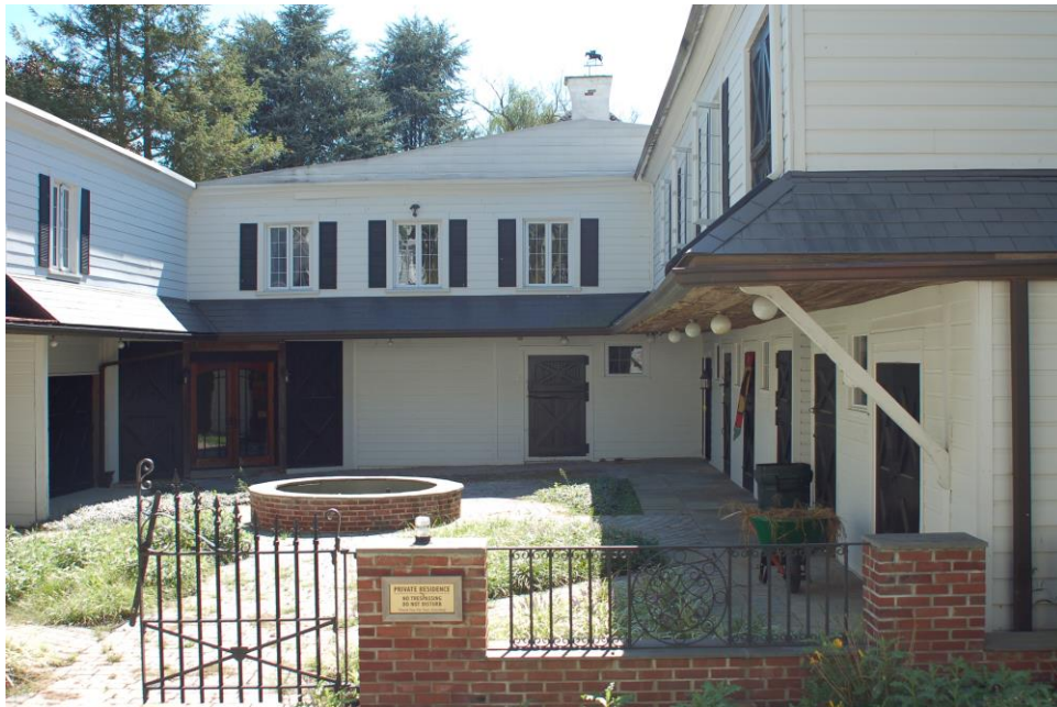
North (front), East, and West Elevations around Courtyard, House