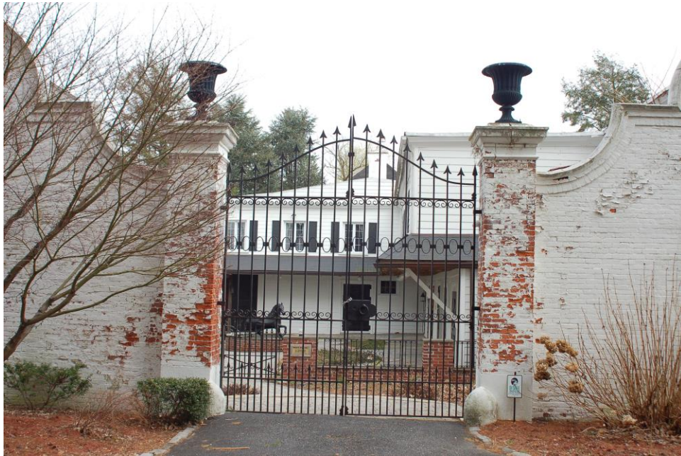
Close-up, North (front) Elevation, House, Showing Gates and Courtyard