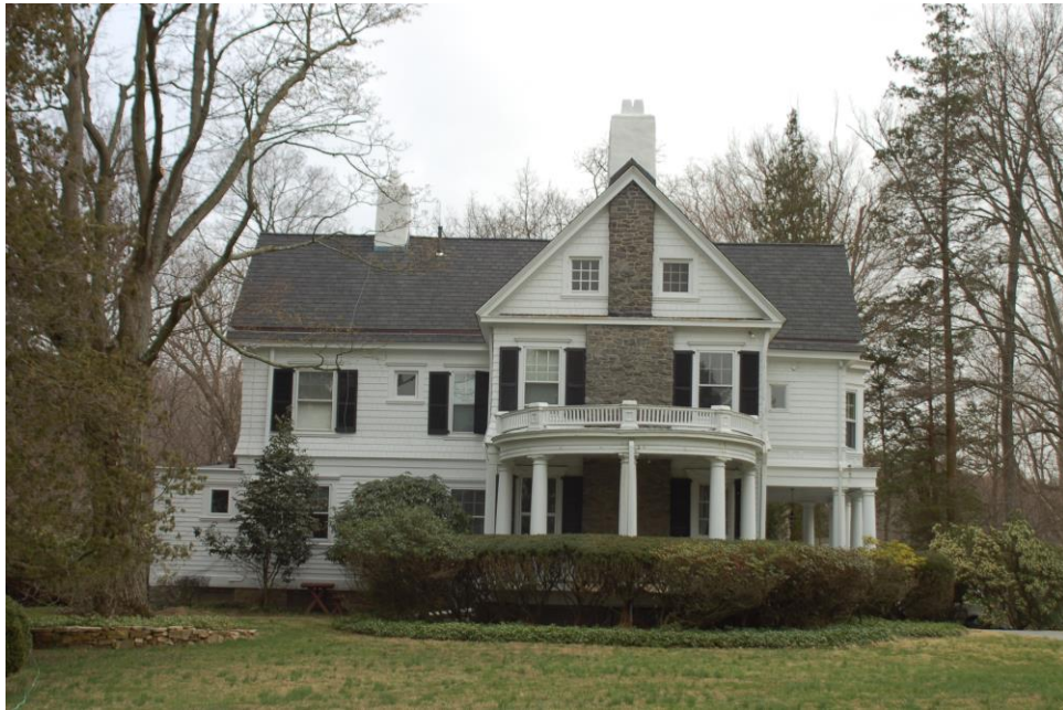
North Elevation, House