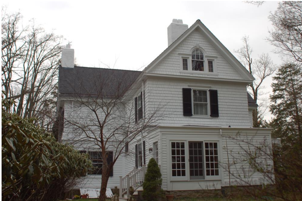
East (back) Elevation, House