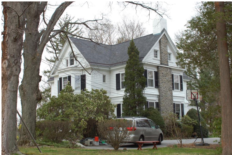
East (back) and South Elevations, House