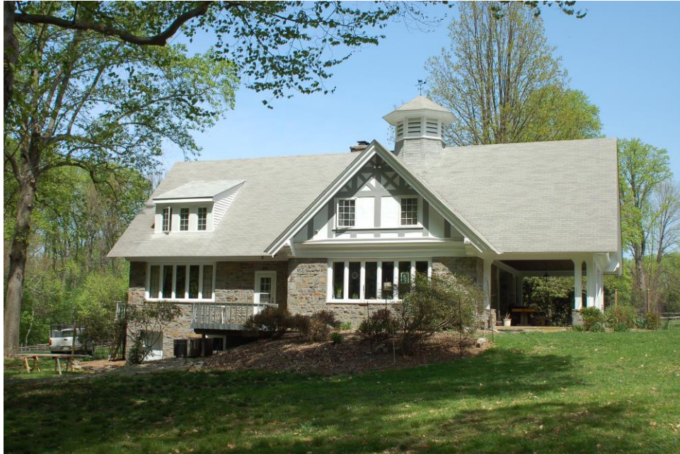
West Elevation, House