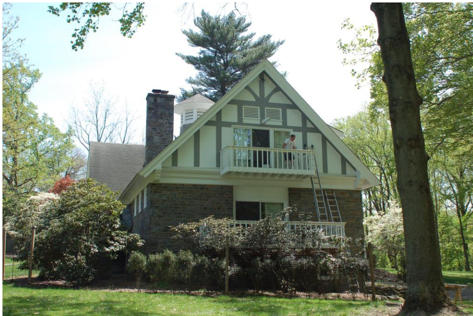
North (back) Elevation, House