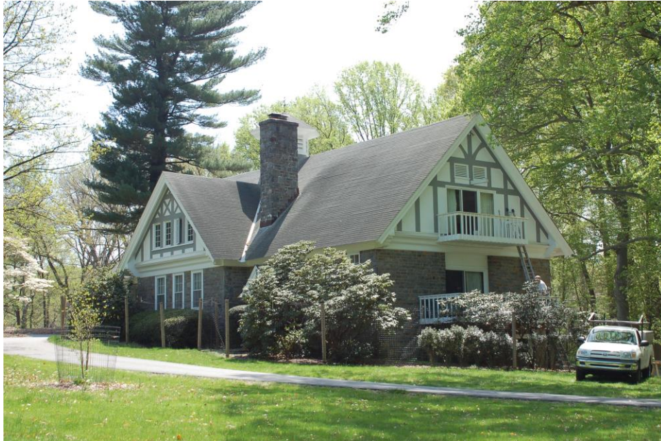
East and North (back) Elevations, House