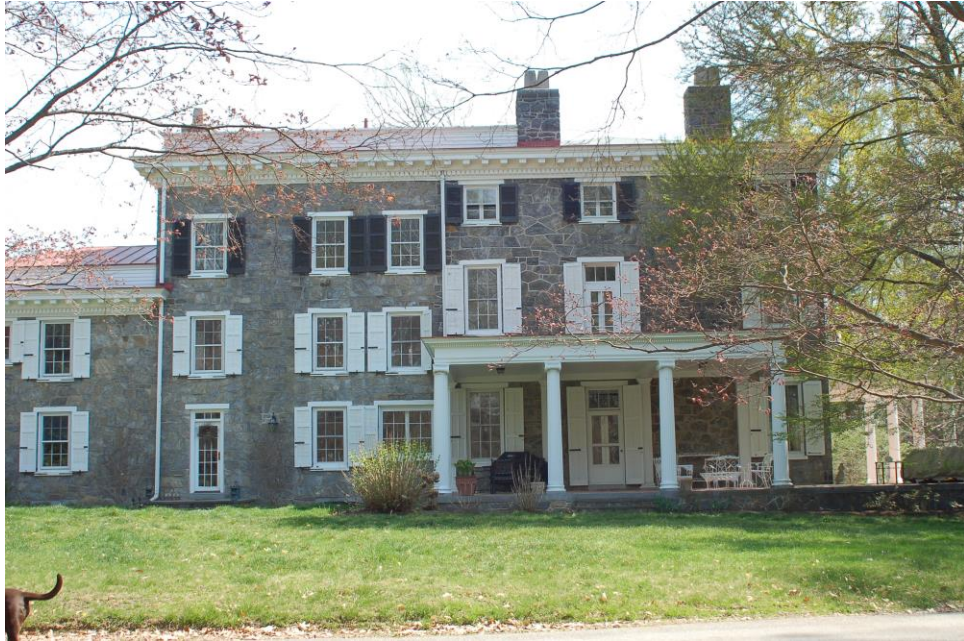
West Elevation, House