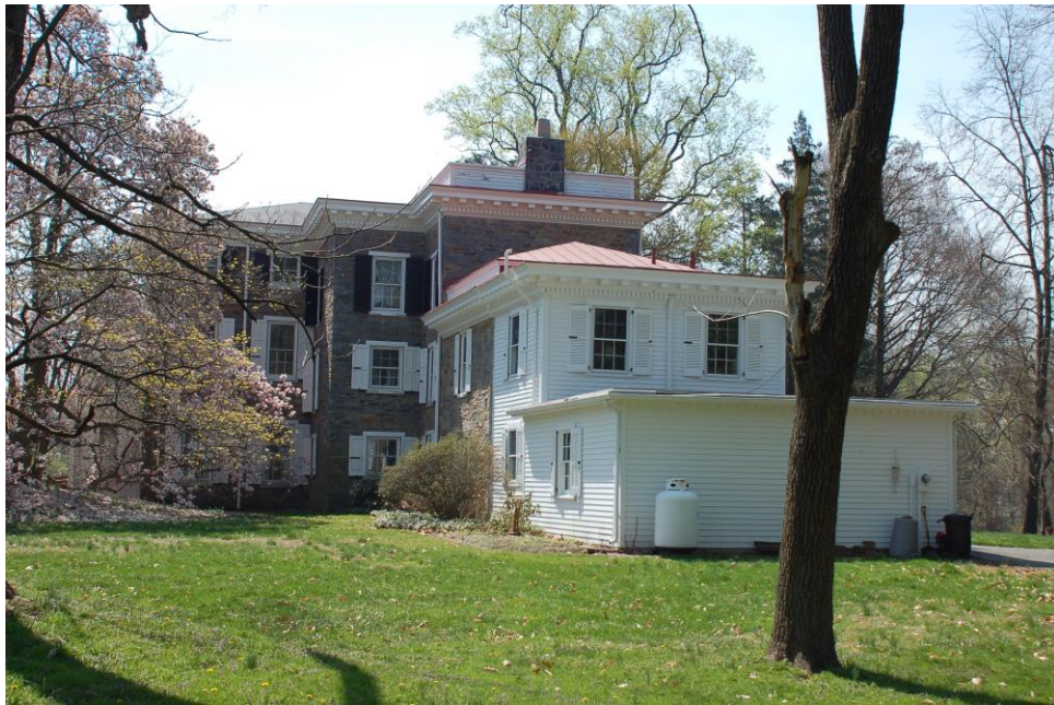
North (back) Elevation, House