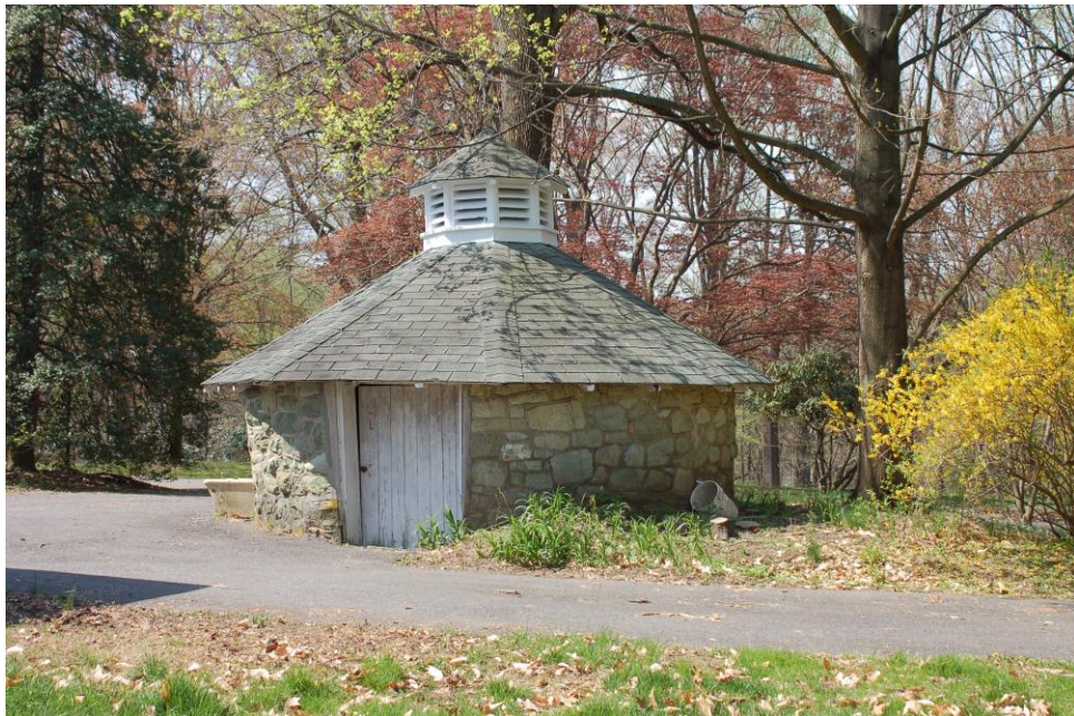
East Elevation, Root Cellar