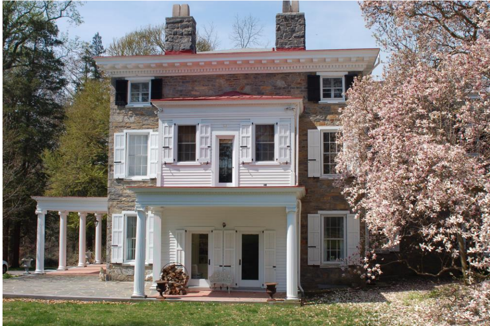
East Elevation, House