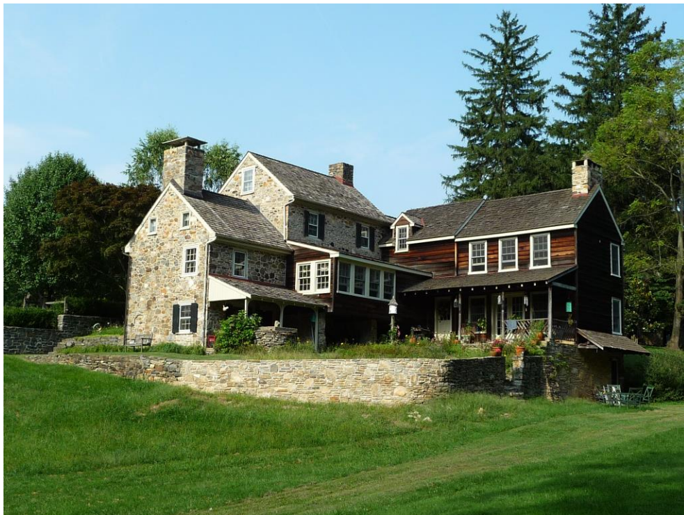
South (back) and West Elevations, House