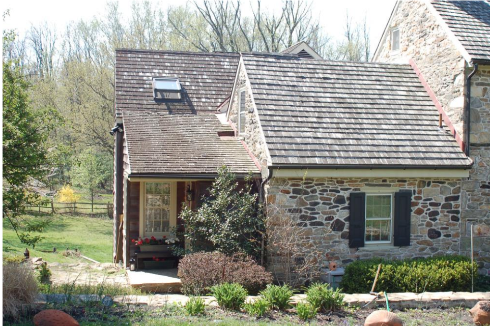
Close-up, North (front) Elevation, House, Showing Eastern and Southern Additions