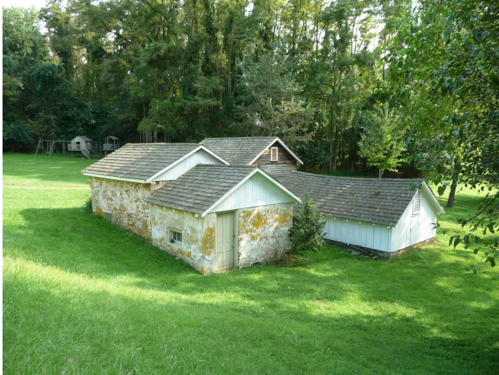
Twin Spring Houses