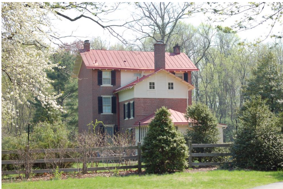
North and West (back) Elevations, House