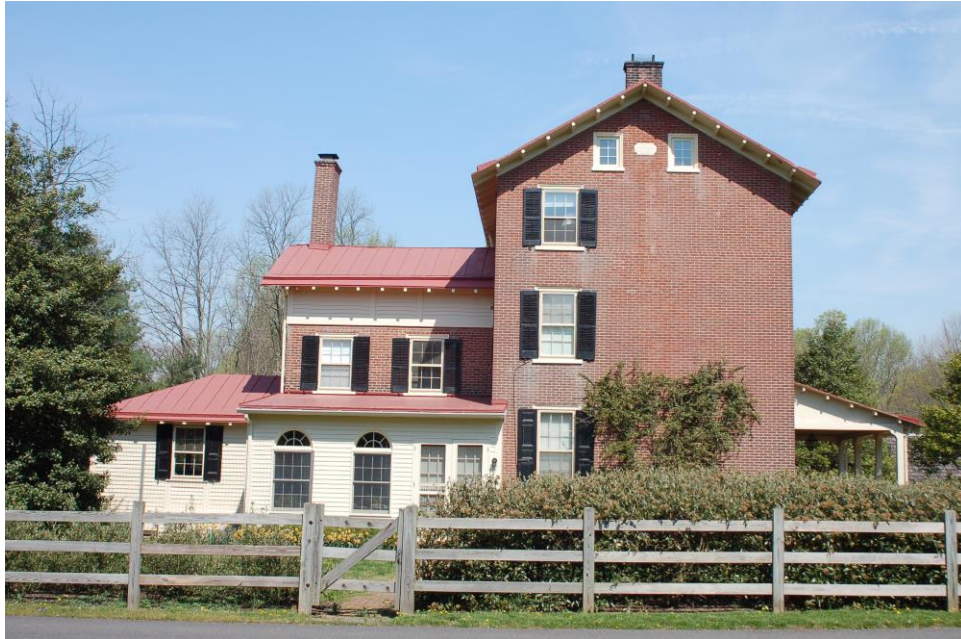
South Elevation, House