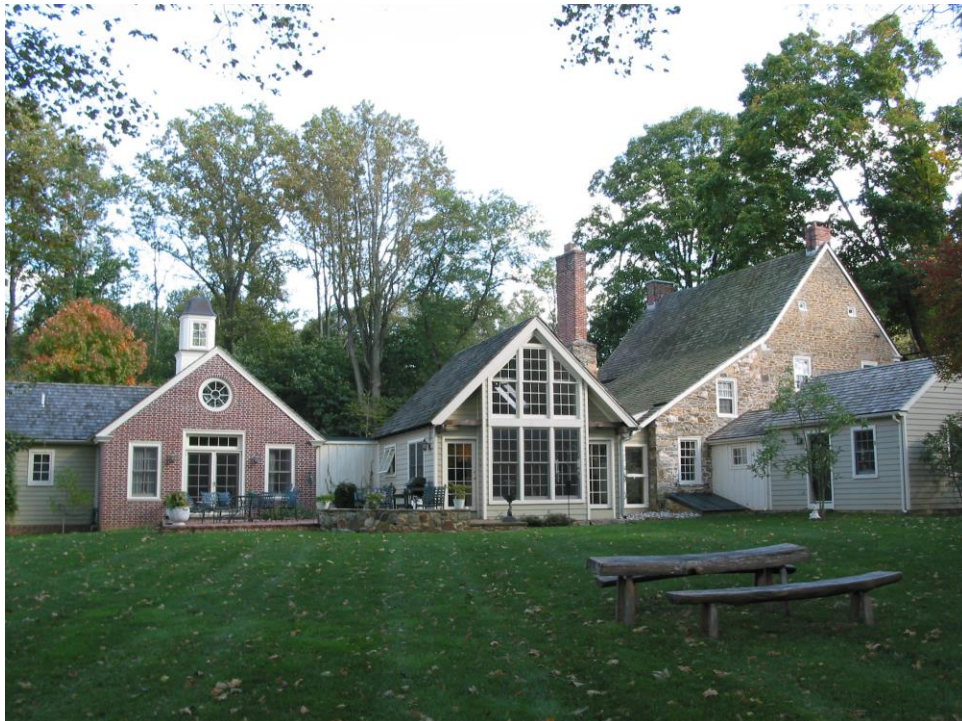
West Elevation, House, Showing Modern Additions