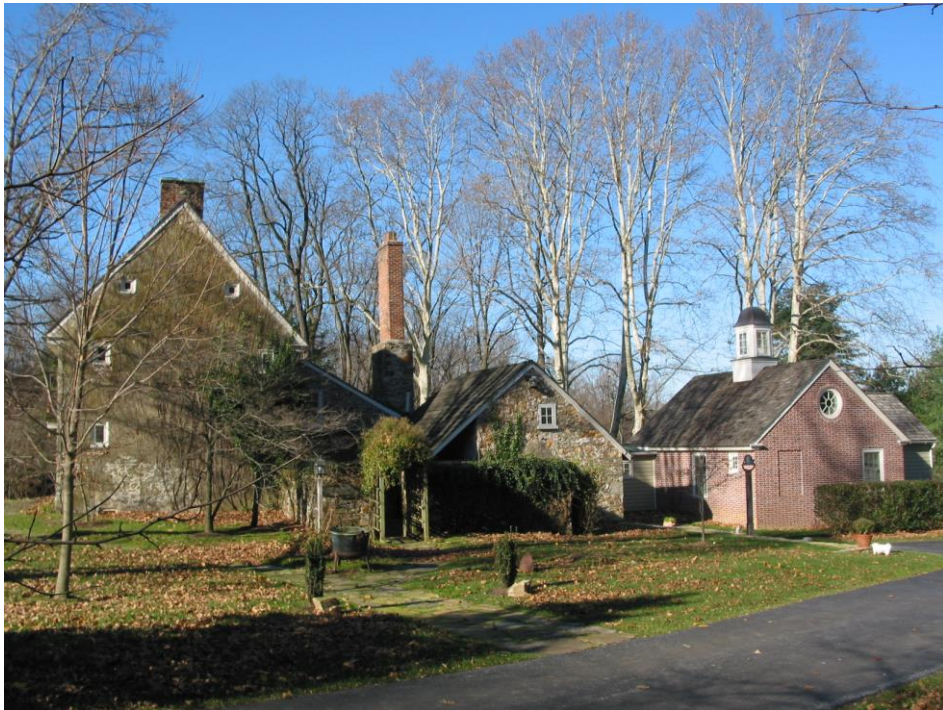
East Elevation, House, Showing Original Spring House, and Modern Addition