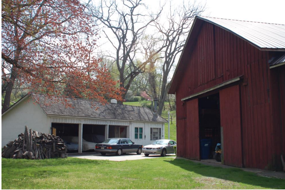
West and South (front) Elevations, Carriage Shed with West Elevation, Barn on Right