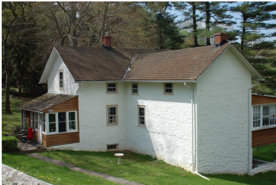
North (back) and West Elevations, House