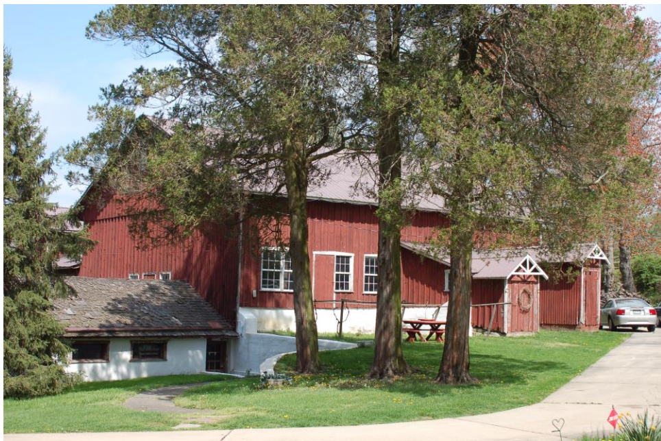
North (back) Elevation, Barn, with Chicken Coop and Corn Crib