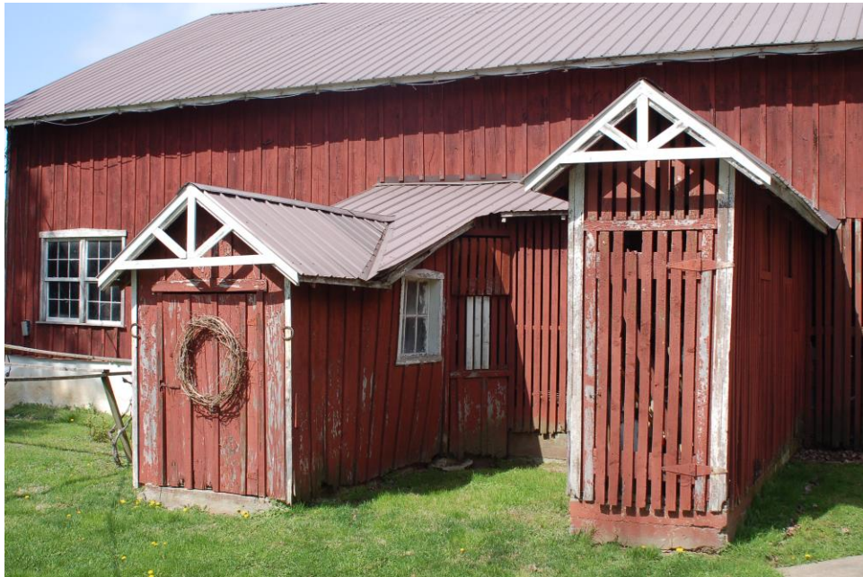
Close-up, Chicken Coop and Corn Crib, North (back) Elevation, Barn