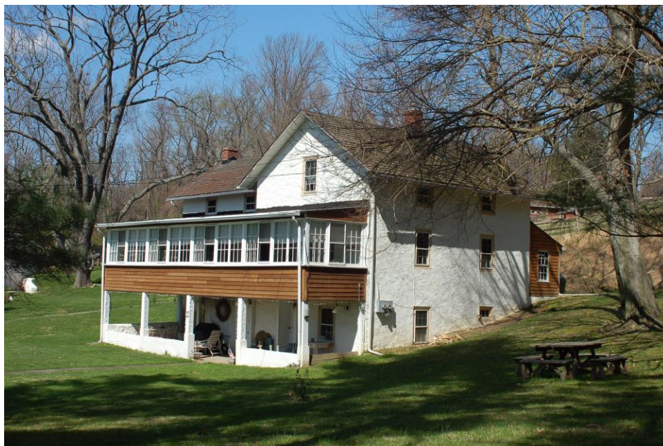
South (front) and East Elevations, House