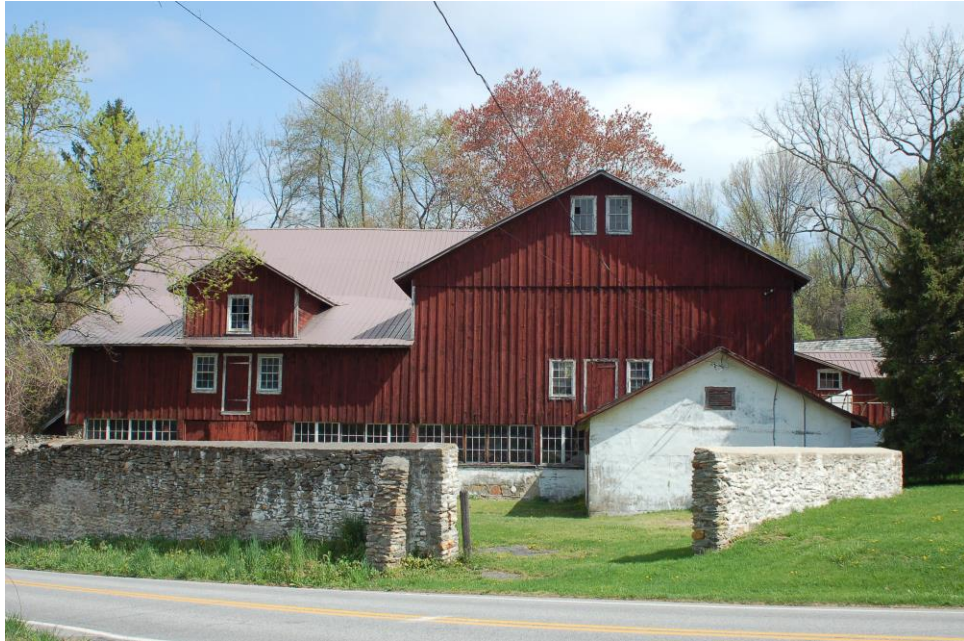
South (front) Elevation, Barn with Milk Shed and Stone Barnyard Wall