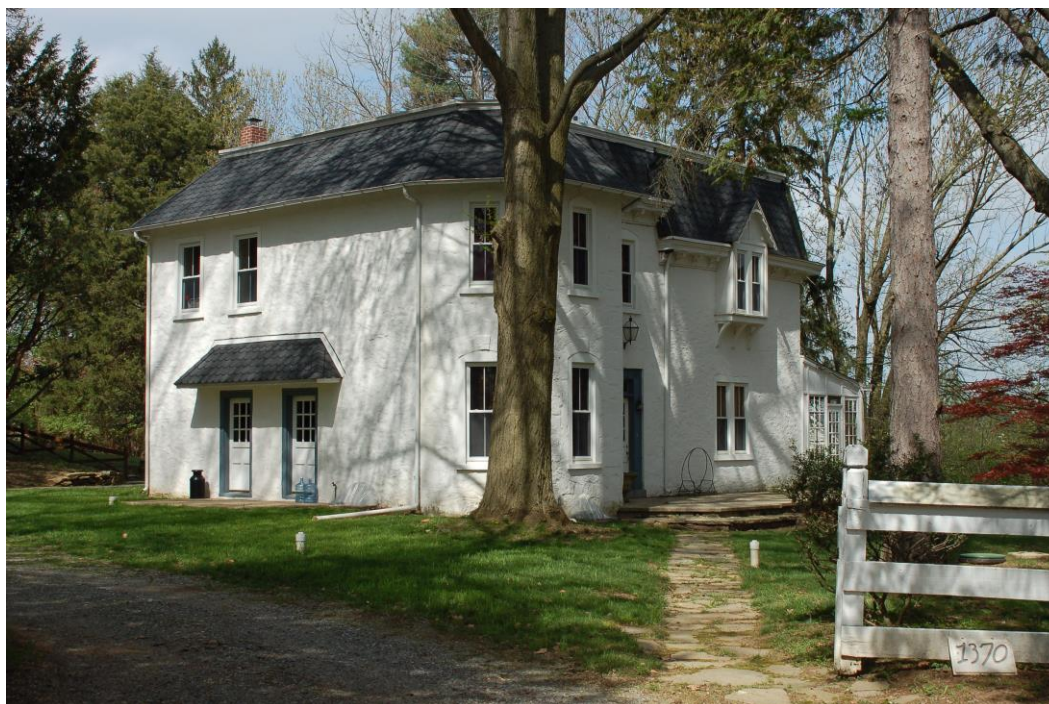
South (back) and East Elevations, House