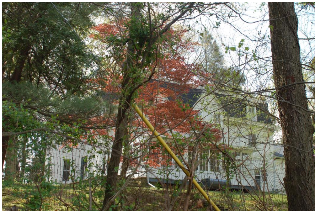
North (front) Elevation, House