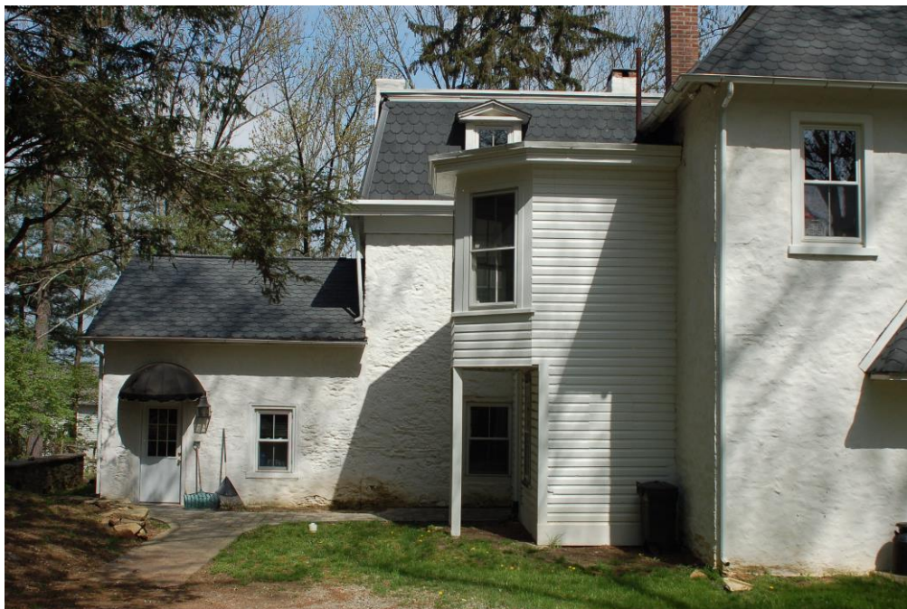
South (back) and West Elevations, House