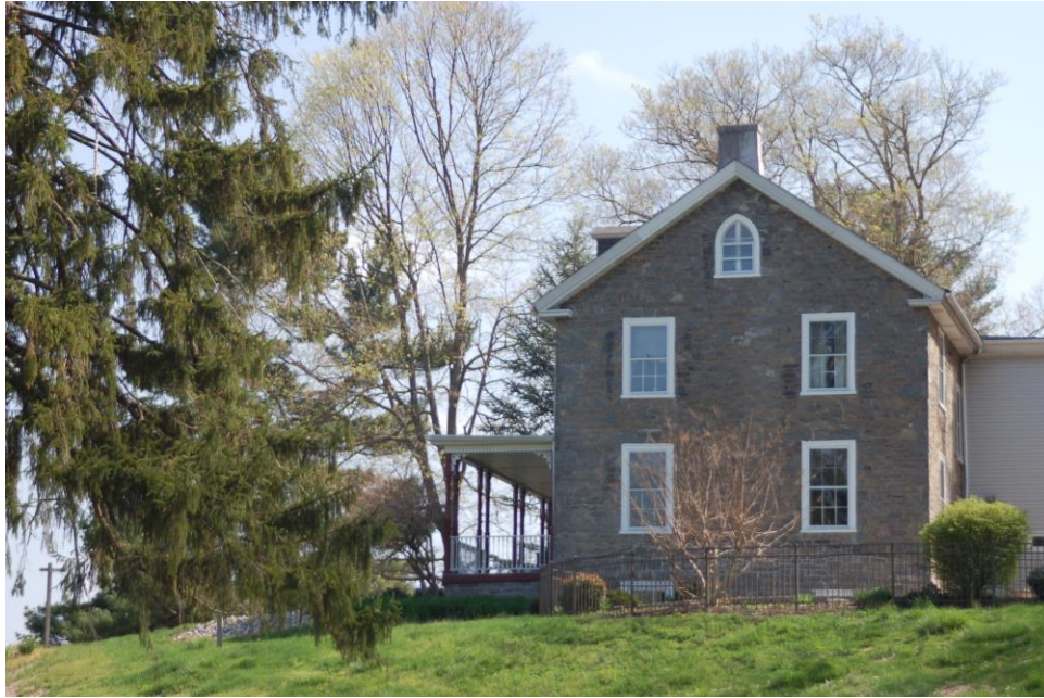
West Elevation, House