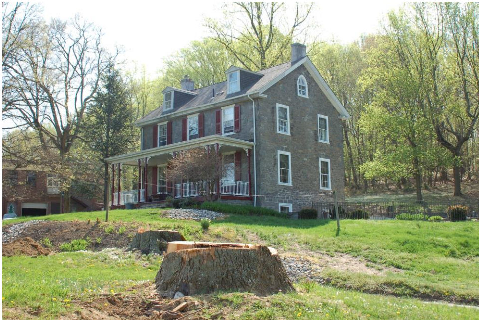
North (front) and West Elevations, House, with St. Vincent DePaul School in Left Background