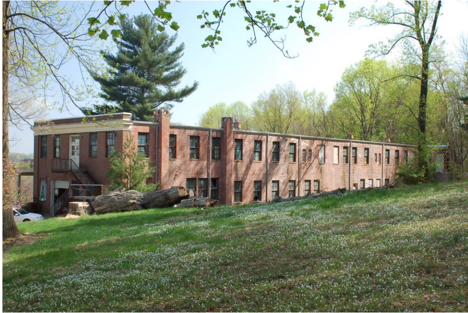
West and South (back) Elevations, St. Vincent dePaul School