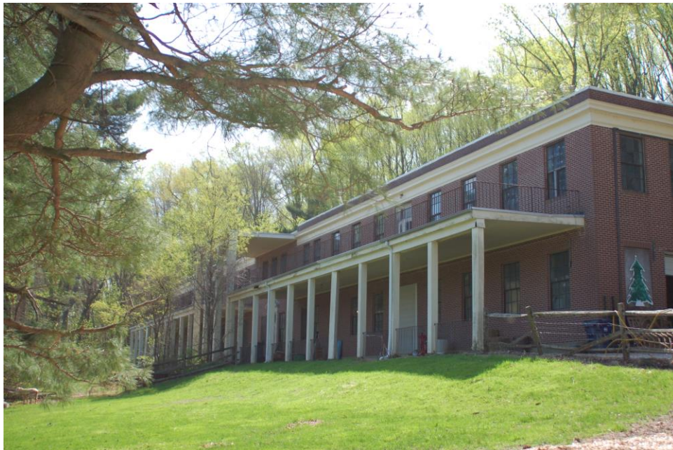
North (front) and West Elevations, St. Vincent dePaul School