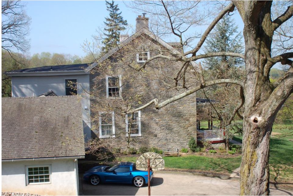
East Elevation, House