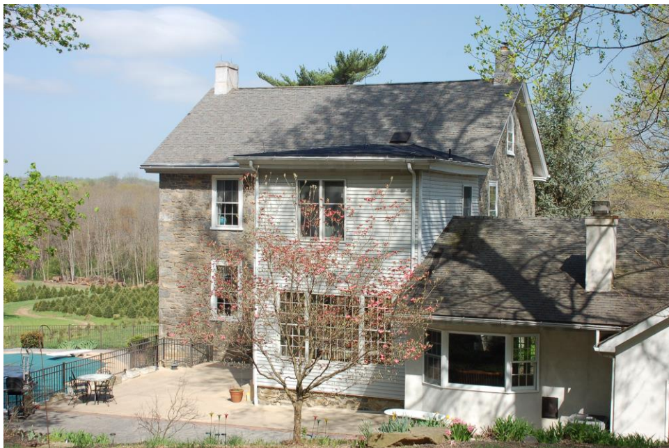
South (back) and East Elevations, House