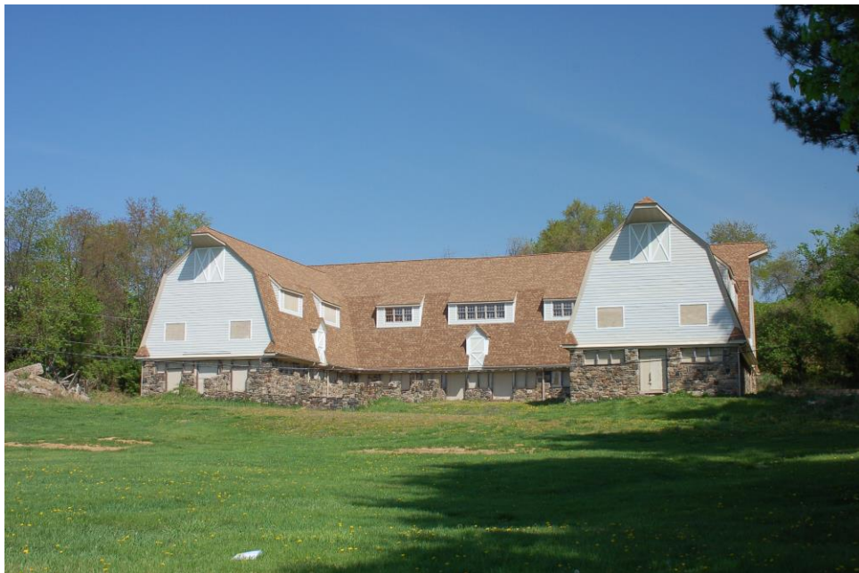
South (front) Elevation, Barn