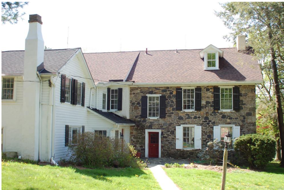
North (back) and West Elevations, House