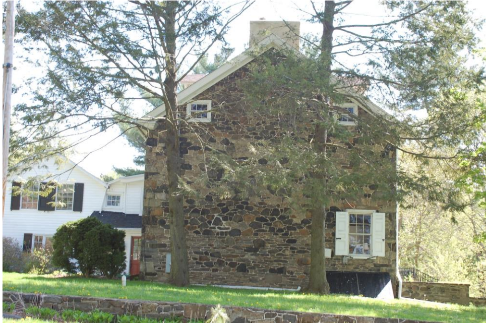
West Elevation, House