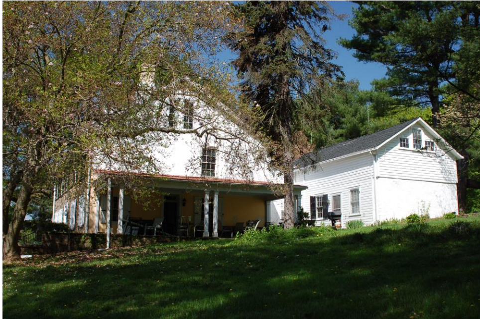
East Elevation, House