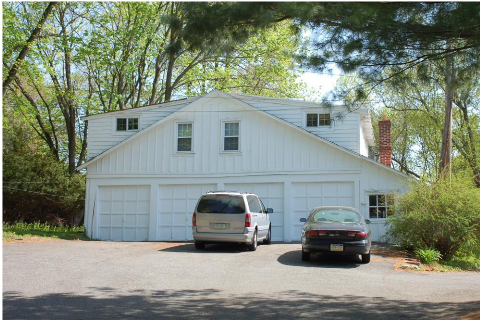
West Elevation, Garage with Apartments