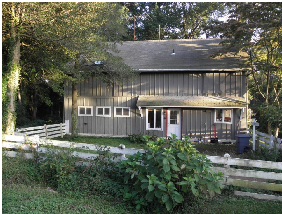
North Elevation, Bank-house / Barn