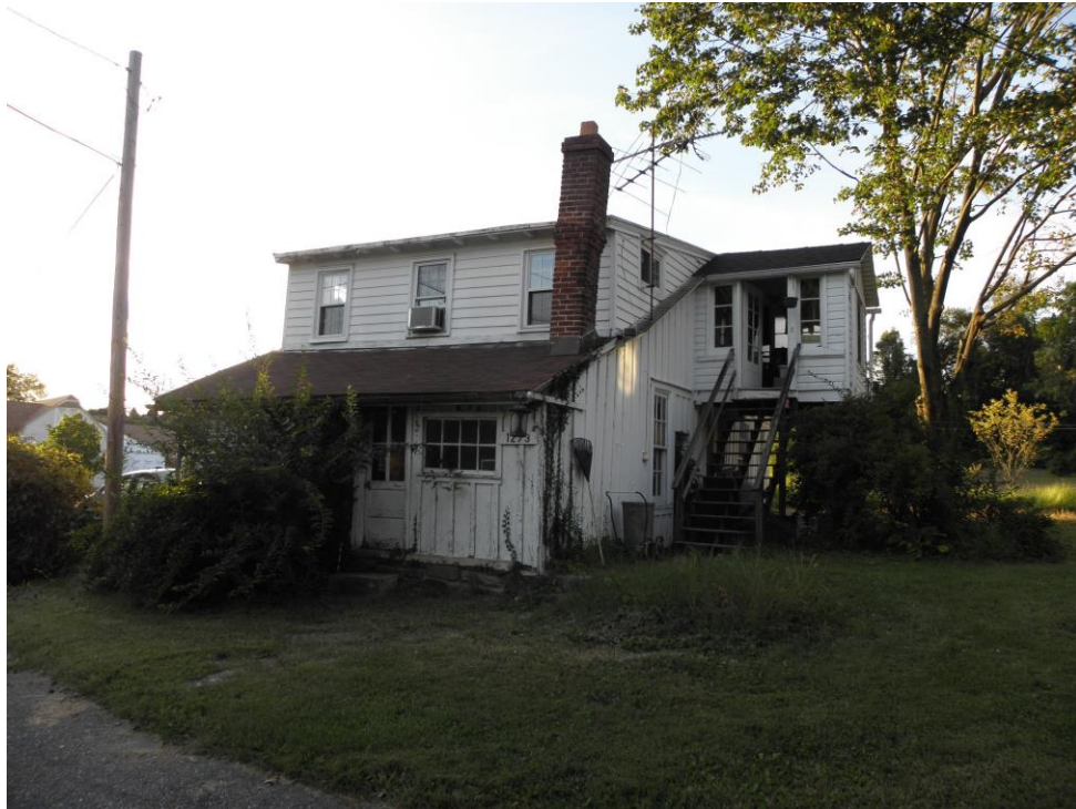
South and East Elevations, Garage with Apartments