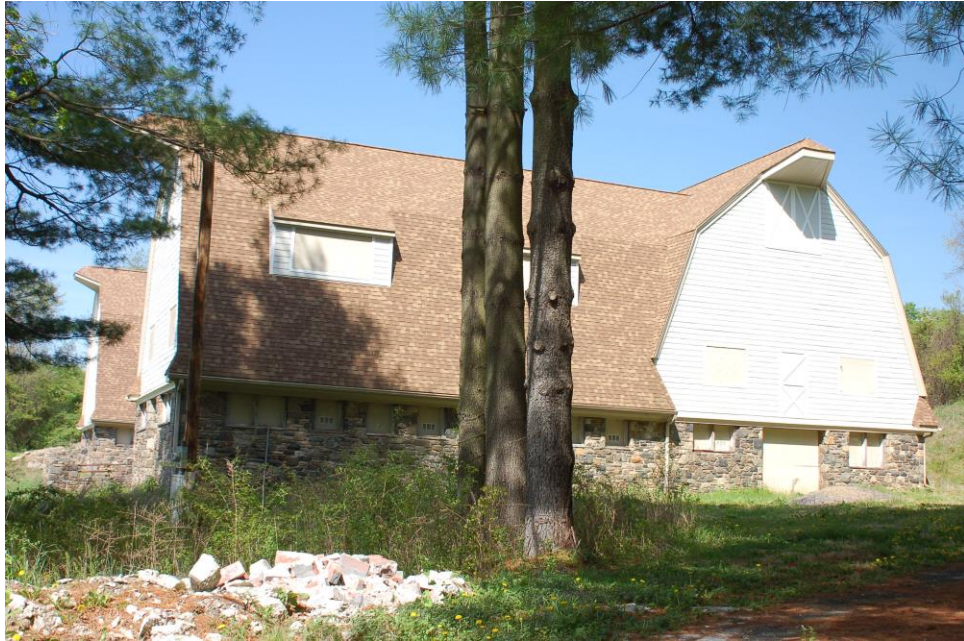
East Elevation, Barn