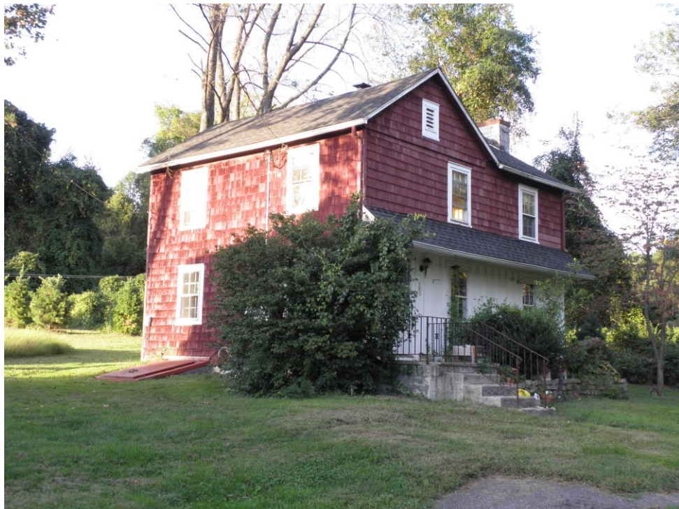
West and South (front) Elevations, Tenant House