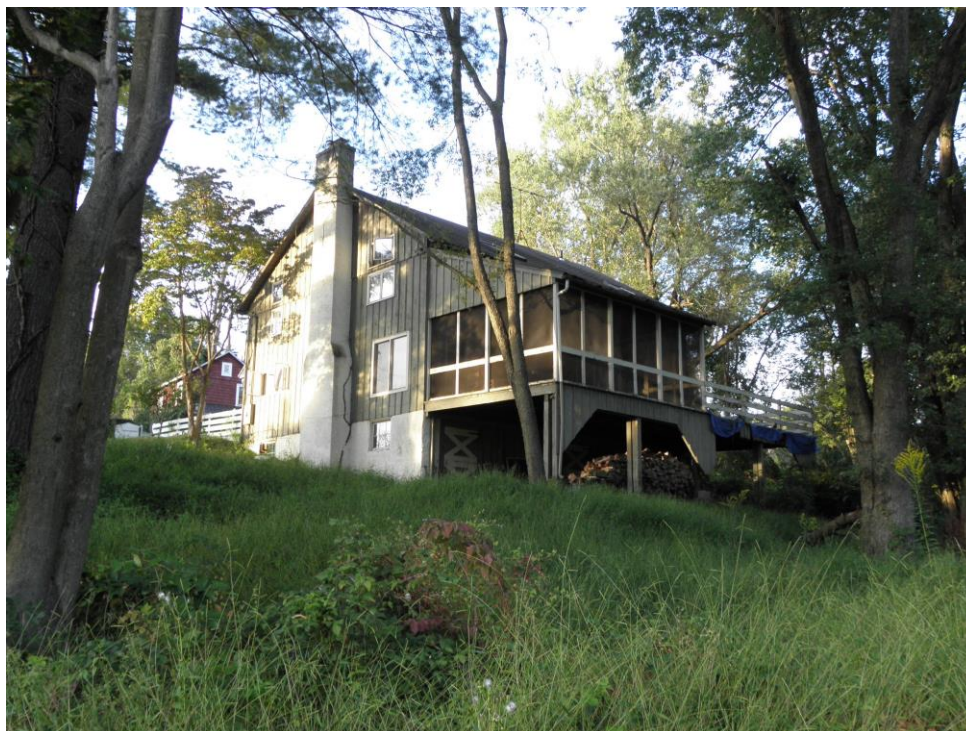
North Elevation, Bank-house / Barn