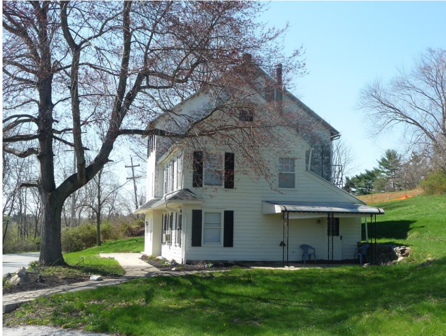
South (front) and East Elevations, House