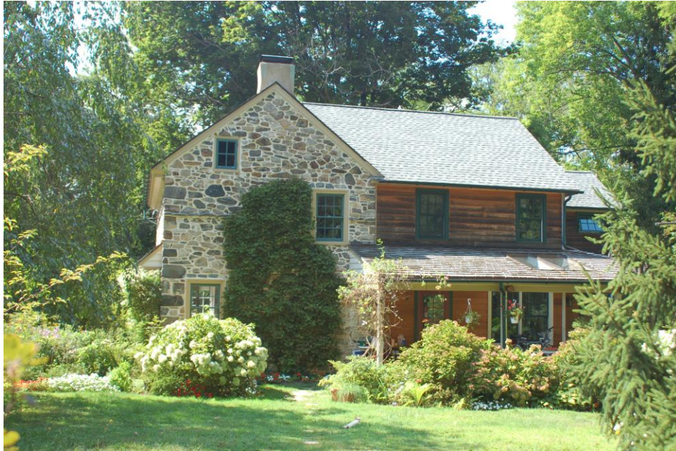
East Elevation, House