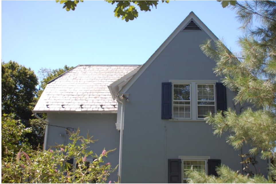
East Elevation, House