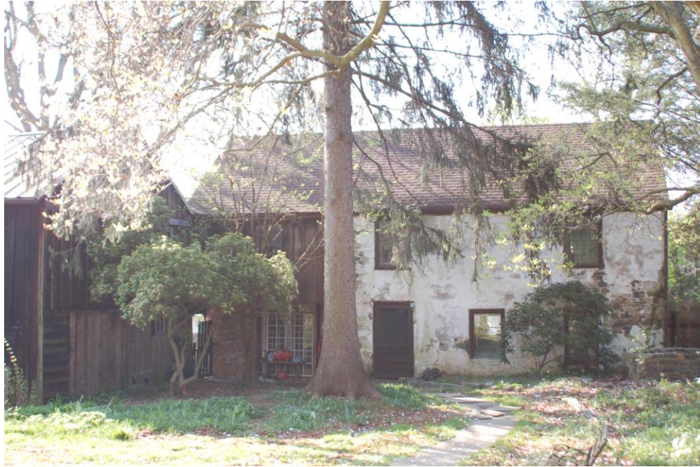
North (back) Elevation, Blacksmith Shop