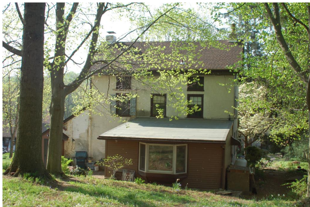
North (back) Elevation, House