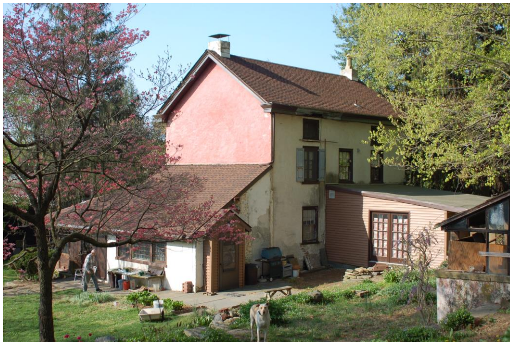
West and North (back) Elevations, House