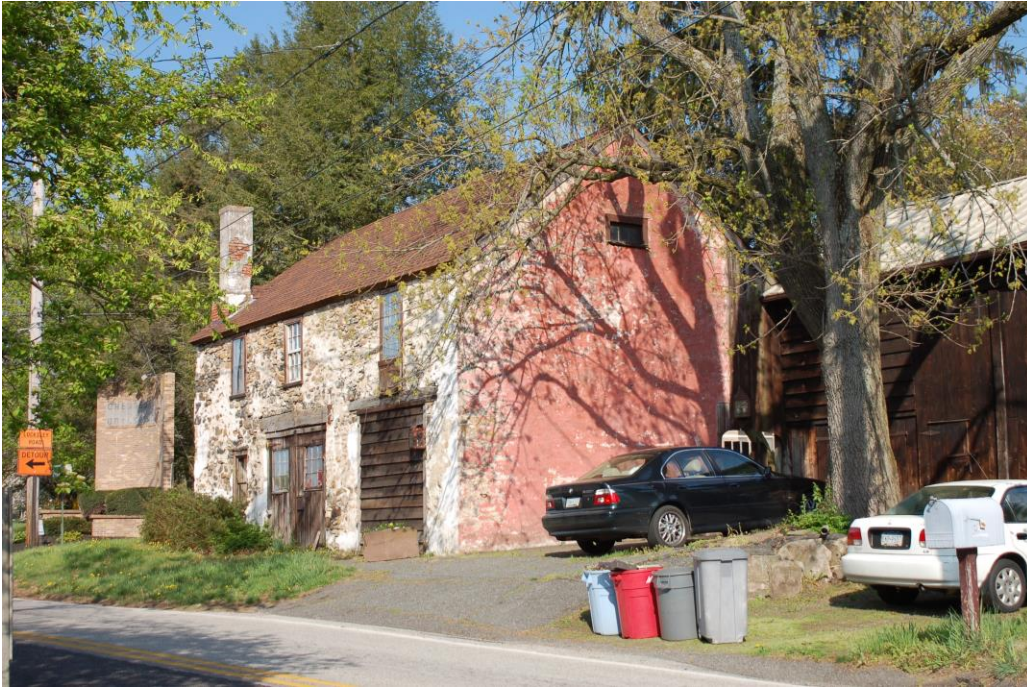
South (front) Elevations, Blacksmith (on left) and Wheelwright (on right) Shops