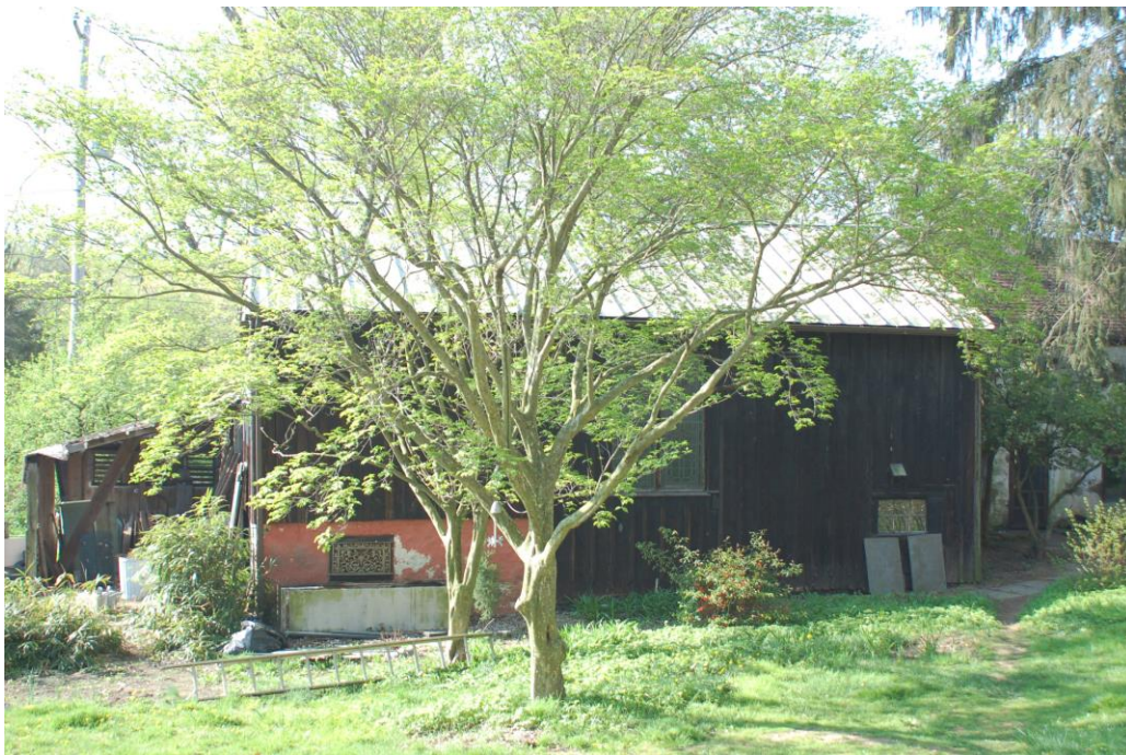
North (back) Elevation, Wheelwright Shop