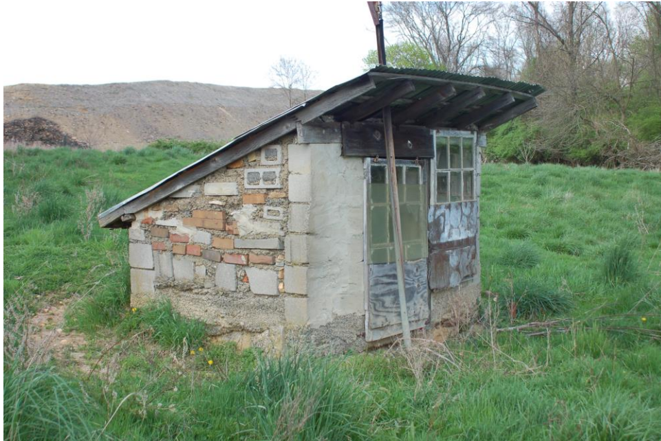
West and South Elevations, Pump House