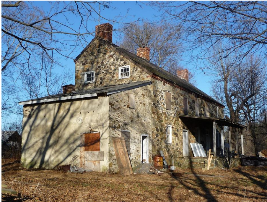
South (front) and West Elevations, House