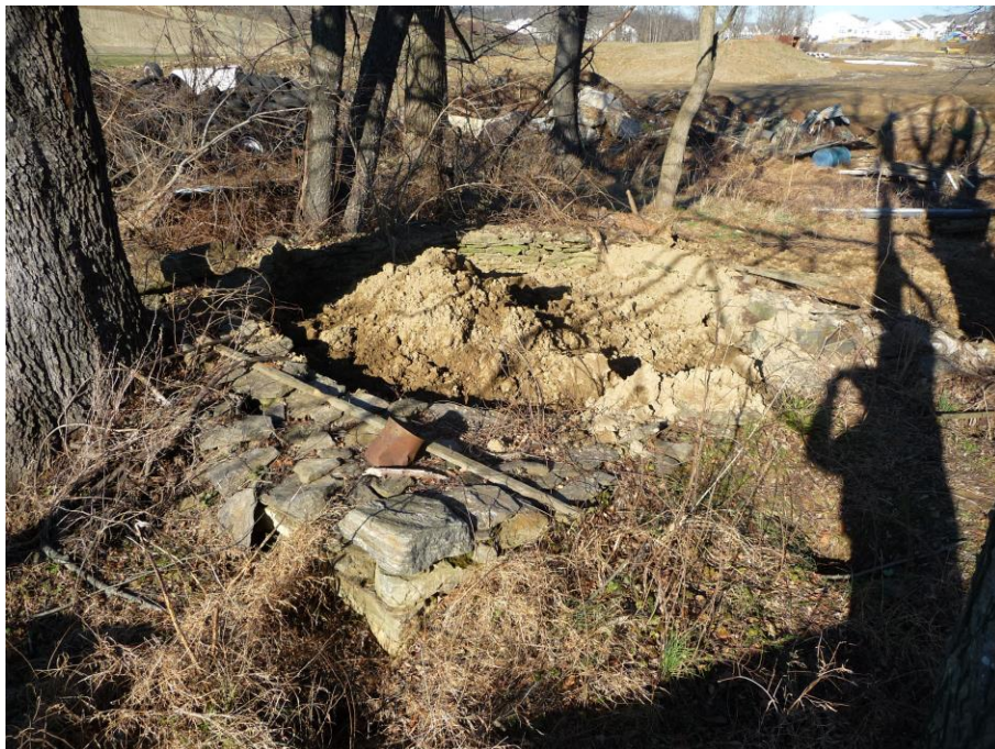
Filled in Ice House Foundation, Looking Northeast