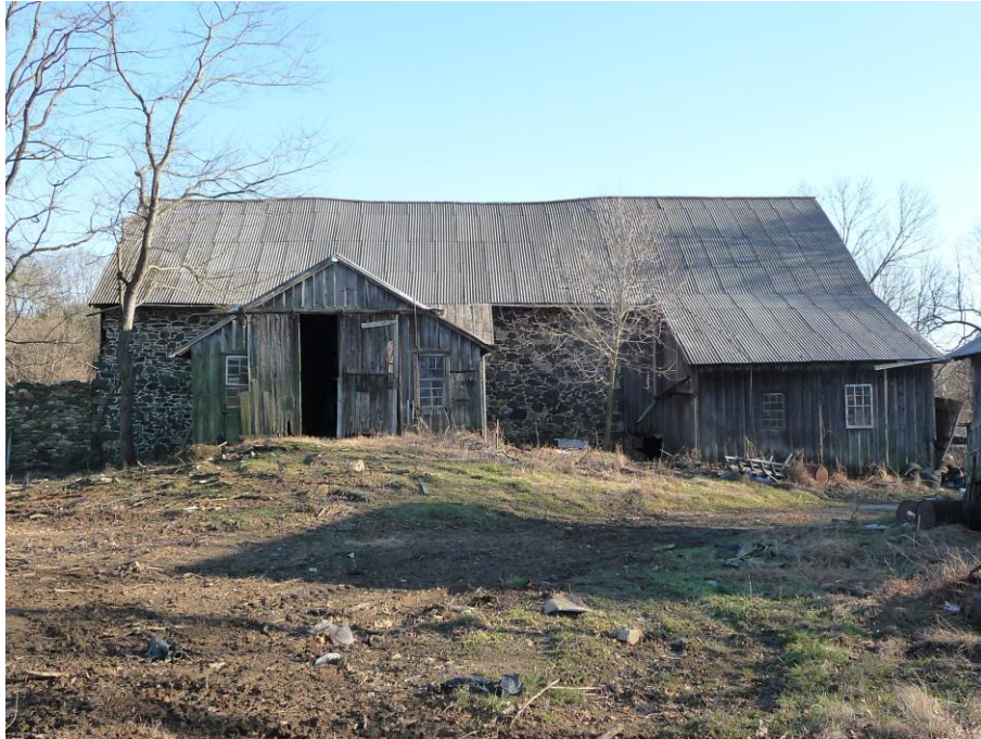
North (back) Elevation, Barn