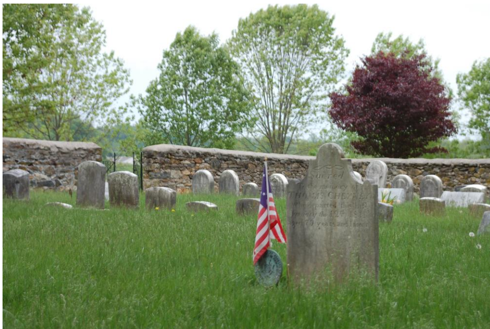
Cheyney Family Cemetery, from the Inside Looking East