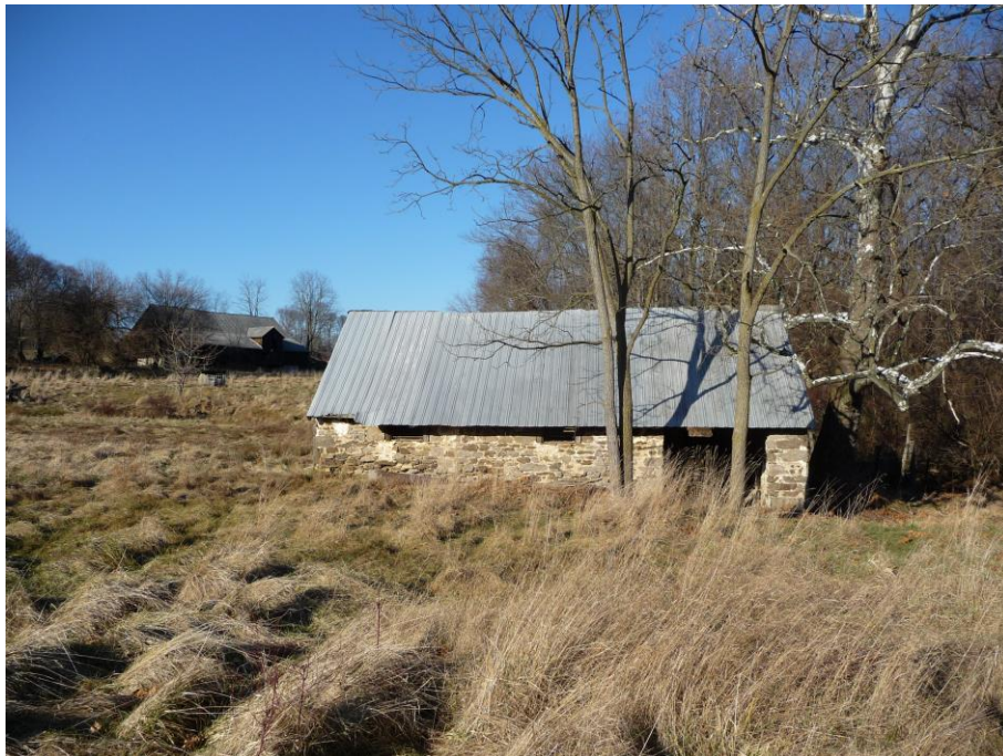
West Elevation, Spring House, with Barn in Left Background