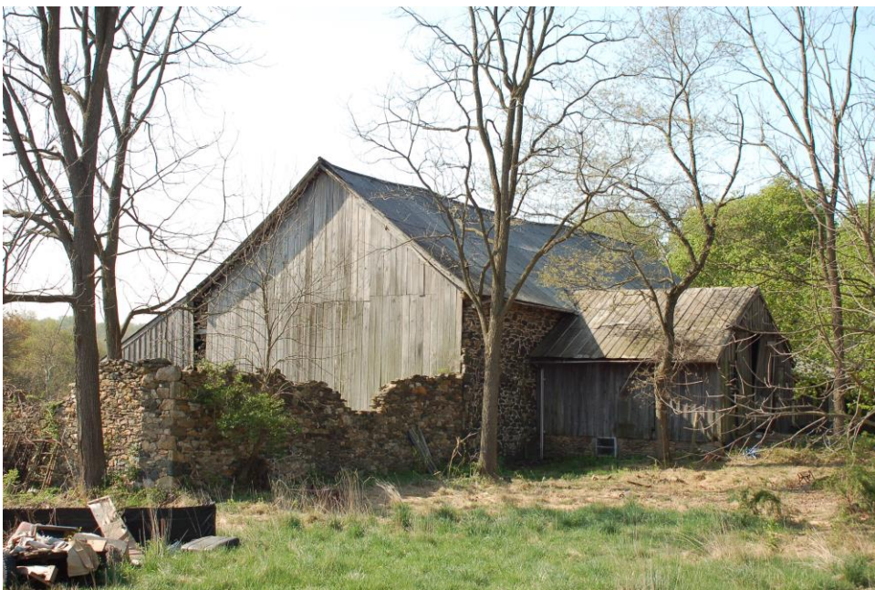
East and North (back) Elevations, Barn & Granary Ruins