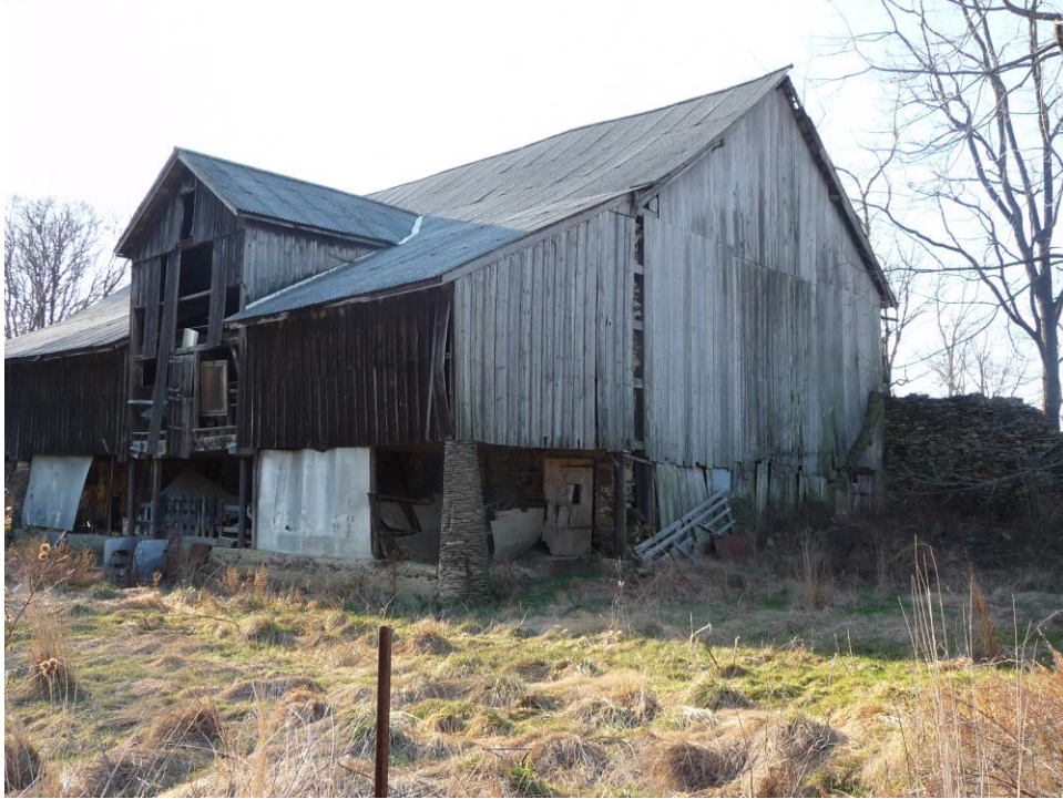
South (front) and East Elevations, Barn, Part of Granary Ruins, Right Background