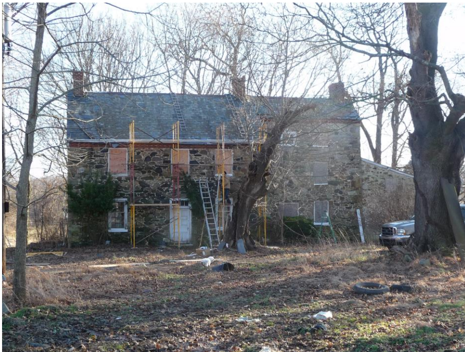
North (back) Elevation, House