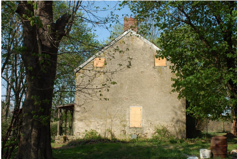
East Elevation, House