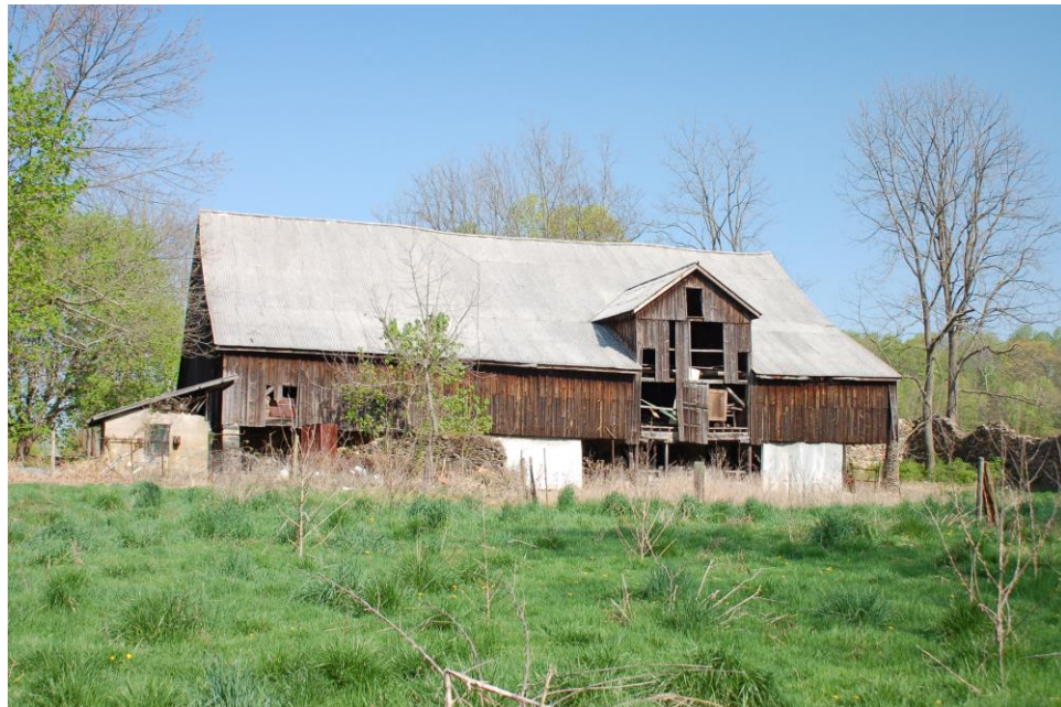
South (front) Elevation, Barn