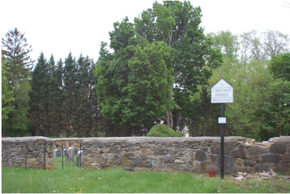
Cheyney Family Cemetery, Looking South