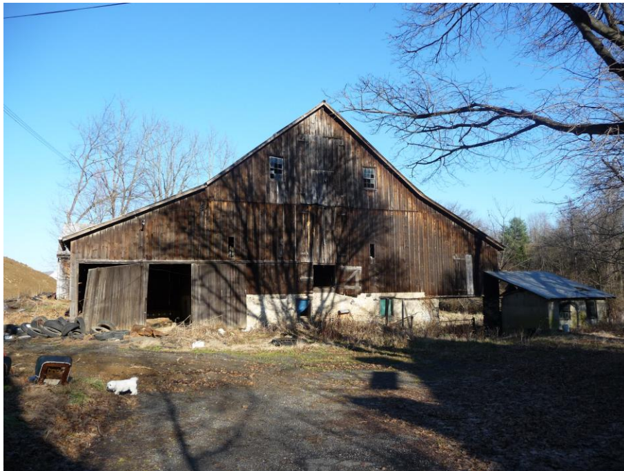
West Elevation, Barn with now demolished (2009) Milk House