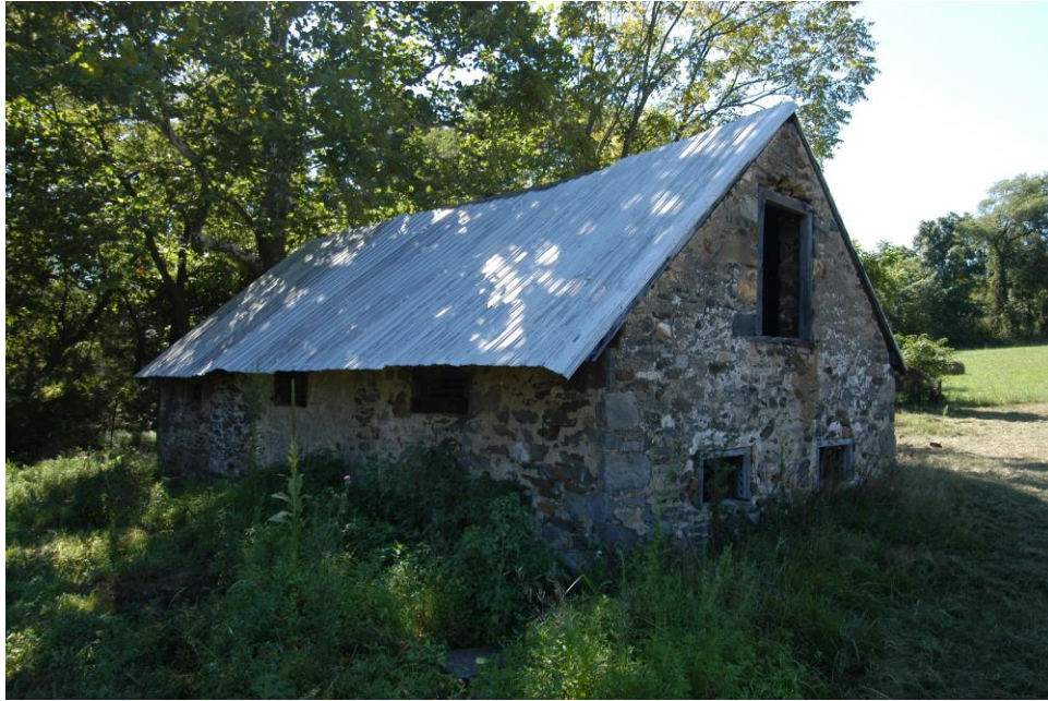
East and North Elevations, Spring house