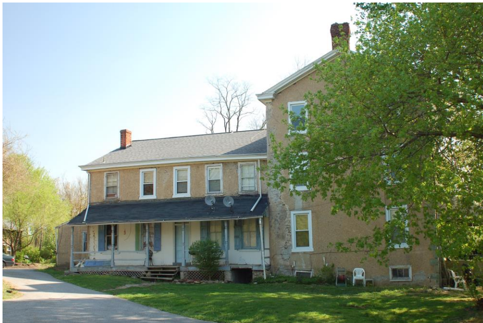
West Elevation, House