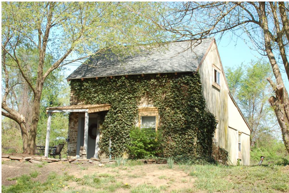
East (front) and North Elevations, Outbuilding