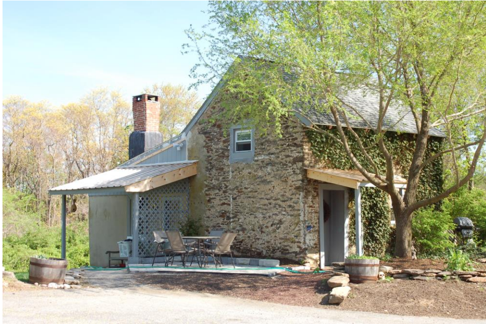
South and East (front) Elevations, Outbuilding