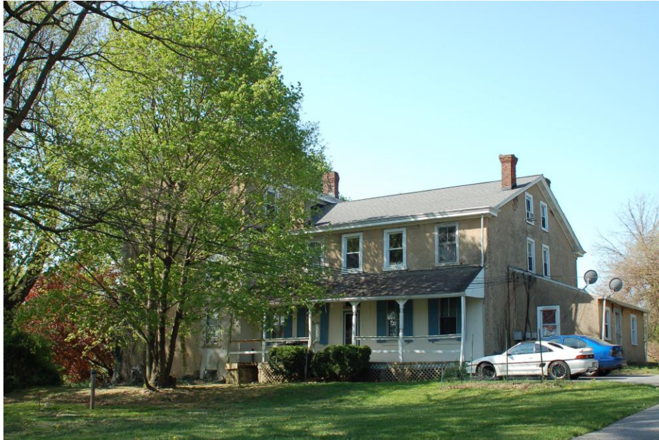
East and North (back) Elevations, House