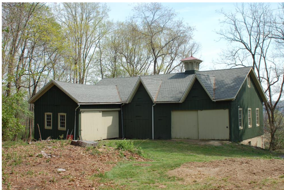
North (back) and East Elevations, Barn