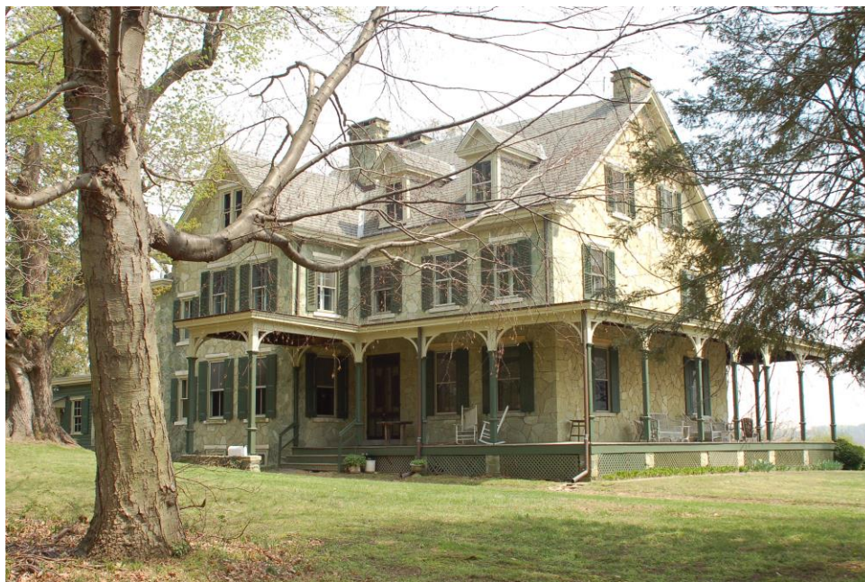
North (back) and West Elevations, House