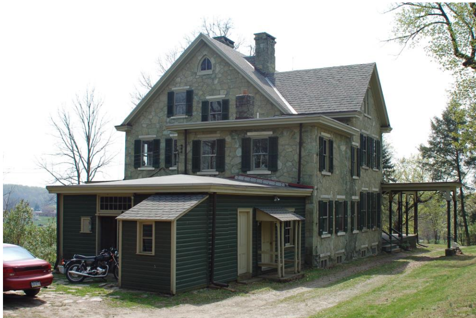
East and North (back) Elevations, House