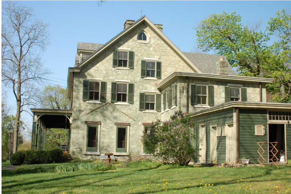
East Elevation, House