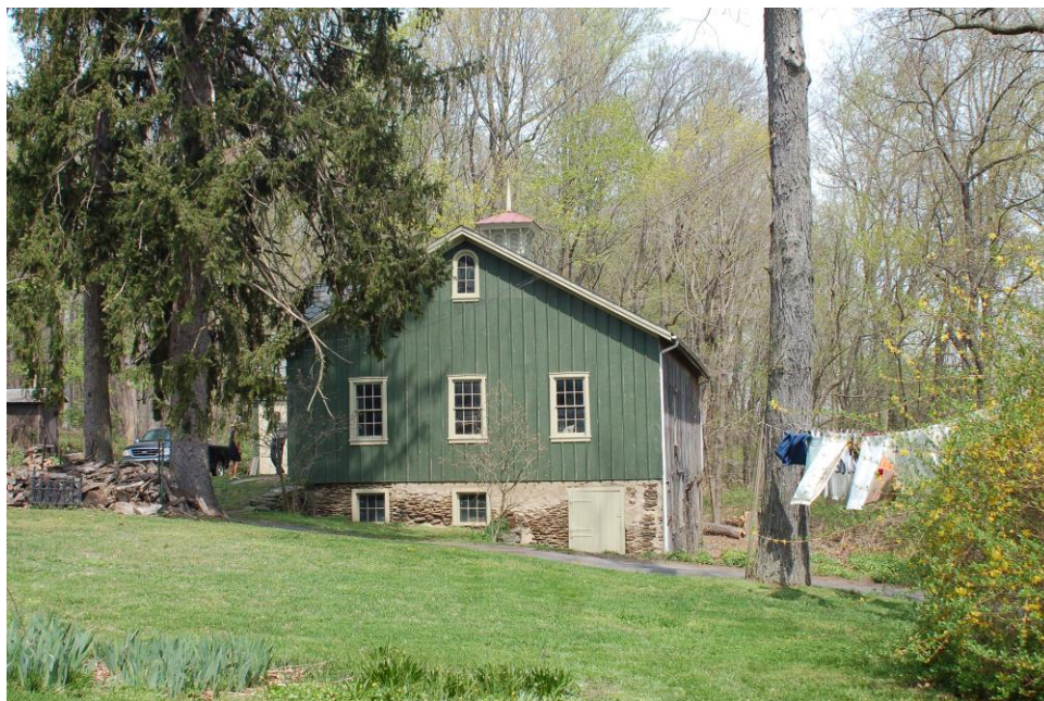
East Elevation, Barn