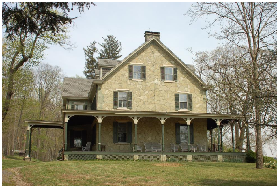
West Elevation, House