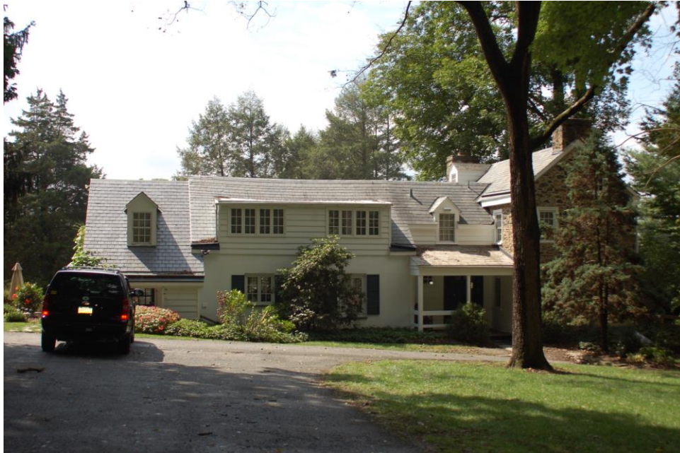
East Elevation, House