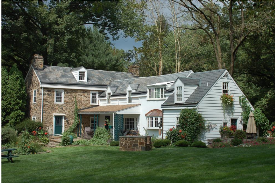
West and South (back) Elevations, House