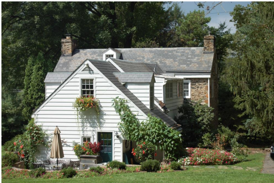
South (back) Elevation, House