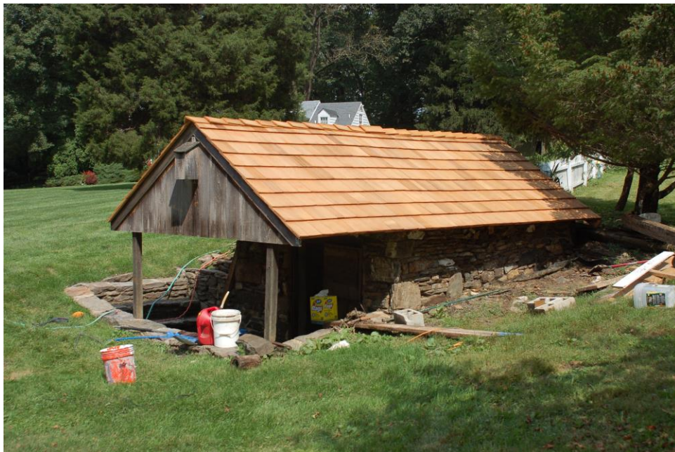
West and South Elevations, Spring House