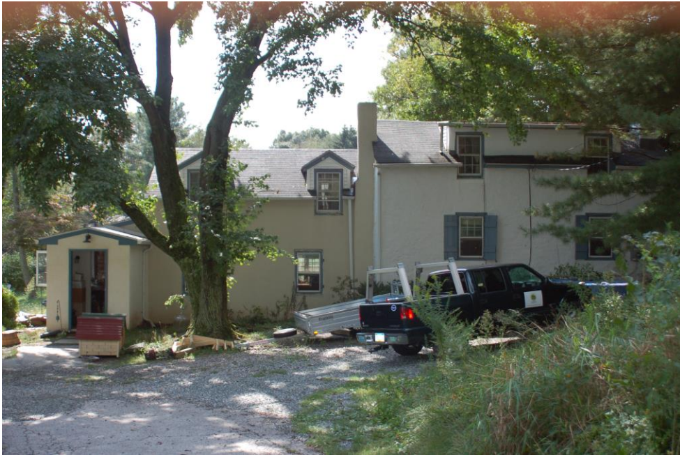
East (back) Elevation, House