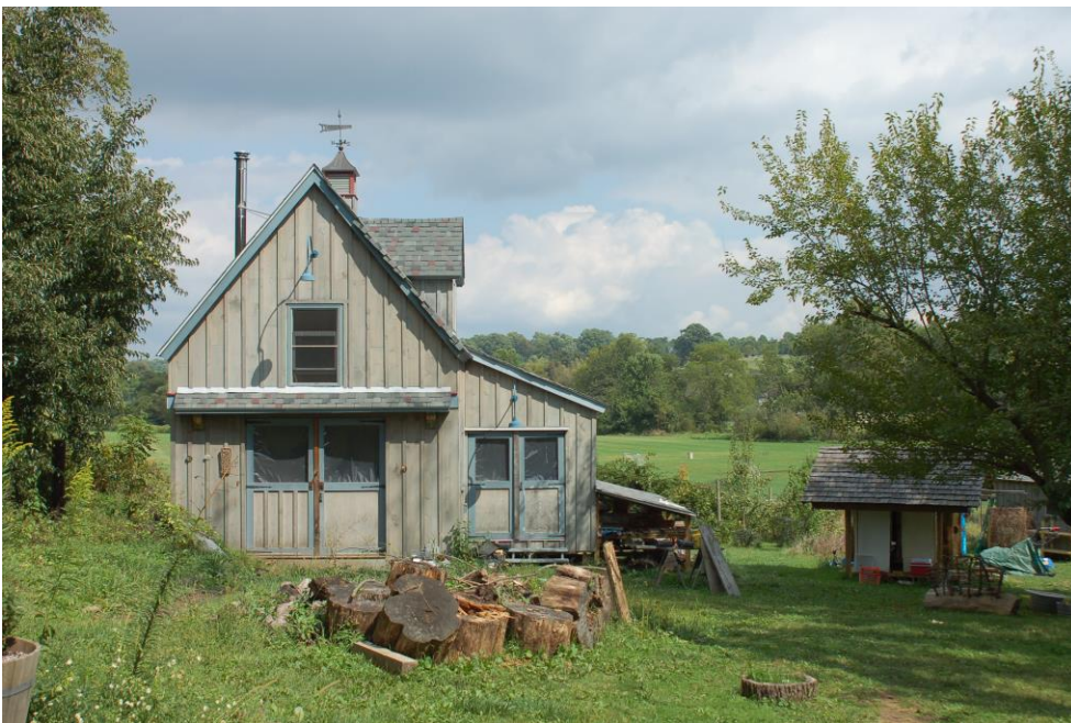
West Elevation, Stable cum Garage and Storage Unit