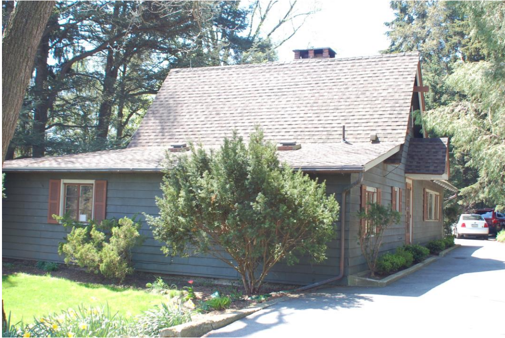
East and North (front) Elevations, Carriage House