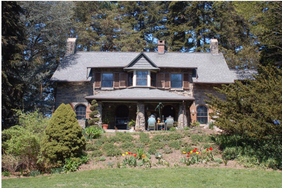
South (back) Elevation, House