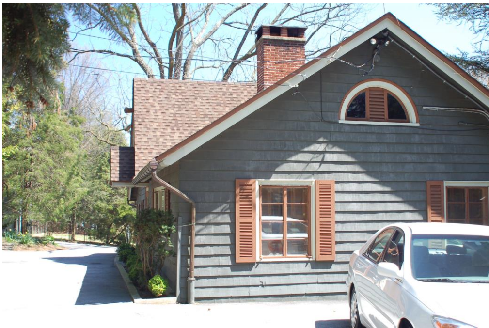
North (front) and West Elevations, Carriage House