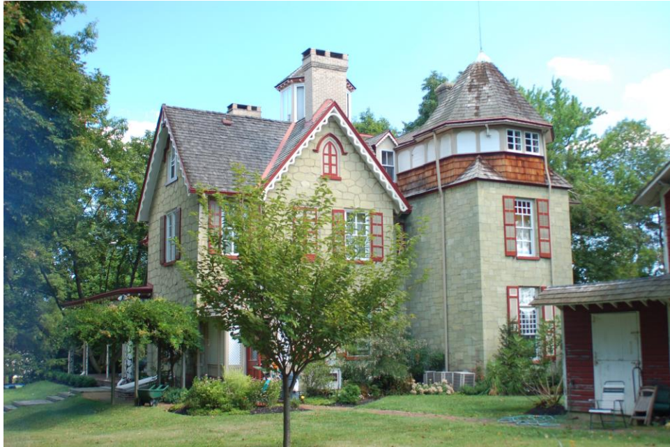
North (front) and West Elevations, House