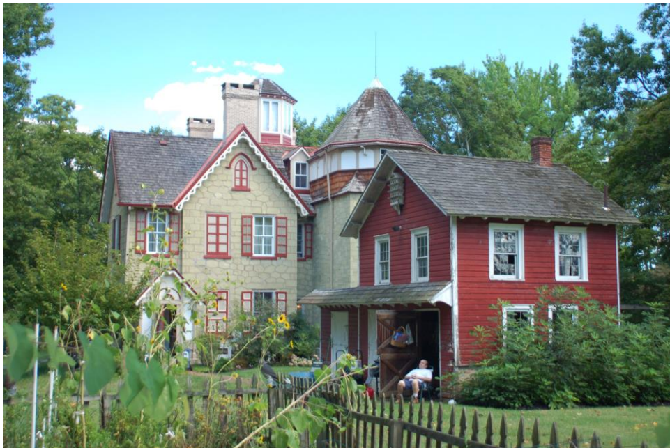
North (front) and West Elevations, Tenant House, with West Elevation, House in Background