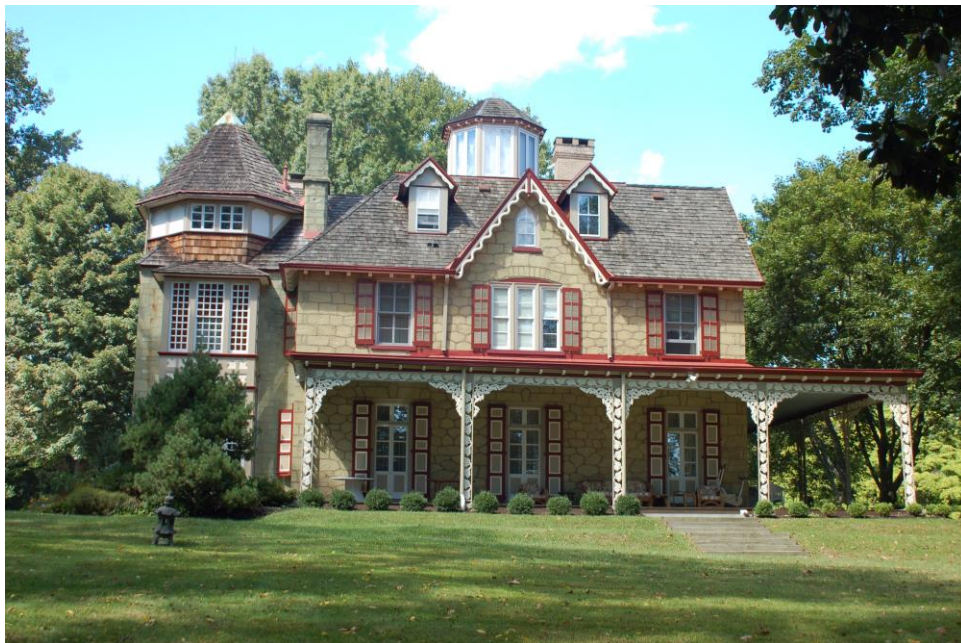
South (back) Elevation, House