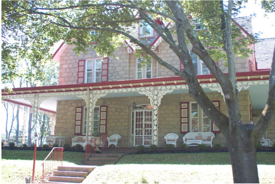
East Elevation, House