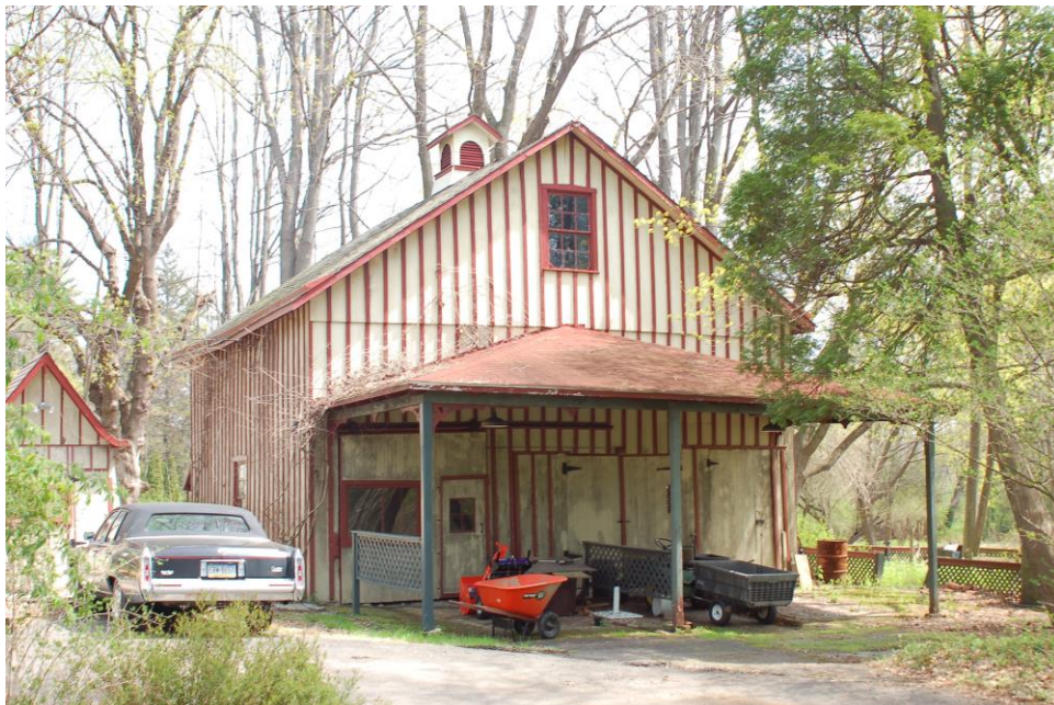
North (front) and East Elevations, Carriage House, with Privy on Left