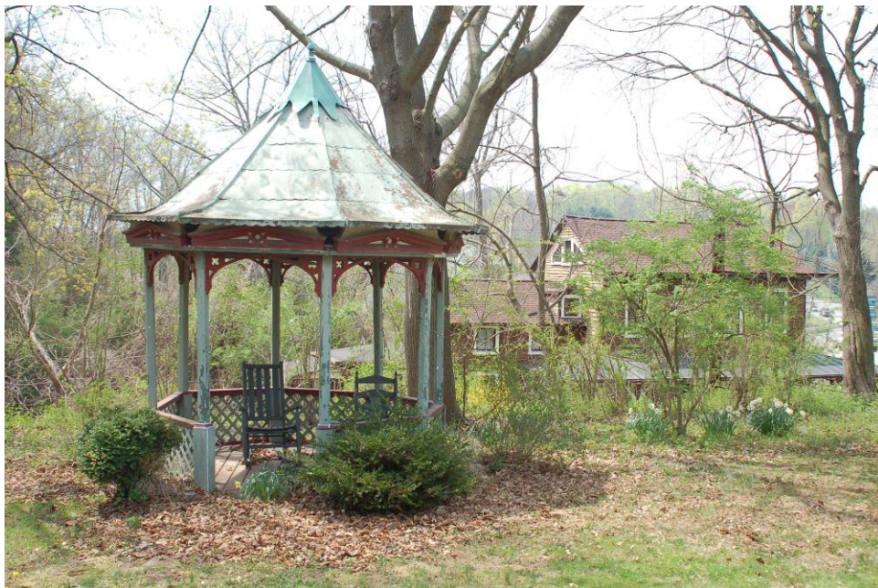
Gazebo, Looking West with Westtown Train Station (HR #091) in Background