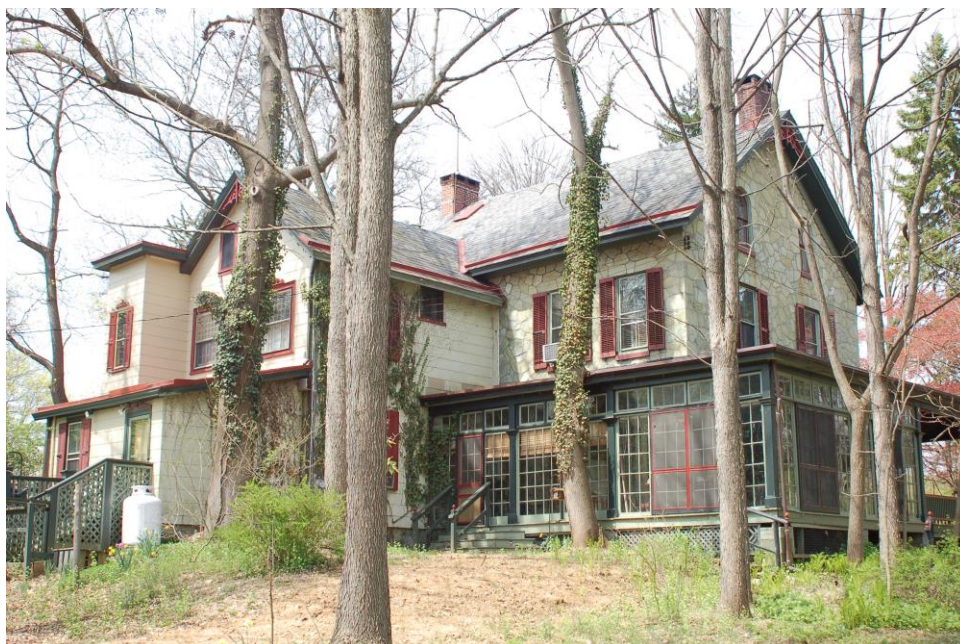
South (back) and East Elevations, House