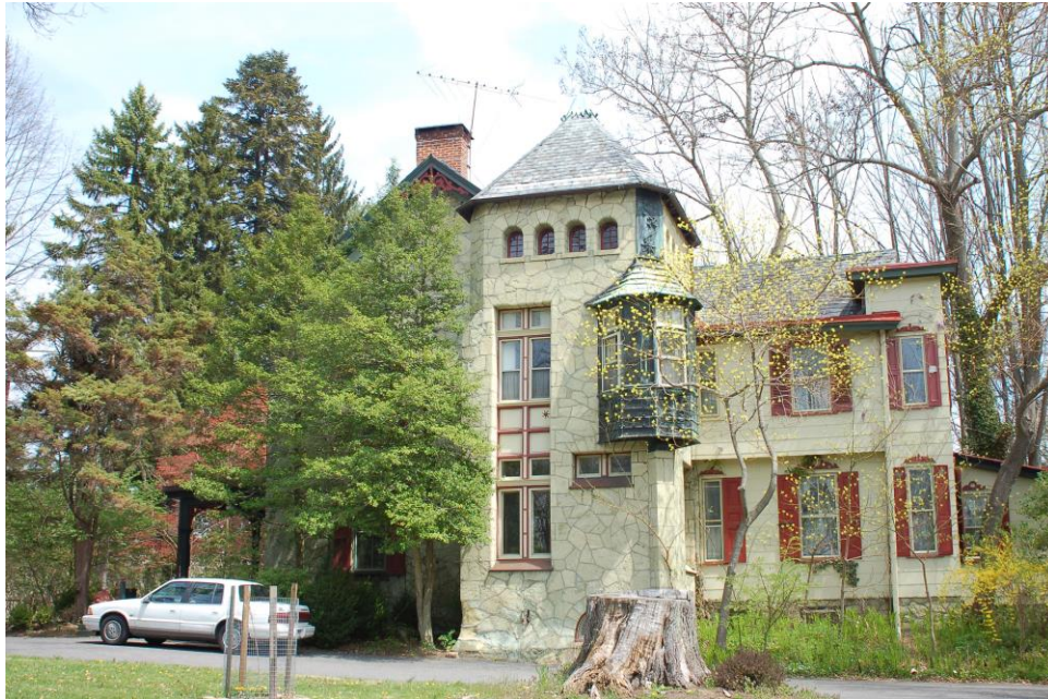
West Elevation, House