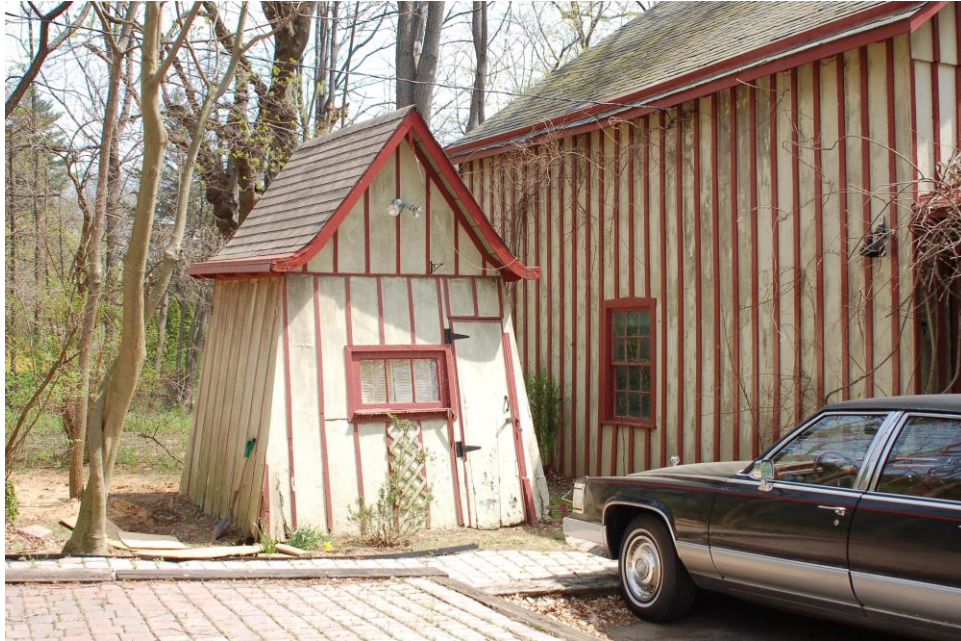
East and North (front) Elevations, Privy