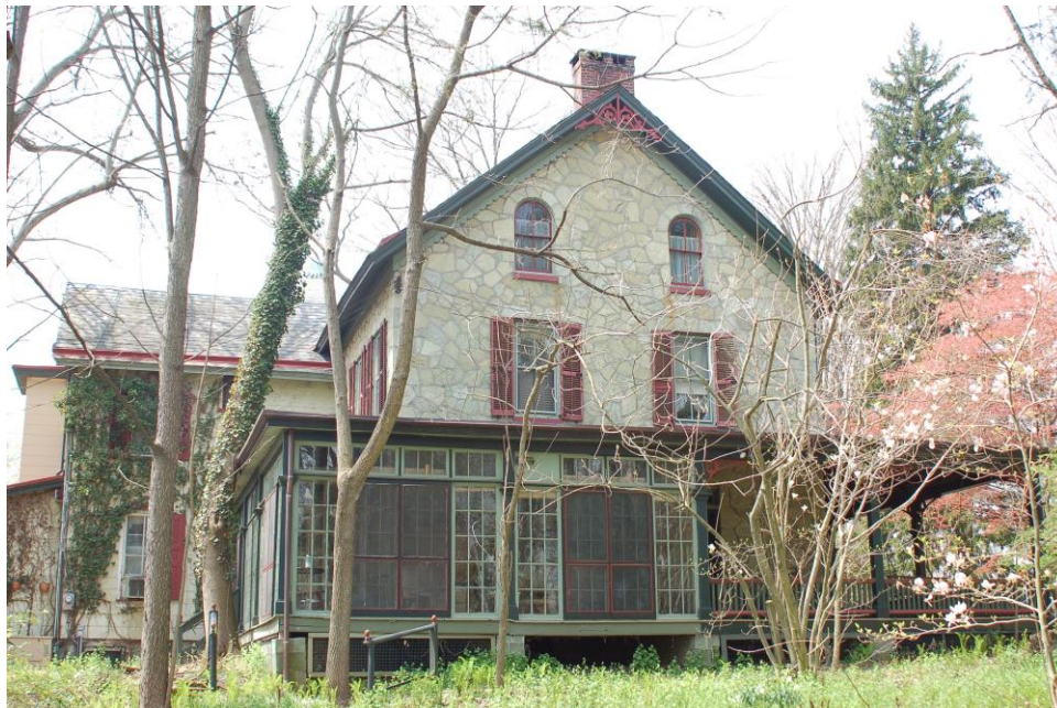
East Elevation, House