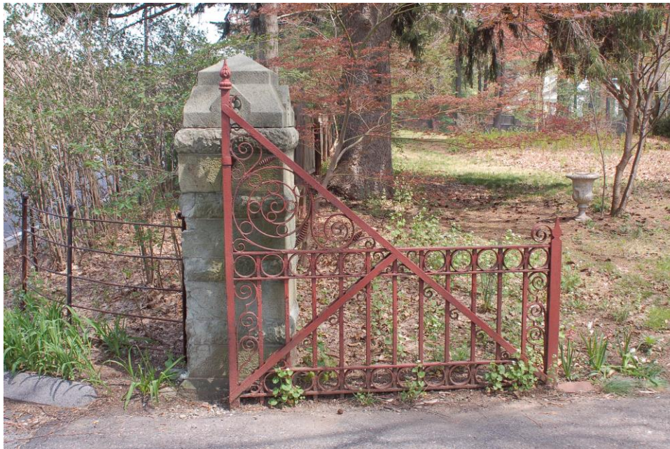
East Half, Iron Driveway Gate, Looking East